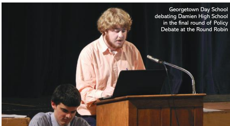
Georgetown Day School debater Damien High School in the final round of Policy Debate at the Round Robin

Each February, the College Preparatory School hosts The California Round Robin, the premier policy debate round robin competition on the West Coast, just before the California Invitational at the University of California at Berkeley. In 2011, with support from the Julia Burke Foundation, College Prep expanded the scope of the competition by adding Lincoln Douglas and Public Forum debate. Twelve of the top Policy Teams, Lincoln Douglas debaters, and Public Forum teams came to the Bay Area for the event, including debaters from as far away as Washington, D.C., Florida, and Maryland. A total of sixty debaters from ten states competed in the round robin. This competition is unique in the world of high school debate because experts on the topics being debated evaluate the final round debates. Video of the final round and post debate critique is available online at http://nfltv.org/2011/02/24/cal-round-robin-policy/ . For more information, email lexy@thecollegepreparatoryschool.org .