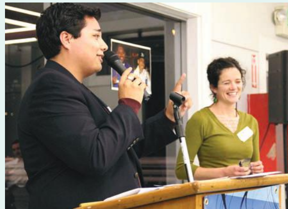
Participants at the BAUDL League Championships 2011

The Summer Institute, the Travel Scholarships, and the League Championships that The Julia Burke Foundation make possible are crucial pillars for the work we do. As we grow in our capacity to serve more students, to send our varsity debaters out to debate on the national circuit, and even to contribute to their research skills and their commitment to solving the problems of the communities around them, BAUDL and The Julia Burke Foundation keep these pillars standing. For more information, visit www.baudl.org .