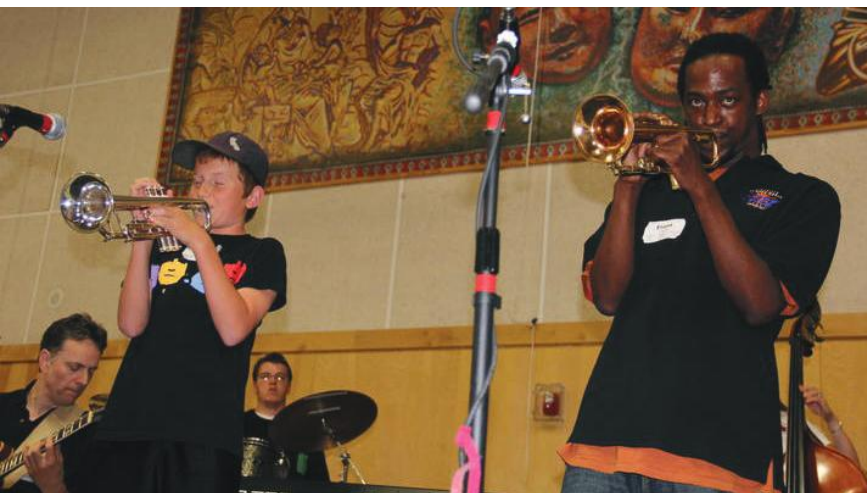
Participants at the Lafayette Summer Music Workshop

For more information, visit www.generationsinjazz.org .