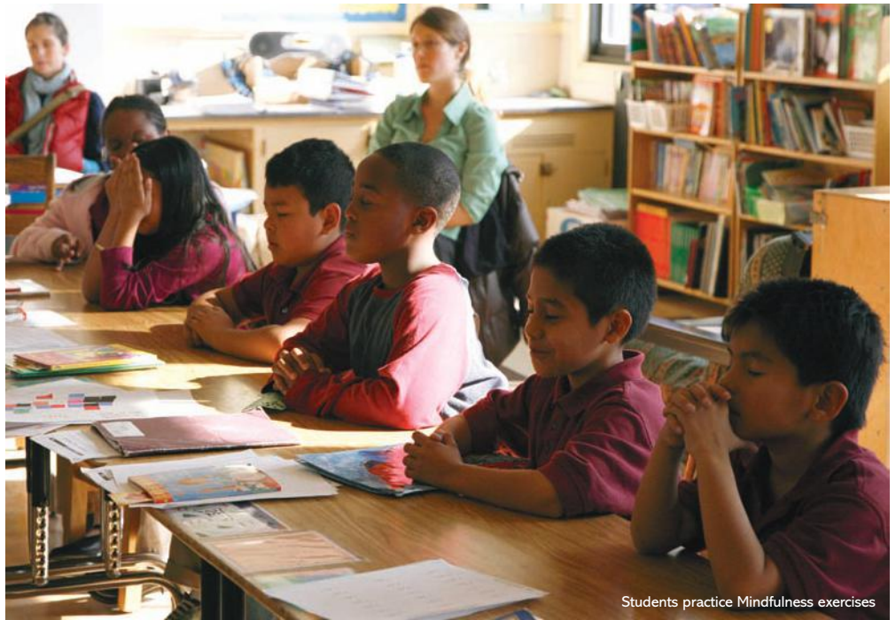
Students practice Mindfulness exercises

After learning to put on a mindful body—a technique for increasing focus and awareness—a 2nd grader raised his hand and said, “I feel like $1,000 dollars.” And after a minute of focusing on her breath, a 5th grader said, “I feel relaxed and I don’t feel mean.”