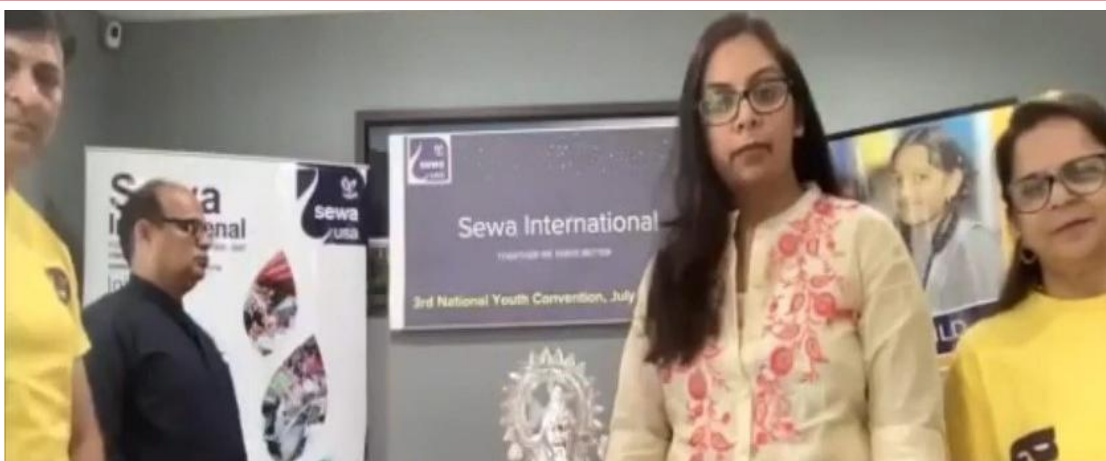
Sewa's LEAD volunteers at the National Youth Conference 2023

The third National Youth Conference, hosted by LEAD, brought together nearly 800 students from all corners of the US for a virtual event on July 29. One of the conference's highlights was attracting about 1500 viewers via live stream on Facebook.