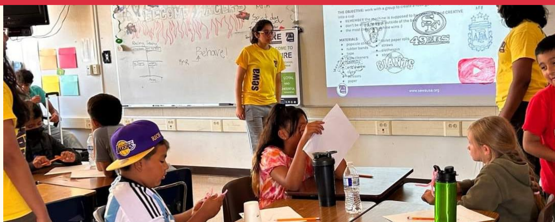
ASPIRE volunteers and students involved in an activity

Sewa International has been awarded the prestigious AmeriCorps Public Health Grant for Mental Health Program, alongside the Achieving Students Progress, Instilling Resilience, and Excellence (ASPIRE) grant for their after-school program.