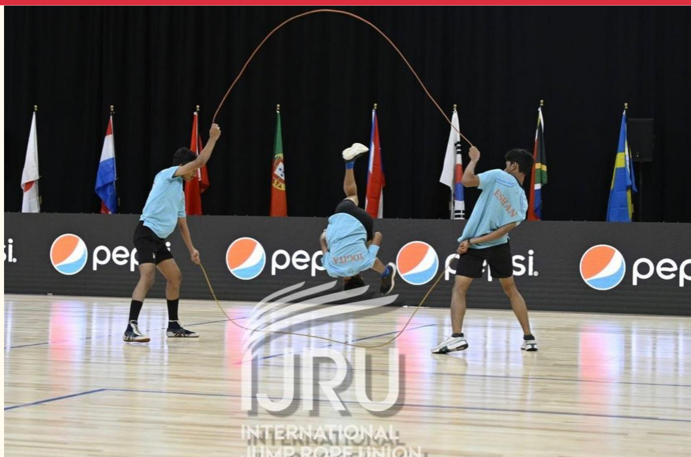
Indian athletes participated in the World Jump Rope Championships in Colorado

The Indian Jump Rope athletics team participated in the 2023 World Jump Rope Championships held from July 16 to 23 at Ed Robson Arena, Colorado College, in Colorado Springs, Colorado. The event hosted over 1,200 athletes from 27 nations competing in various categories.