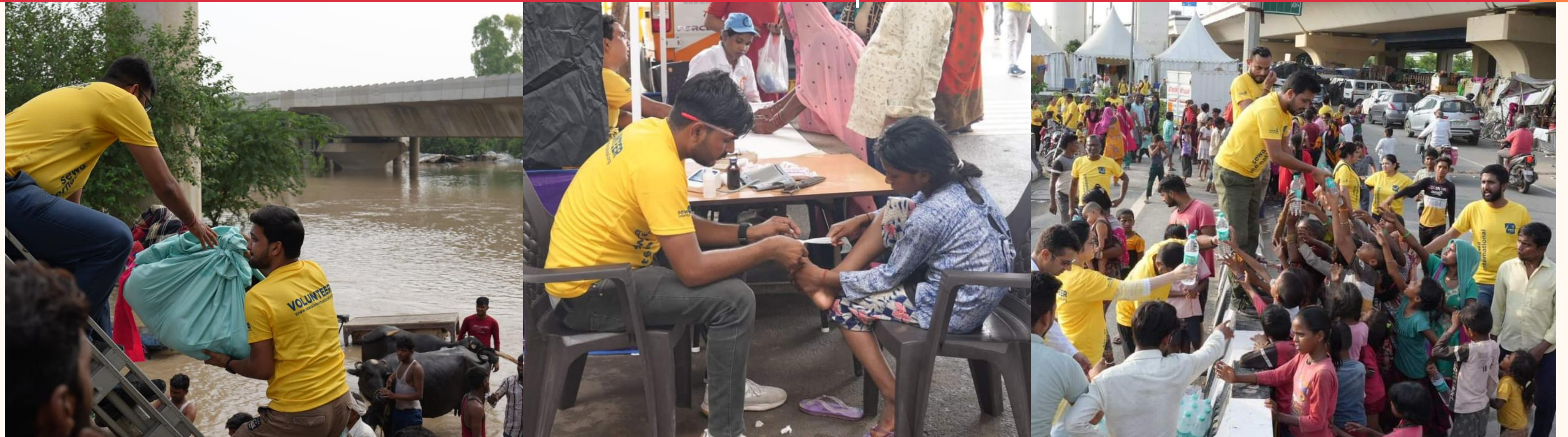
Sewa volunteers helped the flood affected families by evacuating them from low-lying areas, providing free medical assistance, and distributing essential items in India.

Ten months ago, Sewa International spearheaded an initiative to forge policy recommendations concerning "service, philanthropy, and volunteerism," in collaboration with the worldwide civil society consortium, C20 or Civil20. The outcome of this endeavor is a compendium of insights amalgamated from over 200 global civil society organizations, culminating in 32 precise policy suggestions. These propositions have been conveyed to the Indian government and are currently under deliberation with G20 global leaders. Their culmination is eagerly anticipated at the G20 Global Summit scheduled for September 9-10 in New Delhi.