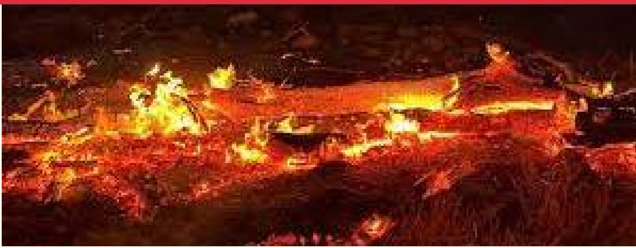
Raging wildfires swept through Maui, Hawaii.

The catastrophic wildfires that engulfed Maui, HI, on August ranks among the most destructive fires in the US over the past century.