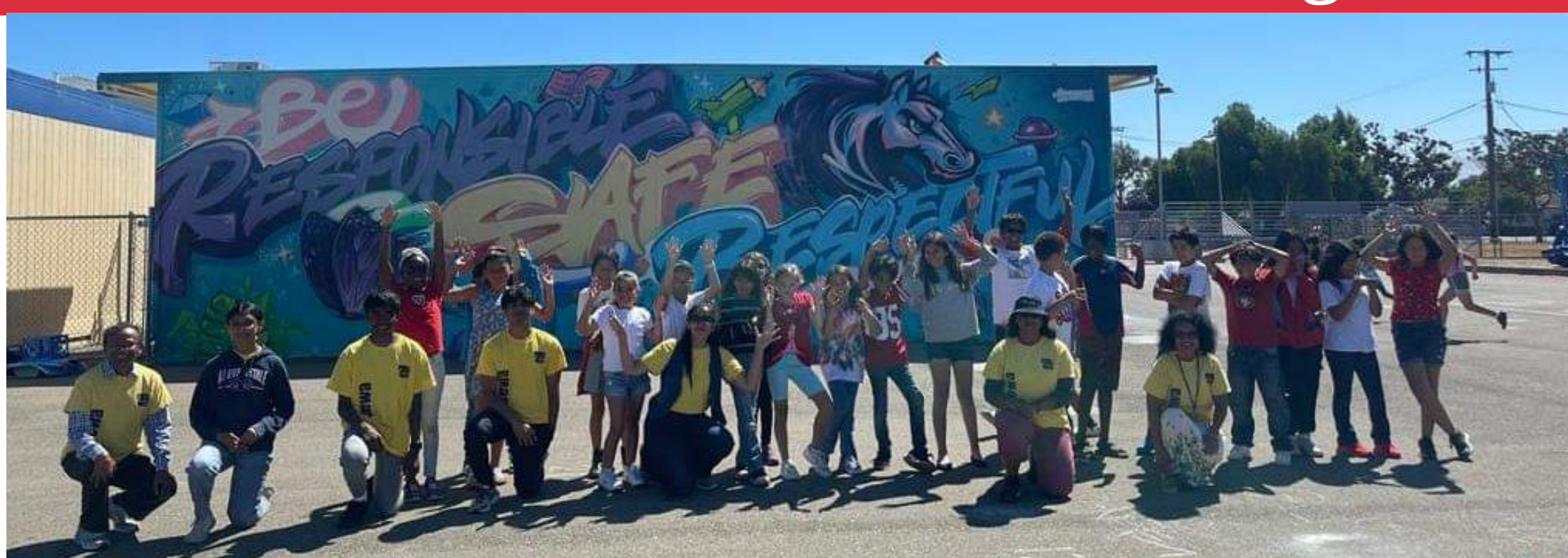
Students and volunteers at the ASPIRE summer school program in Newark, CA

ASPIRE has completed its seven-week summer school program, offering children an incredible and enriching experience. The program was held at Schilling and Lincoln Elementary Schools in Newark, CA.