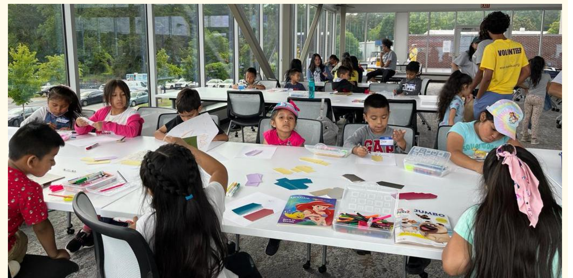
Children immersed in engaging activities

Sewa volunteers resolved challenges like transportation by organizing pickups and drop-offs. The program's economic impact exceeded $400,000, covering transport, meals, and enriching activities, offering a secure environment for children and respite for parents.