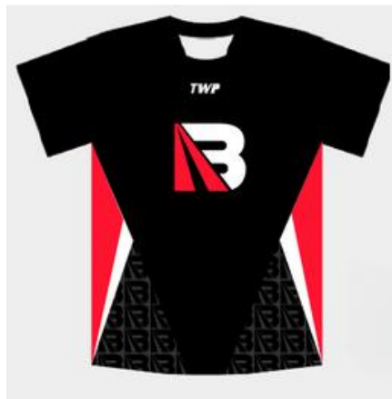
Optional Training Top $15 (Limited)