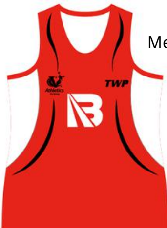
Men's Singlet $35