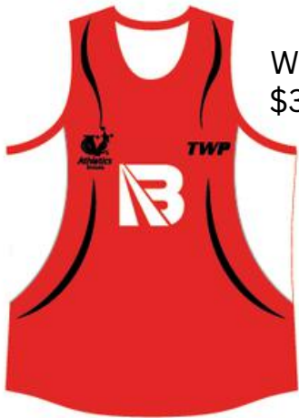
Women's Singlet $35