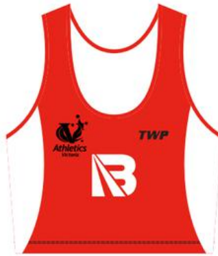
Women's Crop Top $35