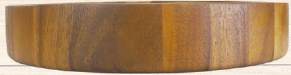
HA0506 10x2" HA0507 14x2"