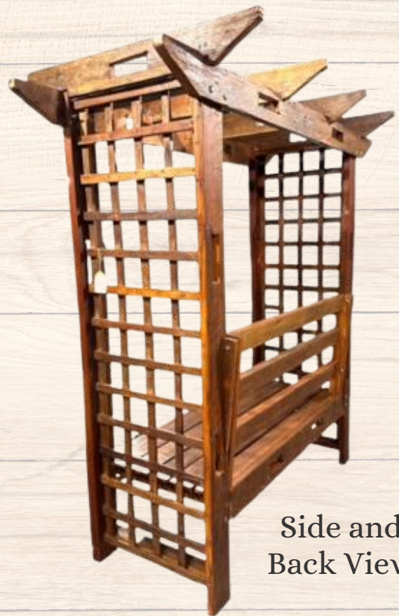
Side and Back View