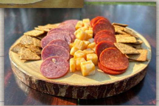
HA5014 12x2" HA5017 16 x 1"