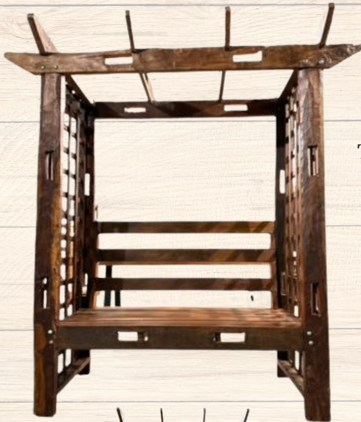
HA4801 24x75x79" Trellis w/Bench