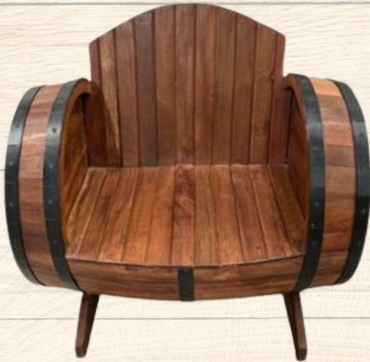
HA4806 30X35X34" Wine Barrel Chair