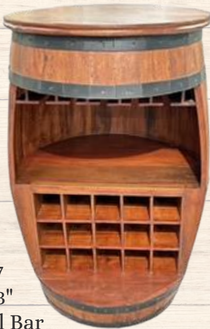
HA4807 29x27x43" Wine Barrel Bar