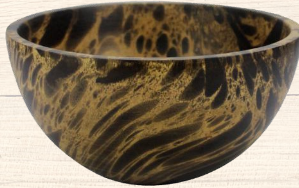
HA0138 8" dia