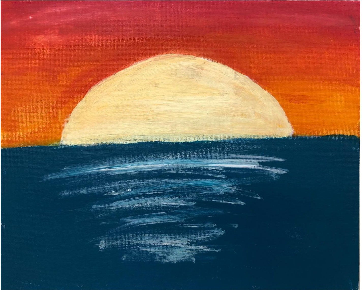
Claire Steidl , Paradise , acrylic on canvas, 9 1/2 x 7 in.