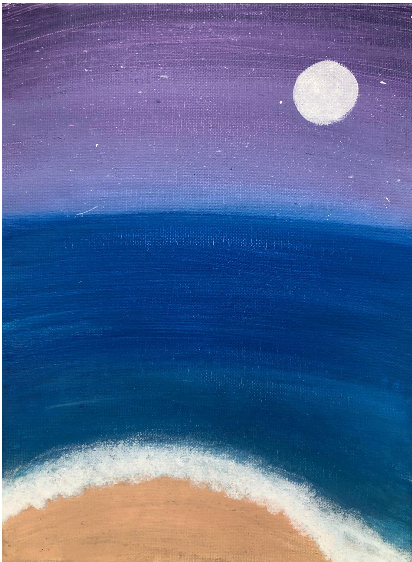
Claire Steidl , What's Mine is Yours , acrylic on canvas, 12 x 9 in.