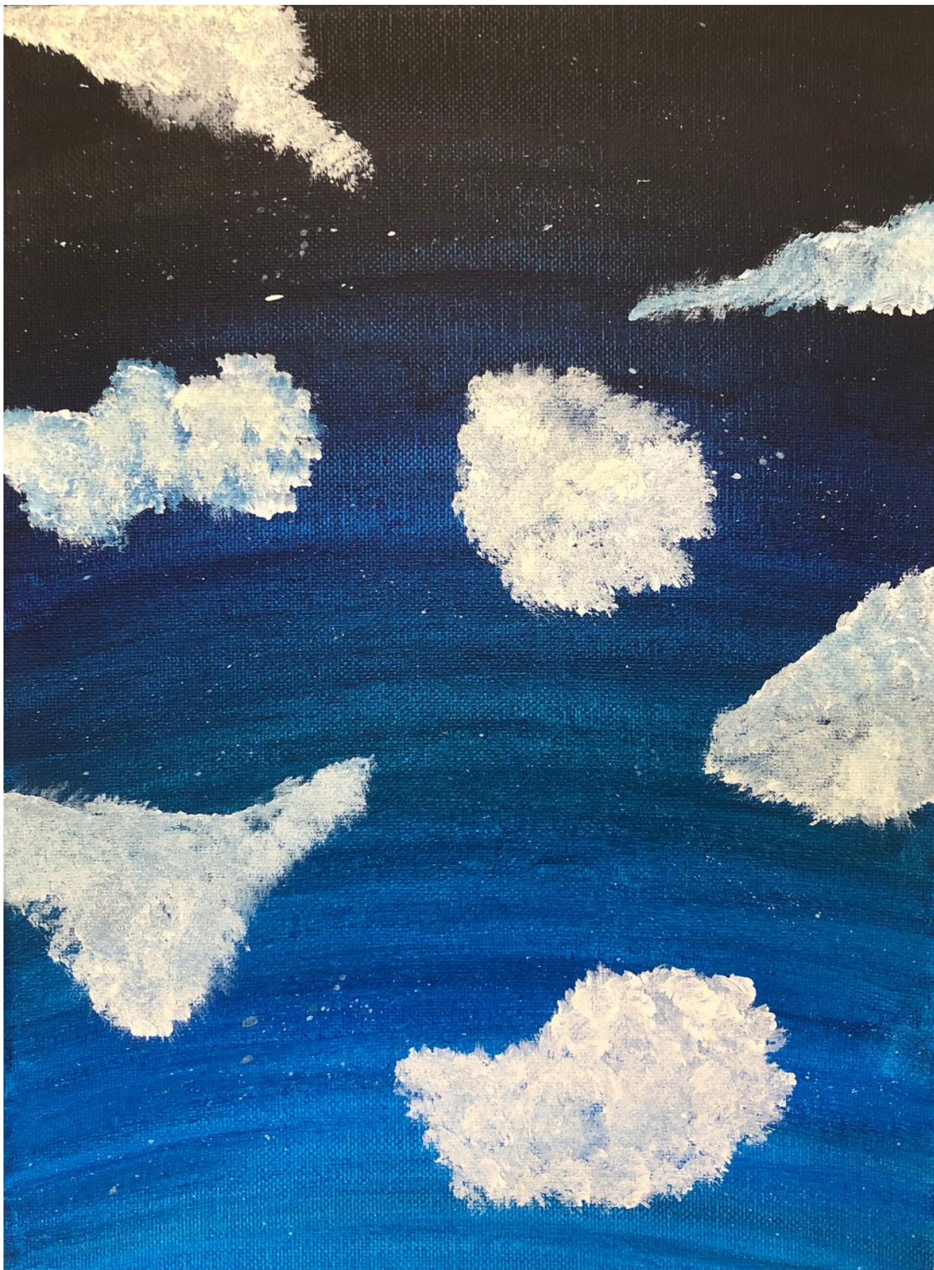
Claire Steidl , Almost Home , acrylic on canvas, 12 x 9 in.