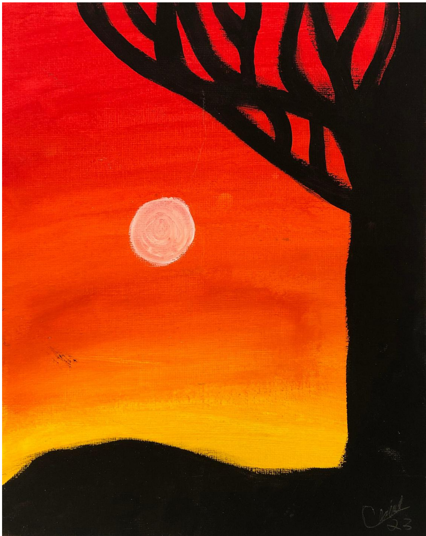
Claire Steidl , Thinking , acrylic on canvas, 9 1/2 x 7 in.