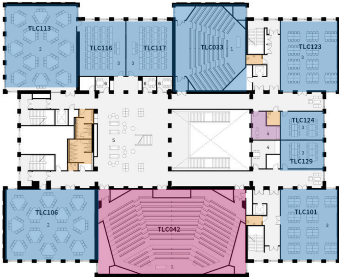
LEVEL 01 PLAN