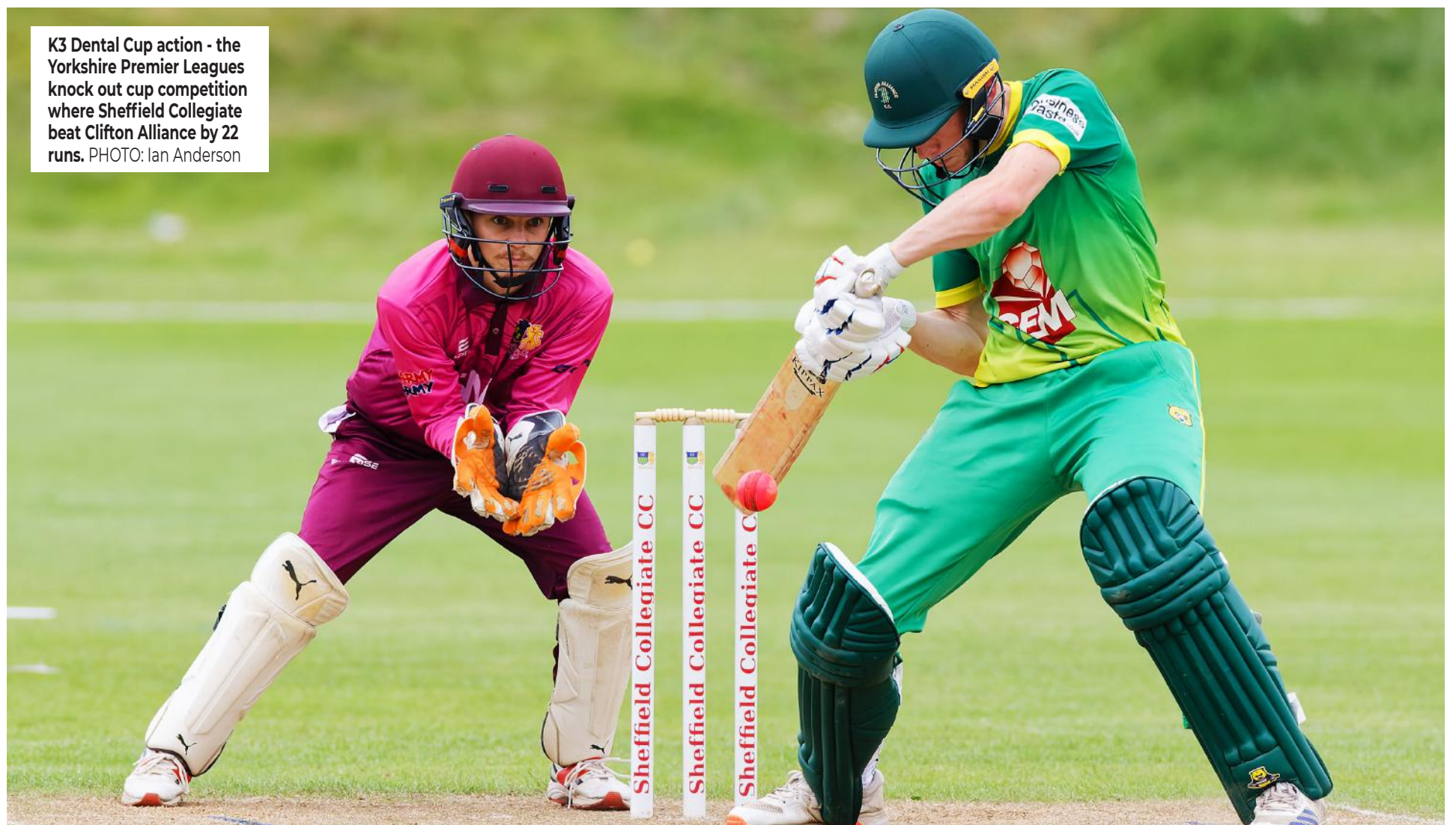
K3 Dental Cup action - the Yorkshire Premier Leagues knock out cup competition where Sheffield Collegiate beat Clifton Alliance by 22 runs.