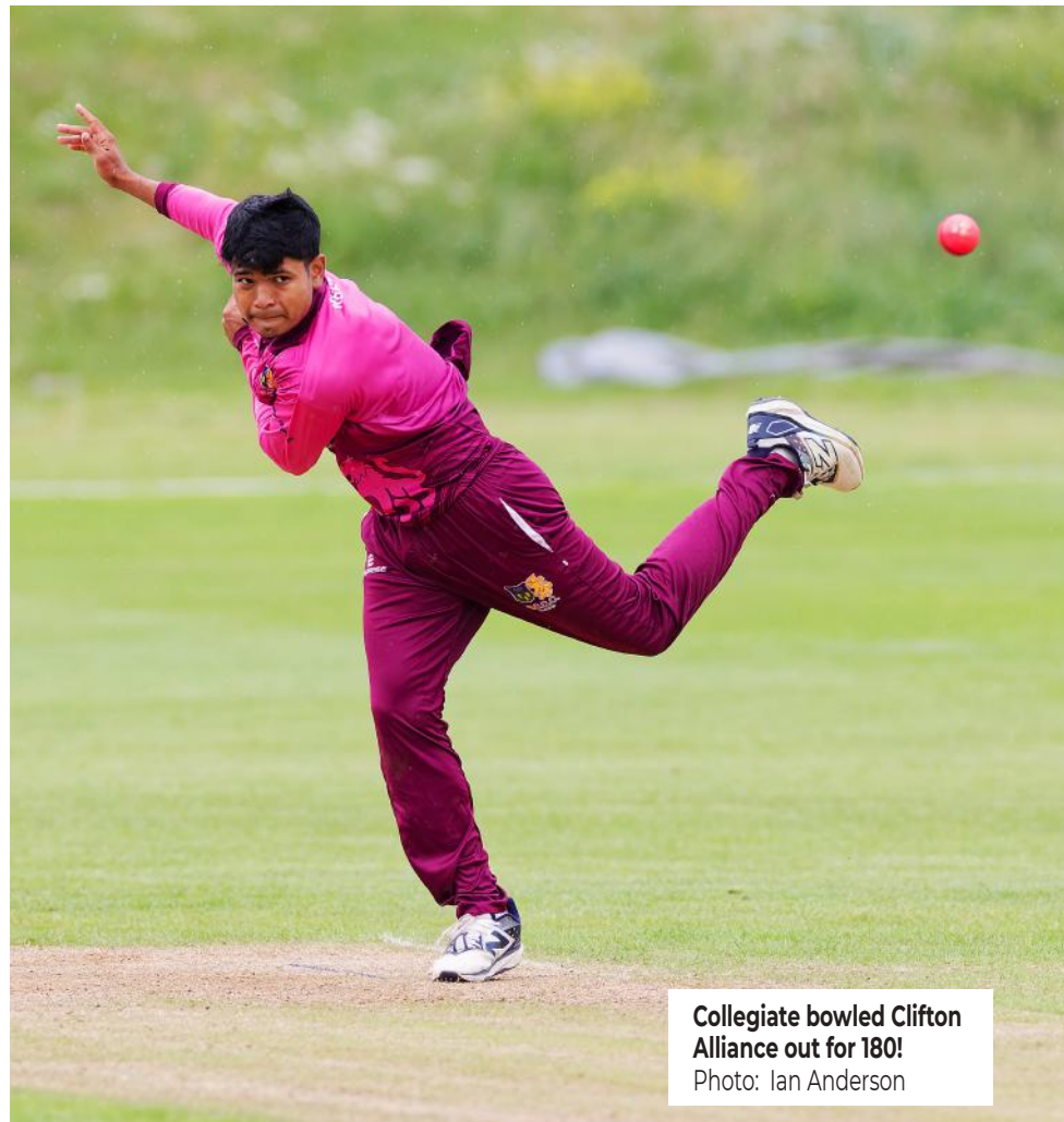
Collegiate bowled Clifton Alliance out for 180!