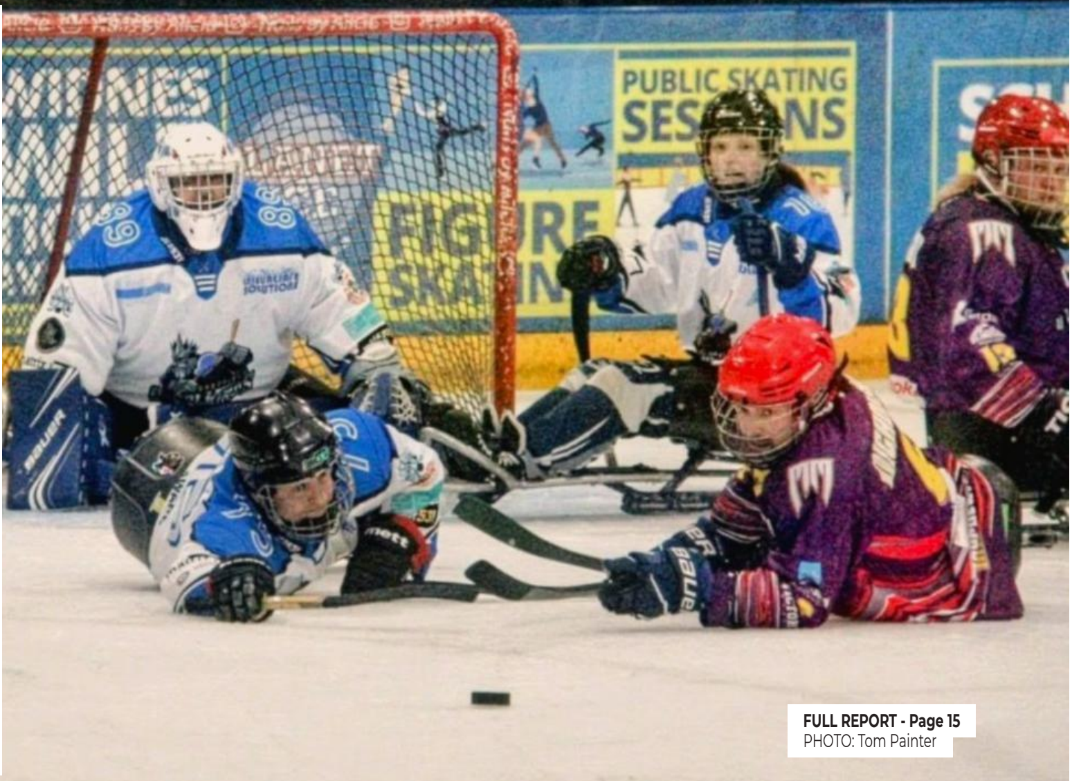
FULL REPORT - Page 15

The message to the rest of the league is clear — the Kings mean business again.