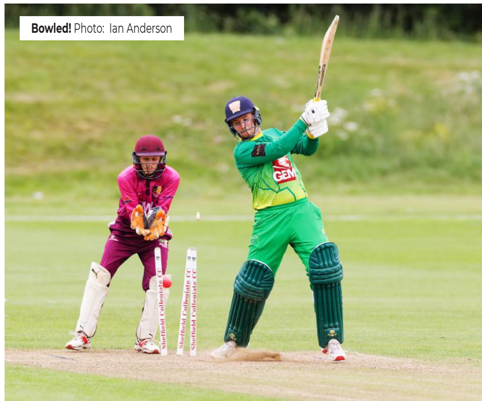
Bowled!