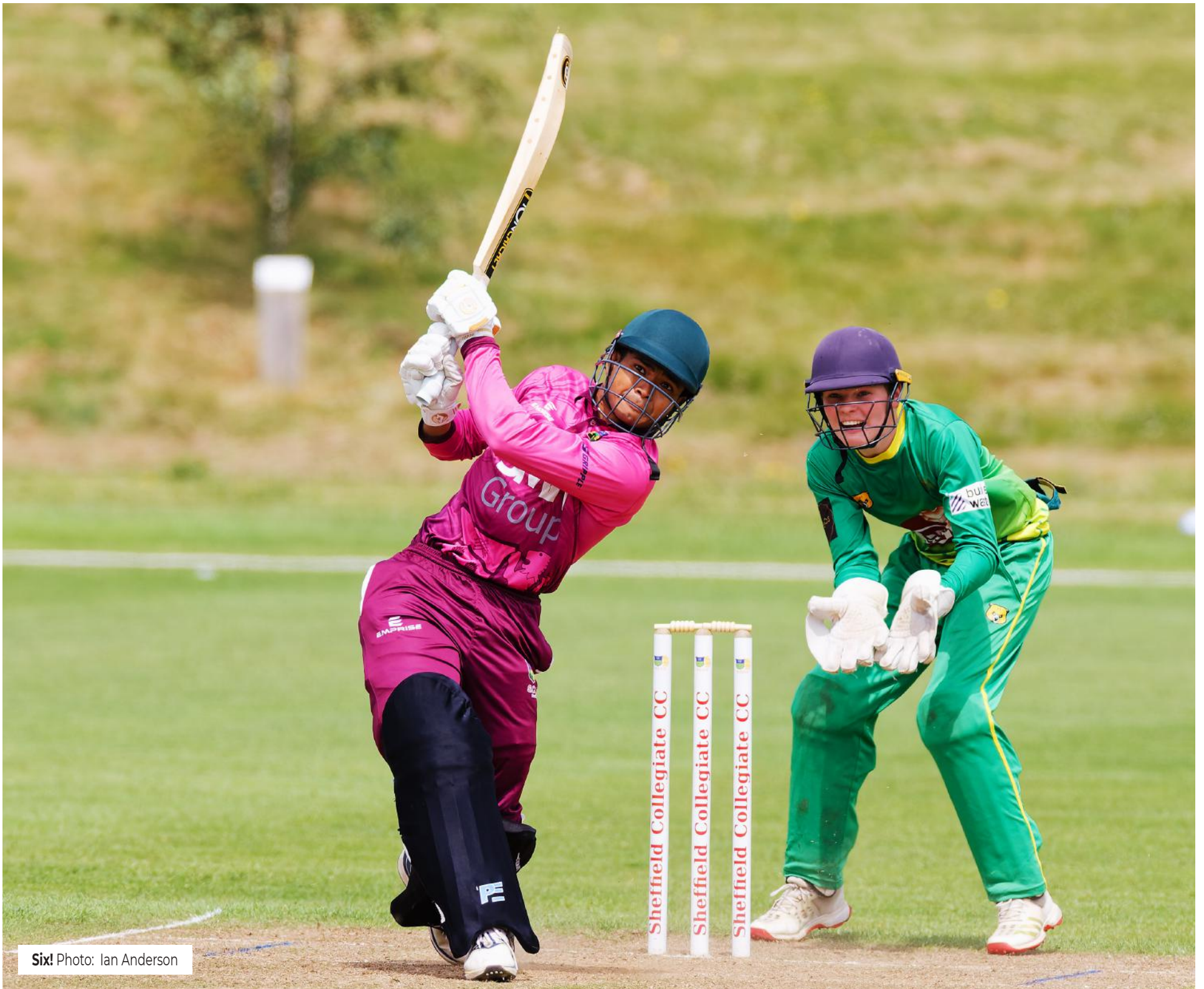
Six!