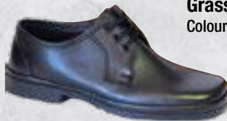
Grasshopper W-5206 Colours: Black only • Soft toe • Sizes: 5 - 12