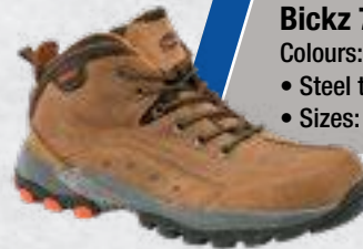
Bickz 753 F-893-4403 Colours: Brown leather • Steel toe cap 200J • Sizes: 5 - 12