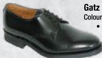
Gatz Parabellum D-10001 Colours: Black leather • Soft toe • Sizes: 5 - 12 SABS SAN 421