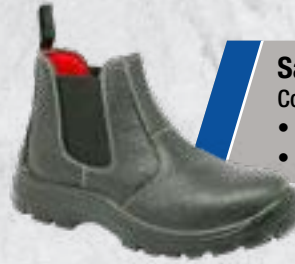
Sabre Chelsea F-855-6606 Colours: Black leather • Steel toe cap 200J • Sizes: 5 - 12