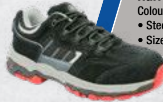
Hurricane F-823-6203 Colours: Black suede • Steel toe cap 200J • Sizes: 5 - 12