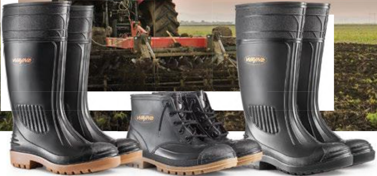
Egoli 1 W-1270 Sizes 5 - 14 Steel toe cap