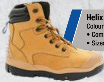
Helix Boot F-894-3303 Colour: Wheat Nubuck • Composite toecap • Sizes 5 - 12