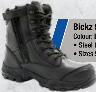
Bickz 907 Boot F-893-6604 Colour: Black leather • Steel toecap • Sizes 5 - 12