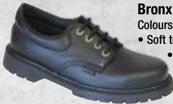
Bronx Chunky J-7363 Colours: Black only • Soft toe • Sizes: 6 - 12