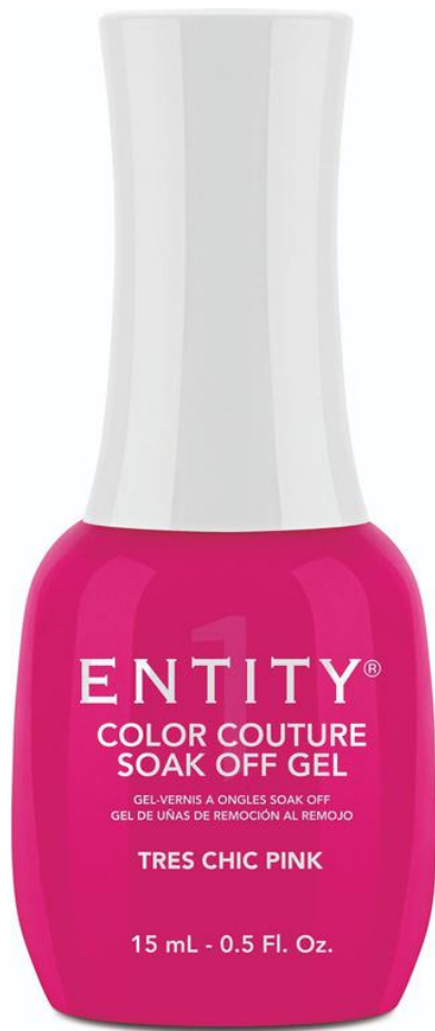
Tres Chic Pink