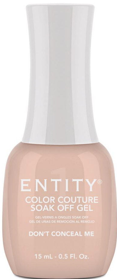
Don't Conceal Me