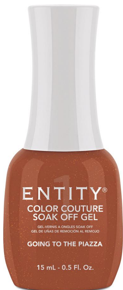
GoingTo The Piazza