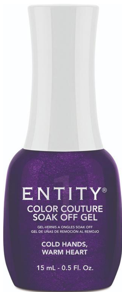
Cold Hands, Warm Heart