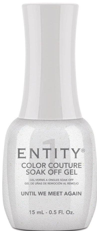
Until We Meet Again