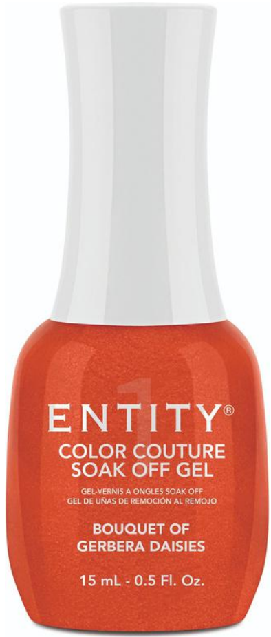
Bouquet Of Gerbera Daisies