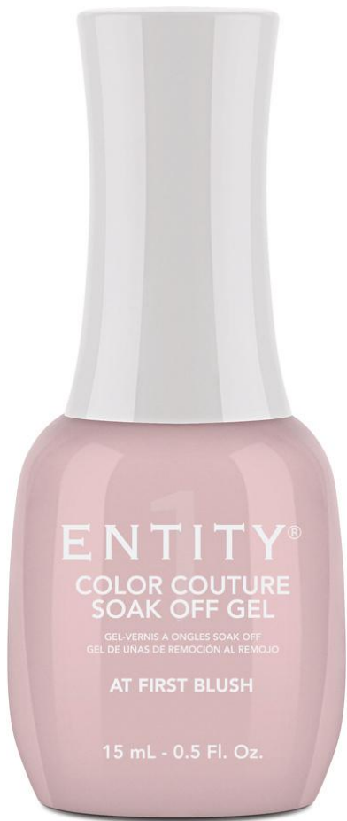
At First Blush