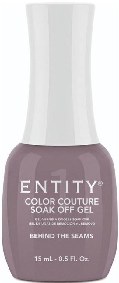
Behind The Seams