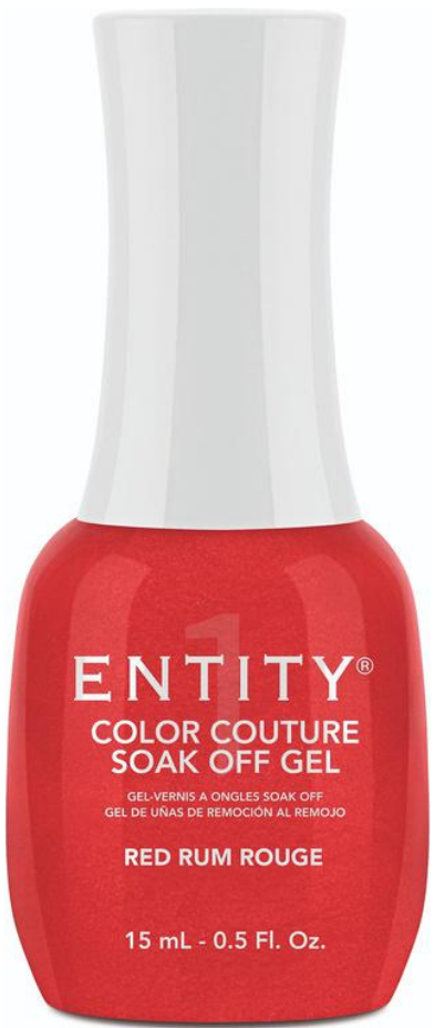
Red Rum Rouge