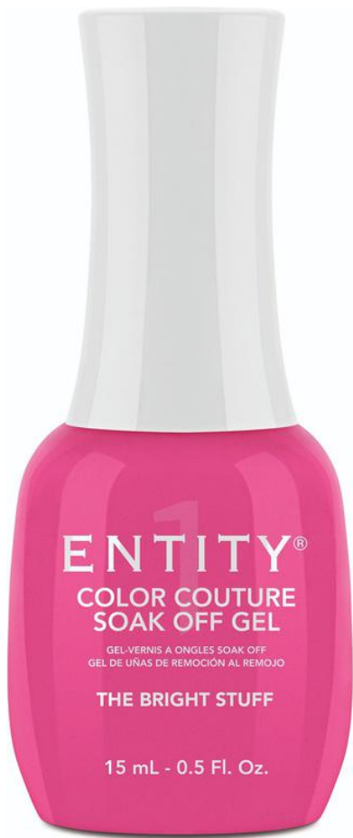
The Bright Stuff