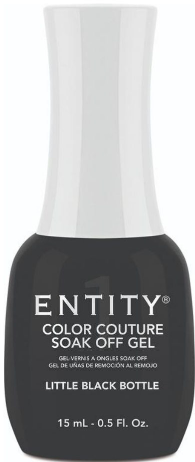
Little Black Bottle