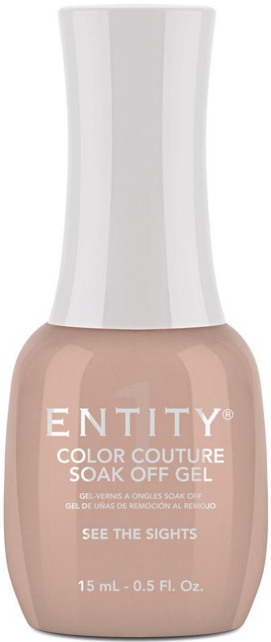
See The Sights