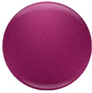
I Decide My Vibe