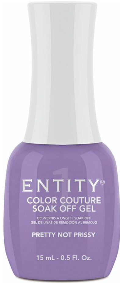
Pretty Not Prissy