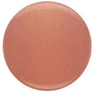
Find Your Fire