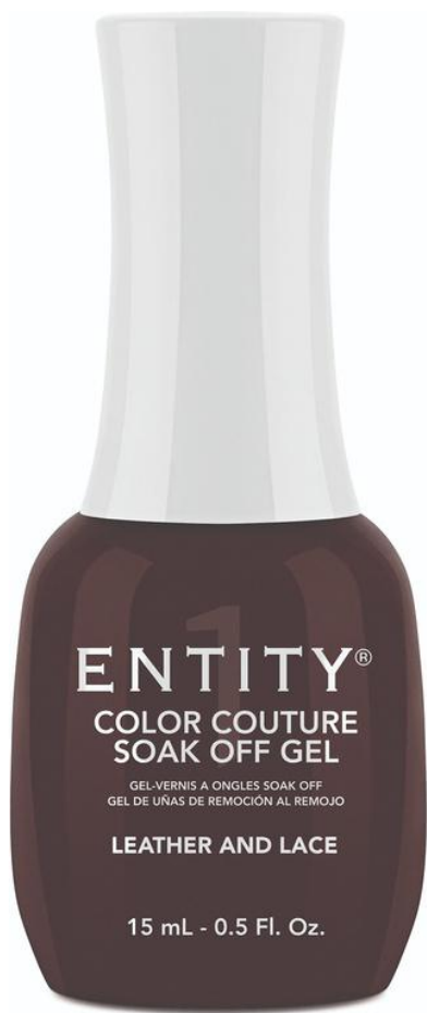
Leather And Lace