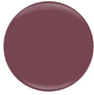
On Cloud Nine