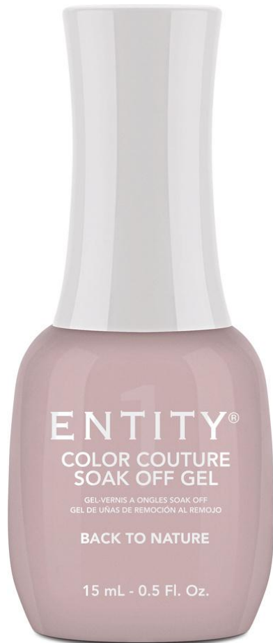
Back To Nature