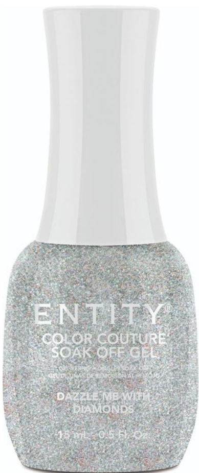
Dazzle Me With Diamonds