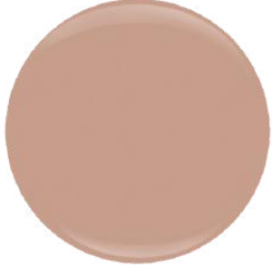
See The Sights