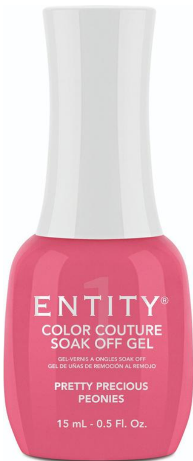
Pretty Precious Peonies