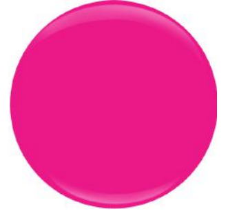
Is This For Me ?