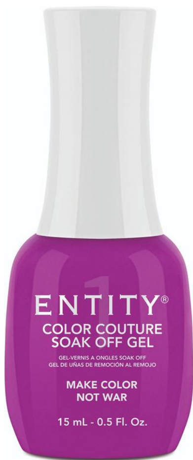
Make Color Not War