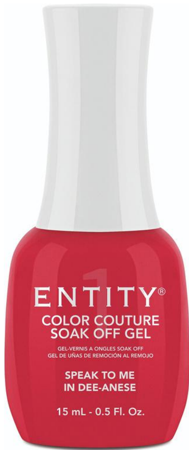
Speak To Me In Dee-Anese