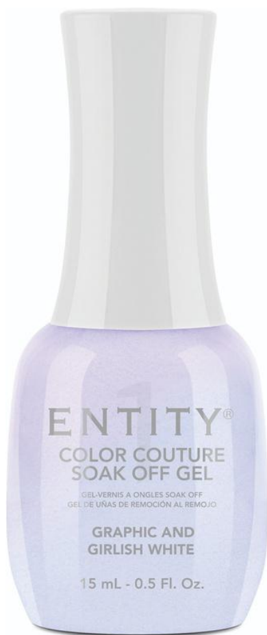
Graphic And Girlish White