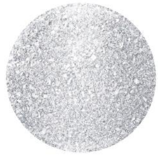
Always In Season