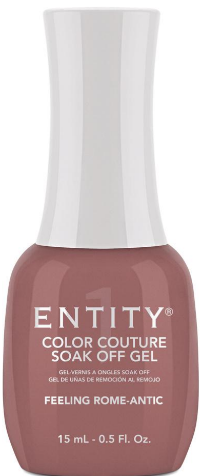
Feeling Rome- Antic