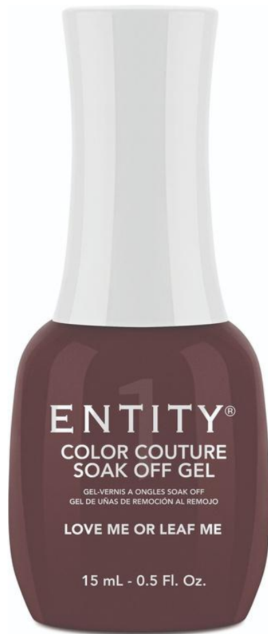
Love Me Or Leaf Me