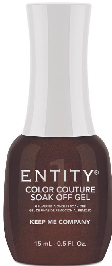
Keep Me Company