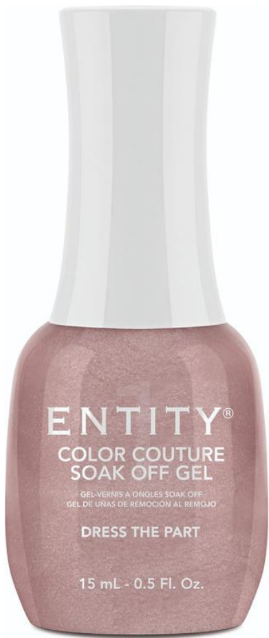
Dress The Part