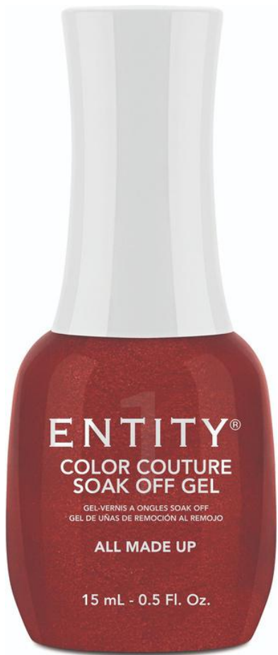
All Made Up