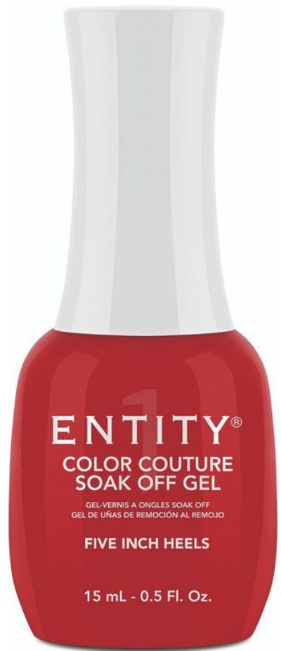
Five Inch Heels