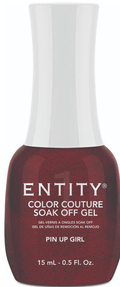
Pin Up Girl