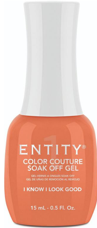
I Know I Look Good