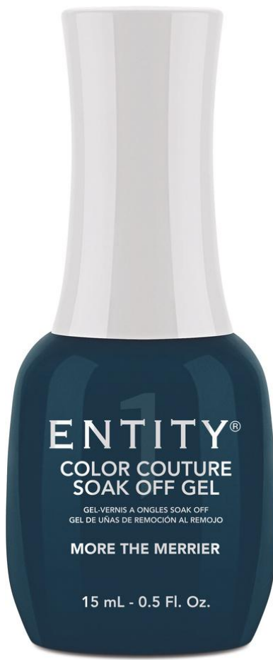
More The Merrier