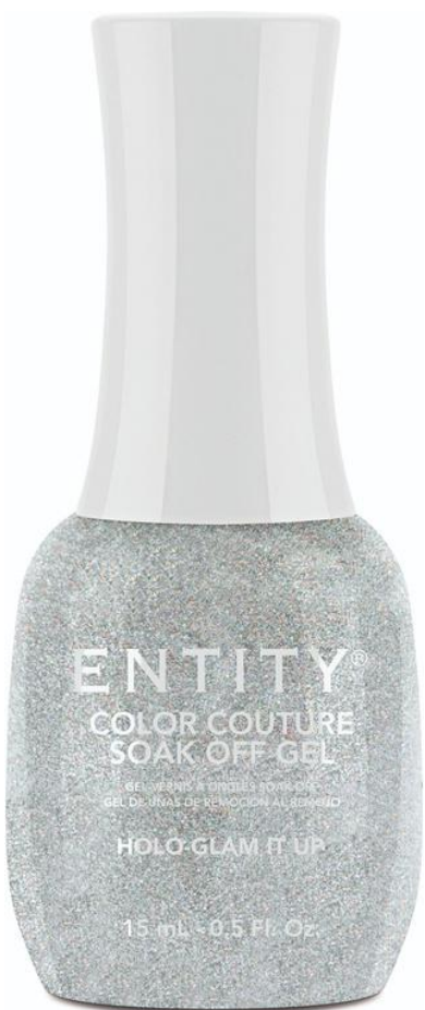
Hologlam It Up