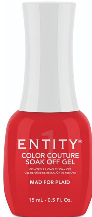
Mad For Plaid