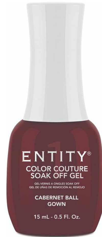
Cabernet Ball Gown