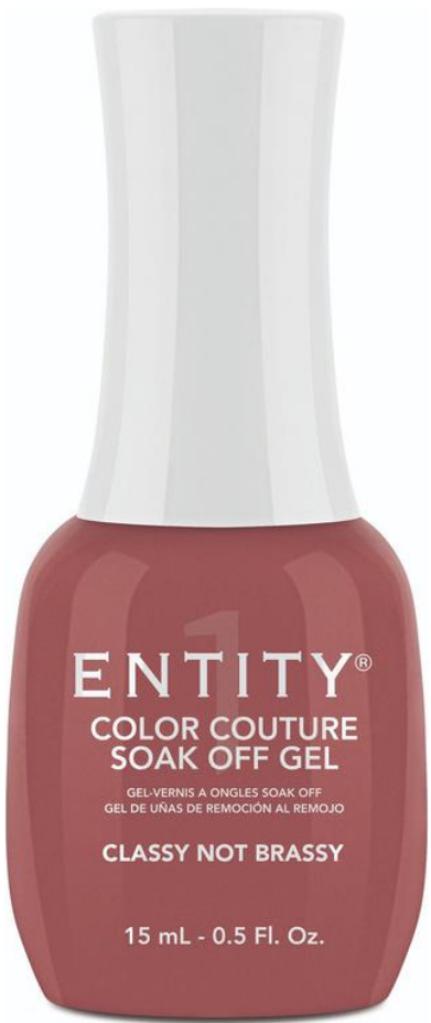
Classy Not Brassy