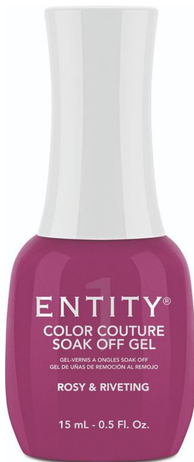
Rosy & Riveting