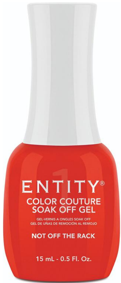
Not Off The Rack