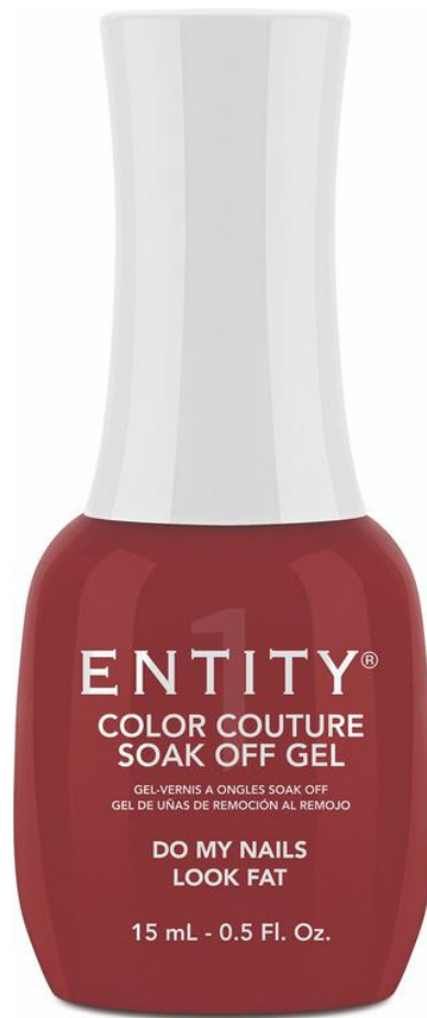
Do My Nails Look Fat