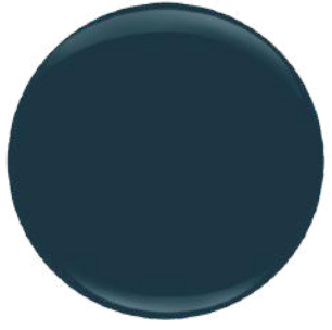
Carpe Diem Baby