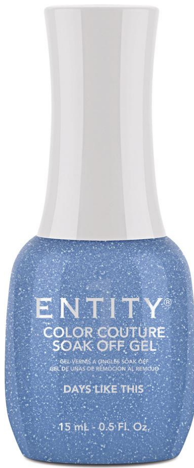
Days like this