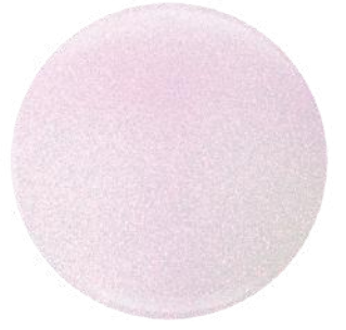
Meet Me At The Trevi Fountain