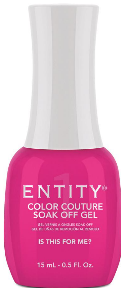
Is This For Me ?