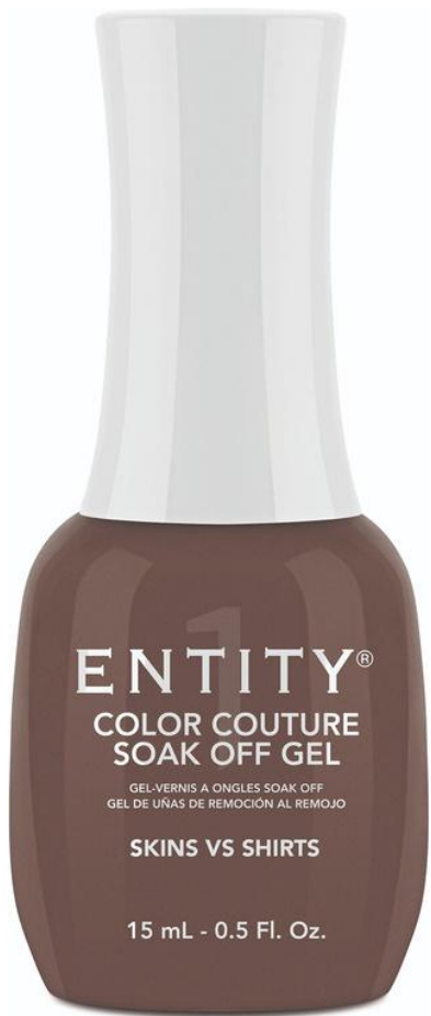
Skins Vs Shirts