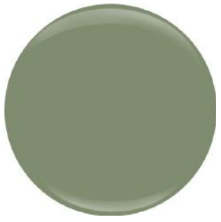
Why Not ?