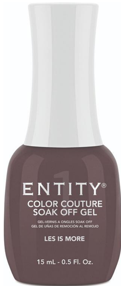
Les Is More