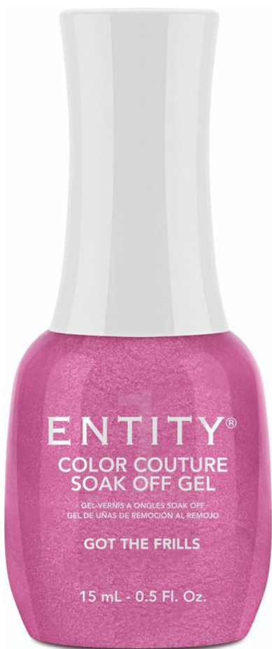
Got the Frills