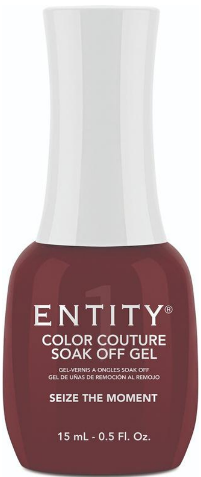
Seize The Moment