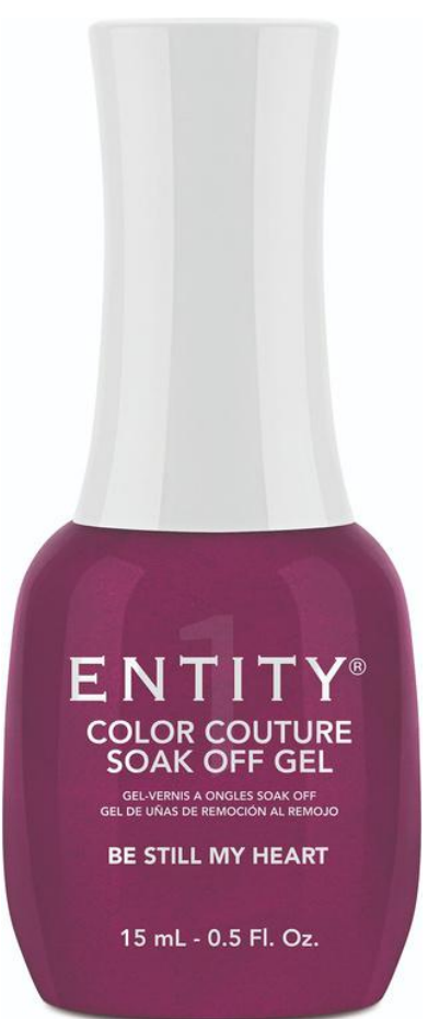
Be Still My Heart