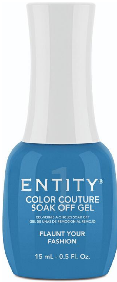
Flaunt Your Fashion