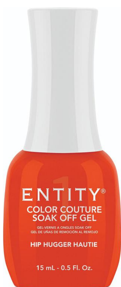
Hip Hugger Hautie