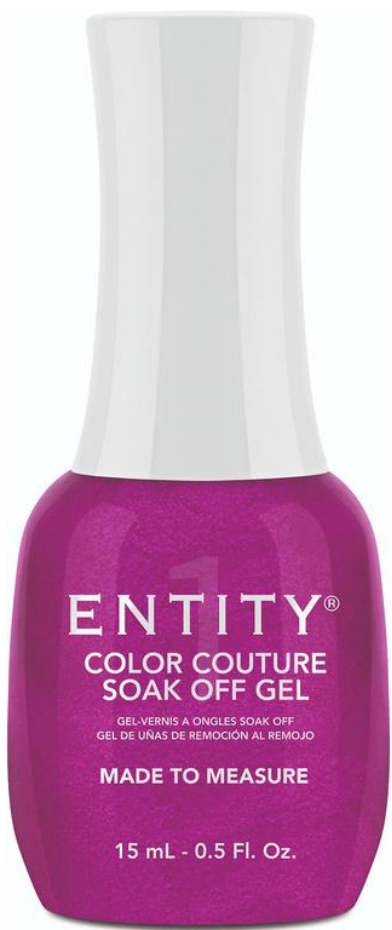
Made To Measure