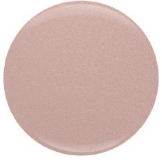
Cozy & Chic