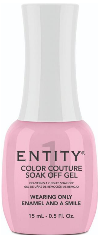
Wearing Only Enamel And A Smile