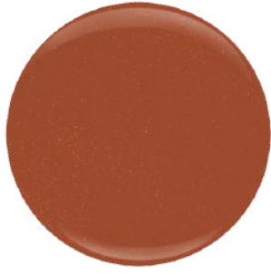
Going To The Piazza