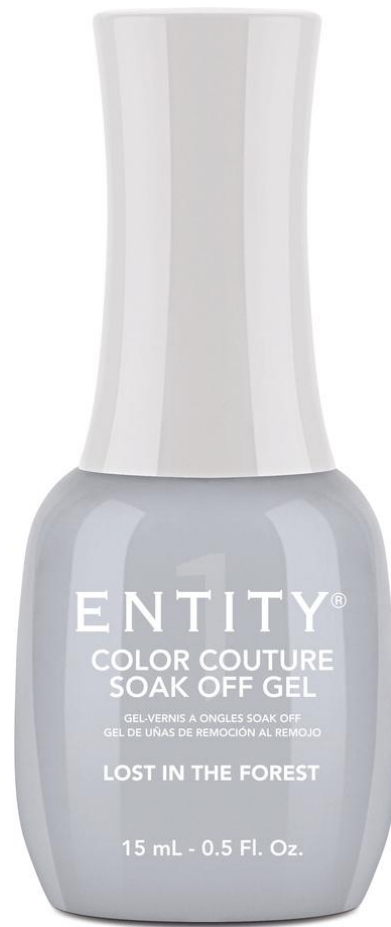
Lost In The Forest