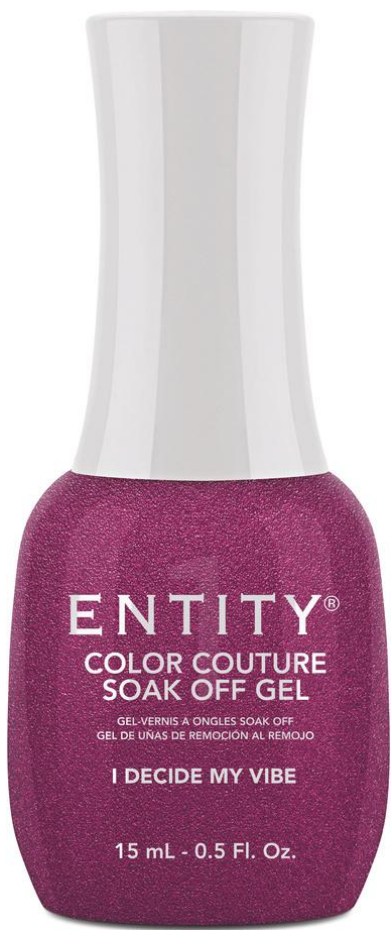
I Decide My Vibe