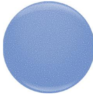
Days Like This