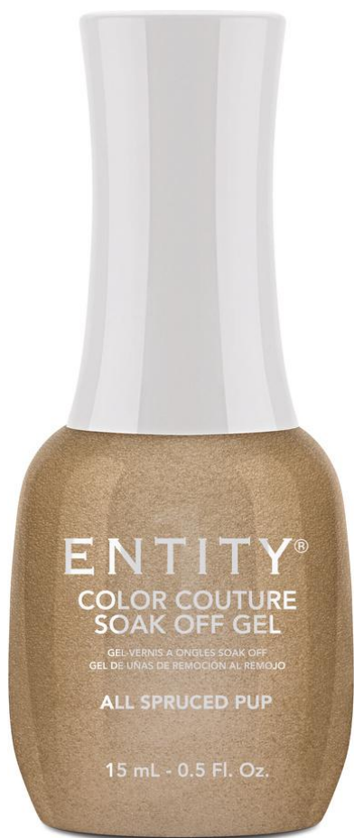
All Spruced Pup