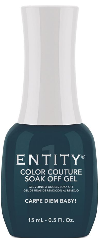
Carpe Diem Baby !