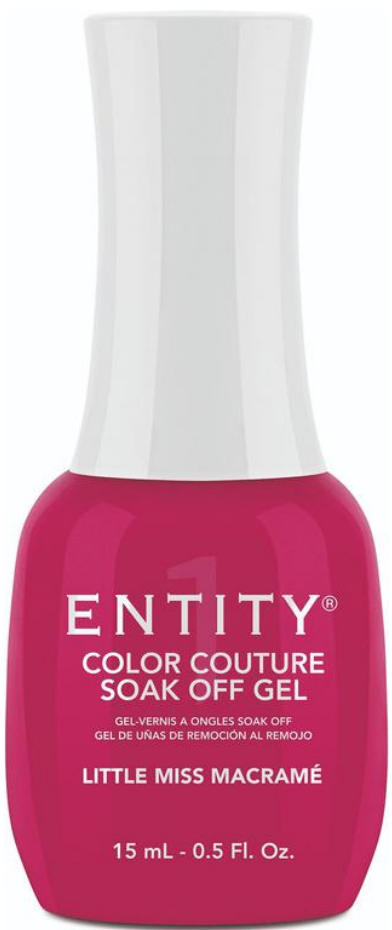
Little Miss Macramé