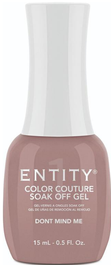
Dont Mind Me