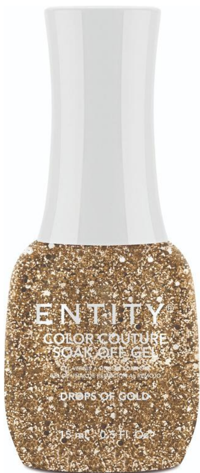
Drops Op Gold