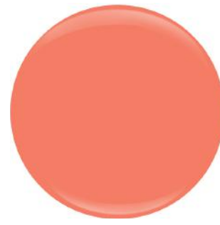
I'll take It