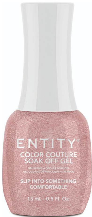
Slip Into Something Comfortable