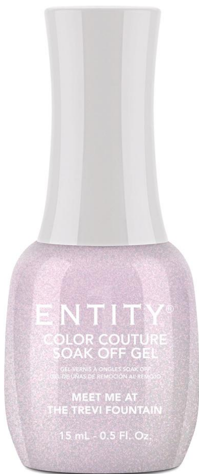
Meet Me At The Trevi Fountain