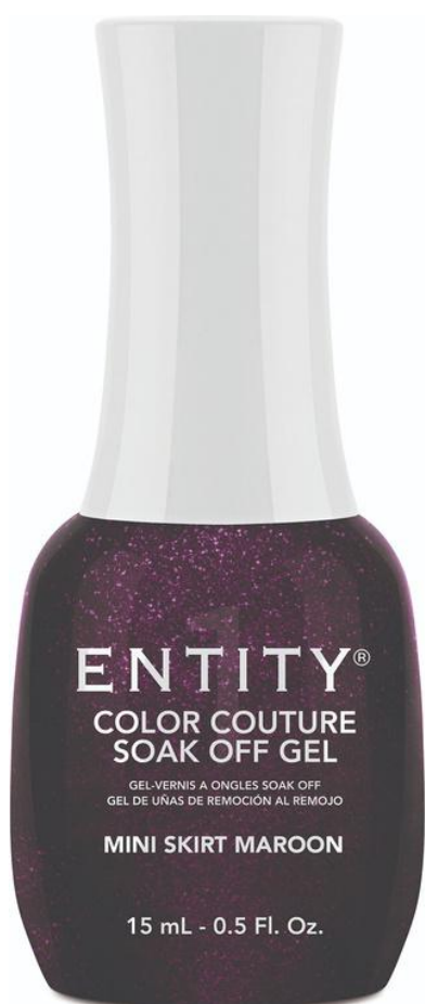
Mini Skirt Maroon