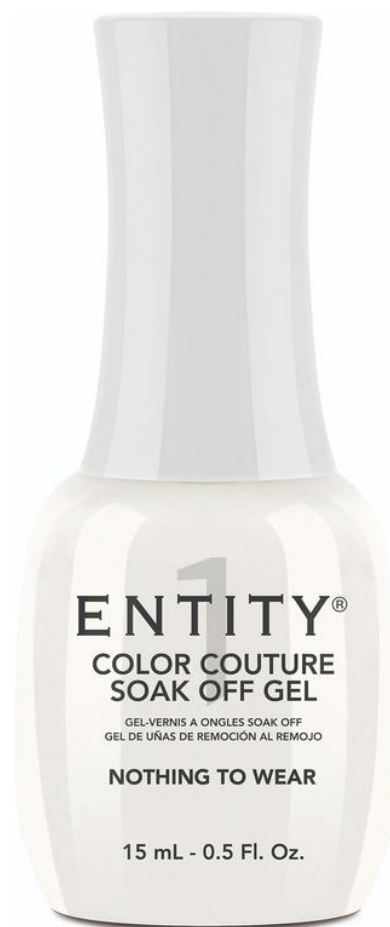
Nothing To Wear