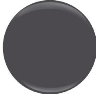
Brrring On The Snow