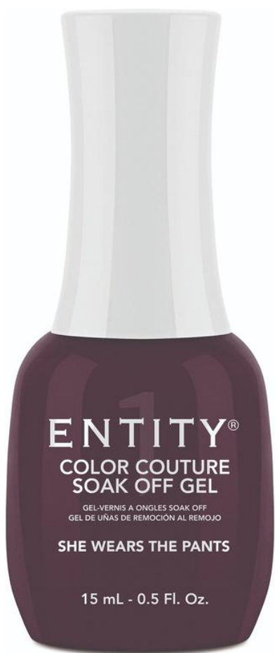
She Wears The Pants