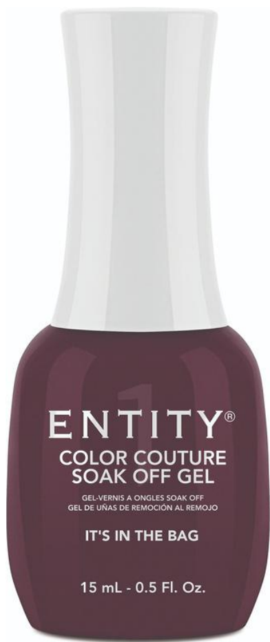
It's In The Bag