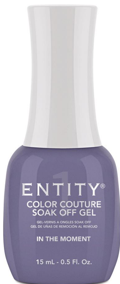
In The Moment