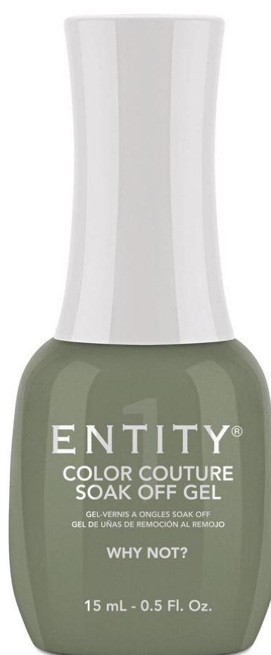
Why Not ?