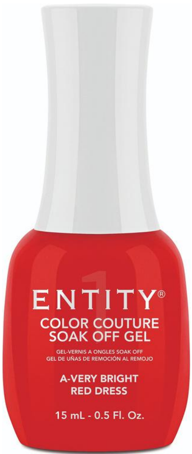
A-Very Bright Red Dress