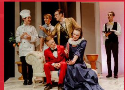
Bedford School boys on stage in a 10th anniversary performance of A Servant to Two Masters

Today, the Quarry Theatre is a cornerstone of Bedford's cultural life. It hosts a diverse programme of public performances - from drama and music to comedy and film - while offering Bedford School pupils a dynamic learning environment where creativity is nurtured, confidence is built, and professional-level productions come to life.