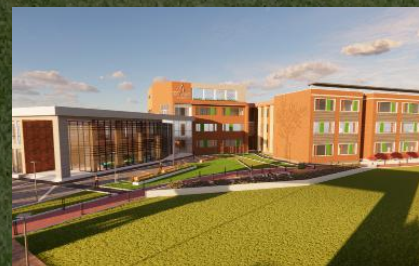
Architect's Impression of Bedford School Mohali