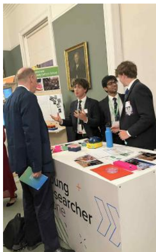
Bedford School boys with Prof Chris Whitty

The DNA Snowdrop Project exemplifies the school's commitment to real-world, research-led learning, with boys embracing the role of young scientists with professionalism and passion.