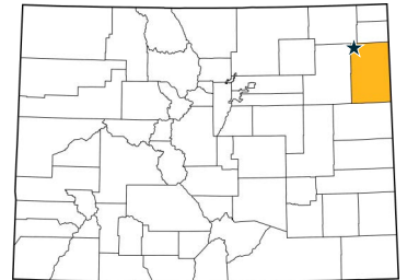
YUMA COUNTY, CO

Whether you're expanding your current operation or seeking a reliable ag investment, this tract delivers. Ideal for wheat, millet, or forage crops.