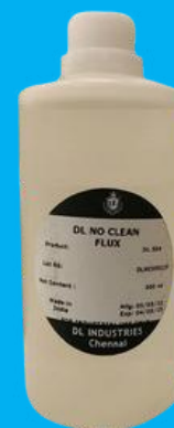
No Clean Liquid Flux 500ml