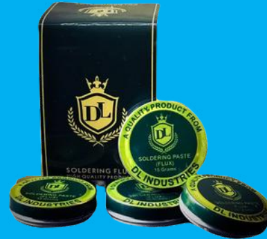
Solder Paste Flux 15 gms