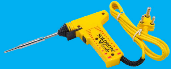
SI2550A 25-50W Gun Type Soldering Iron