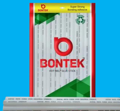
Bontek Milky Hot Melt Glue Sticks