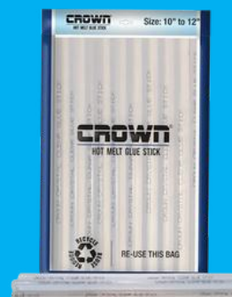
Crown Transparent Glue Stick