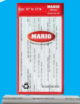
Mario Milky White Hot Melt Glue Stick