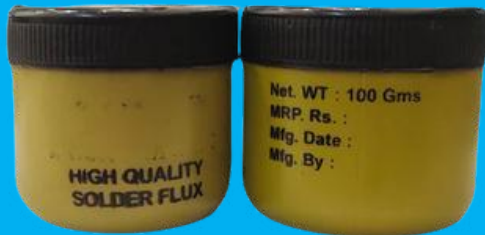
Solder Paste Flux 100 gms