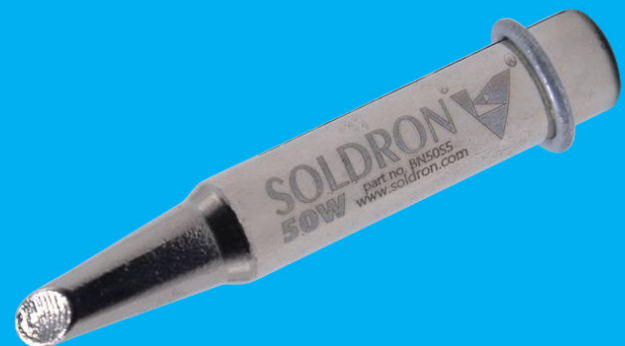
BN50S5 50W Nickel Plated Spade 5mm Bit