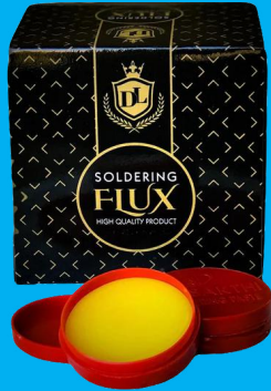
Solder Paste Flux