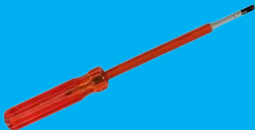
R6100i (Insulated) 2 in 1 Screw Driver