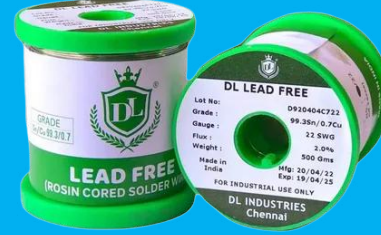
Lead Free Solder Wire Sn99.3/Cu0.7 22 SWG - 500 gm