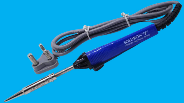
SI35A 35W / 230V Soldering Iron