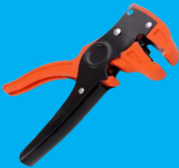
02DX+ Self Adjusting Wire Cutter – Stripper