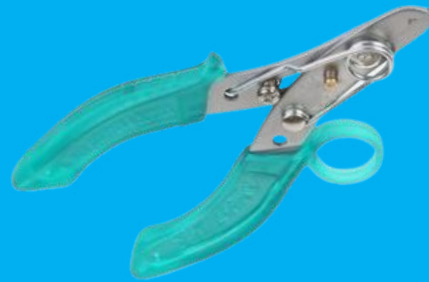
MT-150B-SS Wire Stripper and Cutter