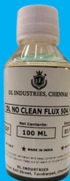
No Clean Liquid Flux 100ml