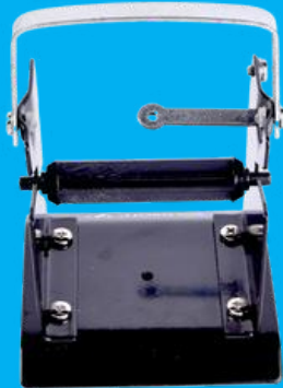
SWD Solder wire Dispenser