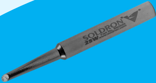
BN25S3 25W Nickel Plated Spade 3mm Bit