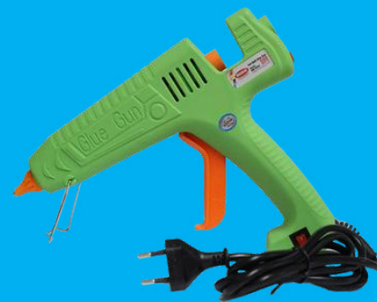
ME-5000 500W Professional Glue Gun