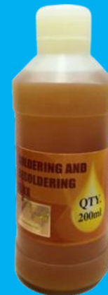
FC-200ML Soldering Flux (200ml)