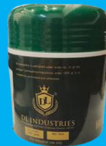
Solder Paste Flux 500 gms