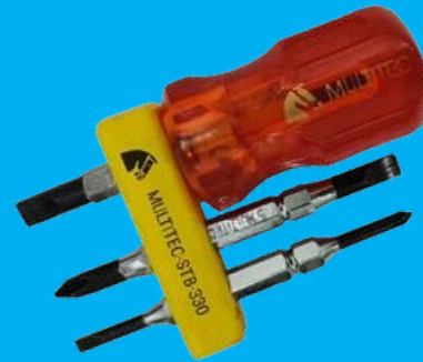
STB-330 6 in 1 Multi Bit Stubby Screw Driver Set