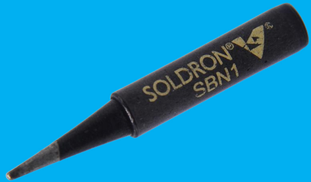
SBN1 Ceramic Coated Deluxe Needle 1mm Bit for Solderon 936/938/960/878D/740 Stations