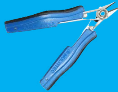
MT-07-SS Stainless Steel Nipper