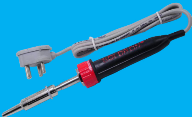
SI100A 100W / 230V Soldering Iron