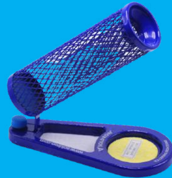
SISDX Deluxe Soldering Iron Stand