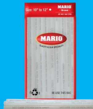
Mario Transparent Hot Melt Glue Stick