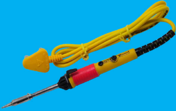
SIVT 15-30W Varitemp Soldering Iron