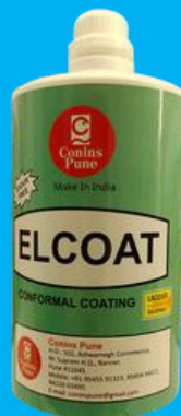
ELCoat Conformal Coating - 1 Ltr.