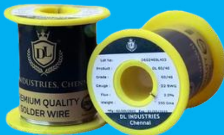
Solder Wire 60/40 Tin/Lead 22 SWG - 250 gm