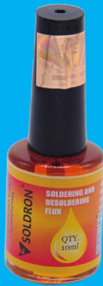
FC-10ML Soldering Flux (10ml)