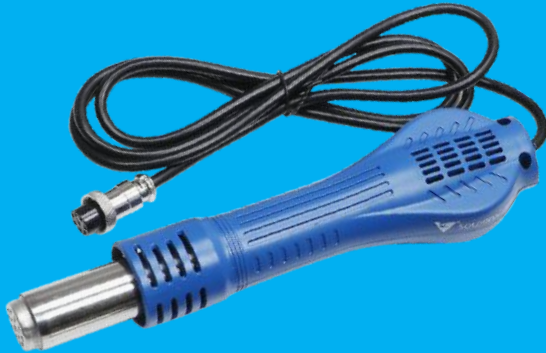
BL500A 500W Hot Air Blower