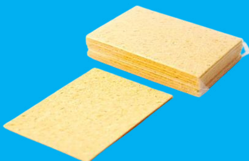
Yellow - Soldering Bit Cleaning Sponge