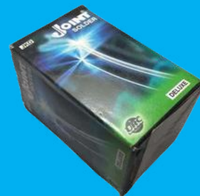
Solder Wire 24 SWG - 500 gm