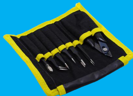
TWZC Tweezer and Cutter Pouch Set