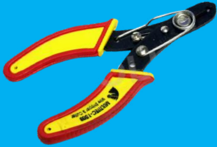
MT-150B Wire Stripper and Cutter