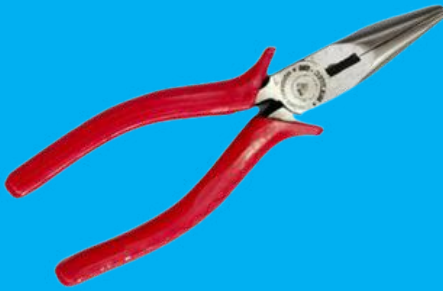
MT-535 Nose Plier