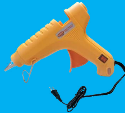
ME-117 100W Professional Glue Gun