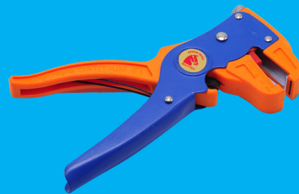
02DX Self Adjusting Wire Cutter - Stripper