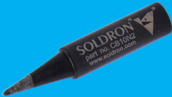
CB10N2 Black Ceramic Coated Micro Bit for MSVW & SMPS Station