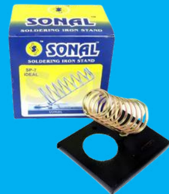
Sonal SP-7 Soldering Iron Stand