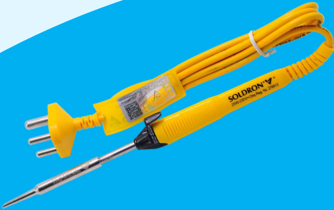
SI25A 25W / 230V Soldering Iron