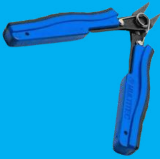
MT-07 Heavy Duty Nipper