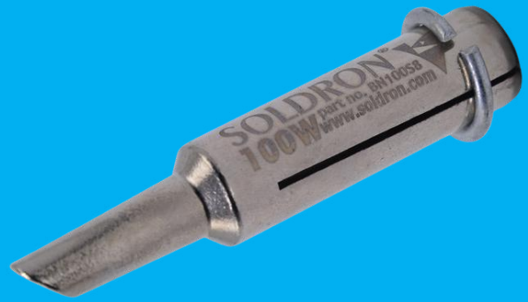
BN100S8 100W Nickel Plated Spade 8mm Bit