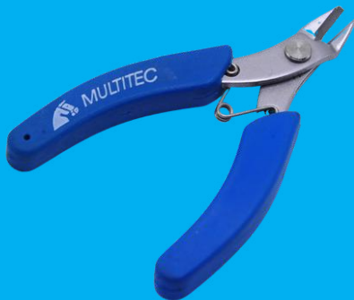
MT-111-SS Stainless Steel Cable Cutter