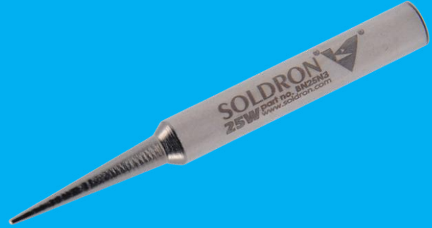
BN25N3 25W Nickel Plated Needle 3mm Bit