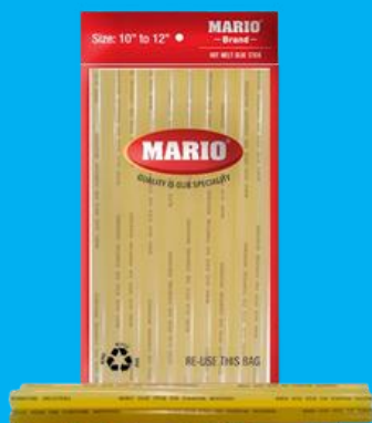
Mario Yellow Hot Melt Glue Stick