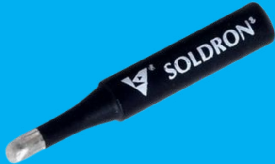
SBS3 Ceramic Coated Deluxe Spade 3mm Bit for Solderon 936/938/960/878D/740 Stations