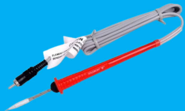
MIPEN Micro Pen For MSVW & SMPS