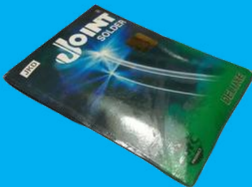
Solder Wire 24 SWG - 50 gm