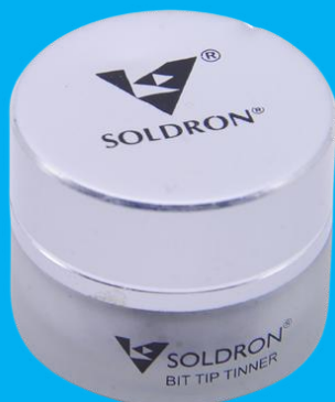
TIPC Soldron Bit-tip Tinner and Cleaner