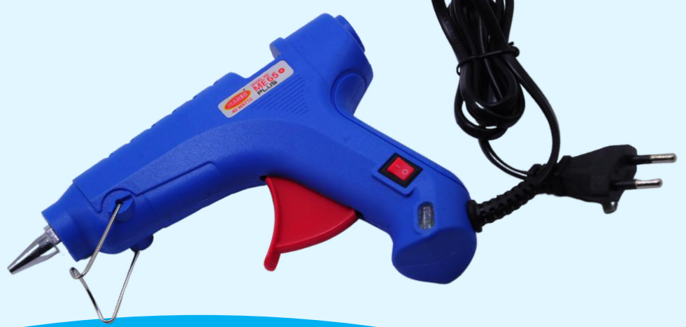
ME-65+ 40W Professional Glue Gun