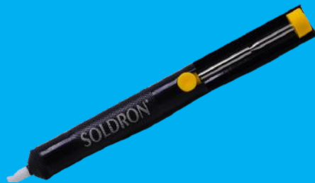
Metal Body Desoldering Pump