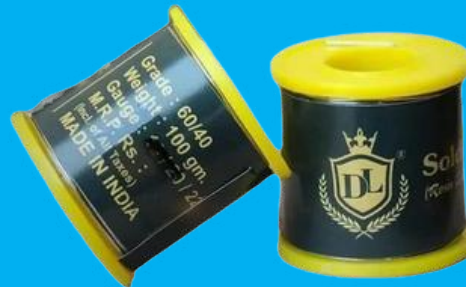
Solder Wire 60/40 Tin/Lead 22 SWG - 100 gm