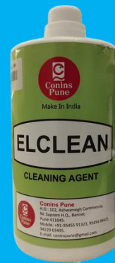
Elclean Cleaning Agent - 1 Ltr.