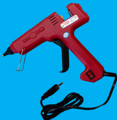
ME-2000 200W Professional Glue Gun