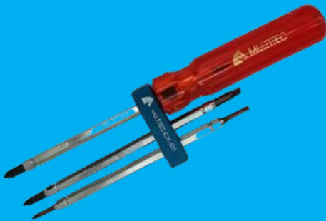
SDK-600 Multi Bit Reversible Screw Driver Set