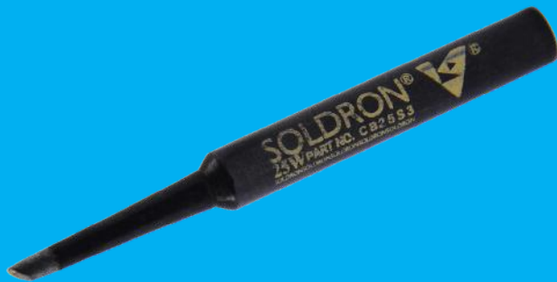
CB25S3 25W Ceramic Plated Spade 3mm Bit