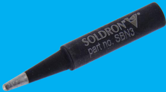
SBN3 Ceramic Coated Deluxe Needle 3mm Bit for Solderon 936/938/960/878D/740 Stations