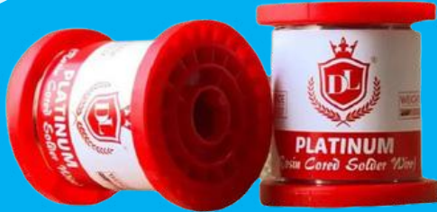
Platinum Solder Wire 63/37 22 SWG - 500gm