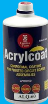
AcrylCoat ALQ-60 PCB Conformal Coating -1 Ltr.