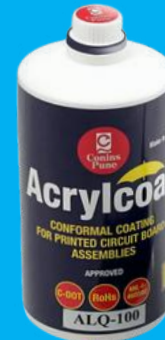
AcrylCoat ALQ-100 PCB Surface Conformal Coating - 1 Ltr.