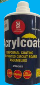
AcrylCoat AR-30 Conformal Coating - 1 Ltr.