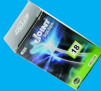
Solder Wire 18 SWG - 500 gm