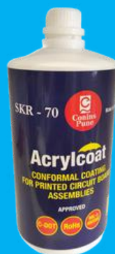
AcrylCoat SRK-70 PCB Surface Conformal Coating - 1 Ltr.