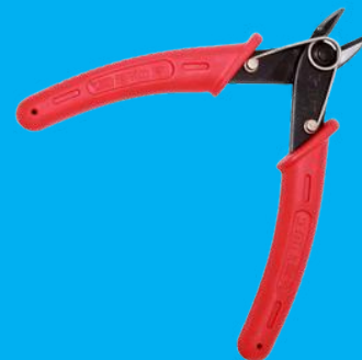
MT-06 Wire Cutter Nipper