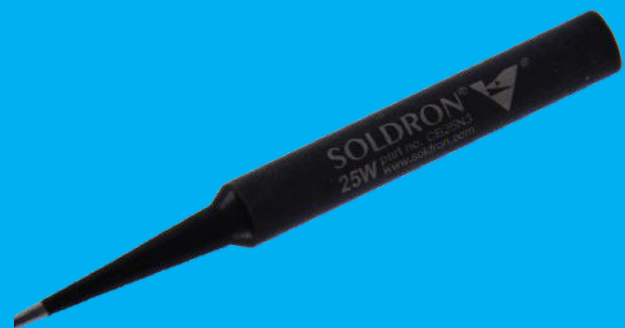
CB25N3 25W Ceramic Plated Needle 3mm Bit