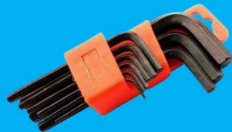
HSLK-100 Short Series Allen Key Set