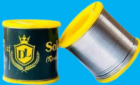
Solder Wire 60/40 Tin/Lead 22 SWG - 50 gm