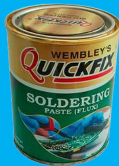
Quickfix Soldering Paste Flux 500 gms