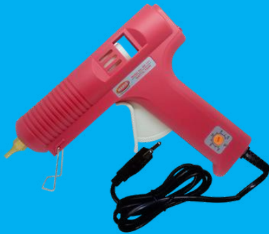
ME-151 150W Varitemp Professional Glue Gun