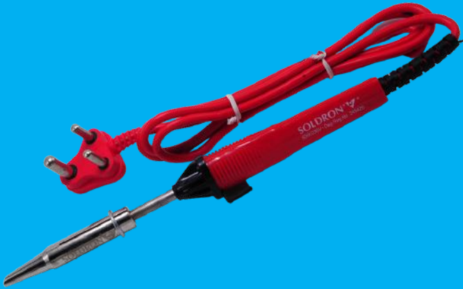
SI50A 50W / 230V Soldering Iron