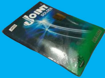
Solder Wire 18 SWG - 50 gm