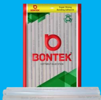
Bontek Transparent Hot Melt Glue Stick