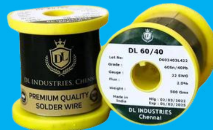
Solder Wire 60/40 Tin/Lead 22 SWG - 500 gm