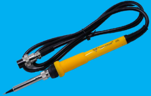
60W Soldering Iron for 938 Station