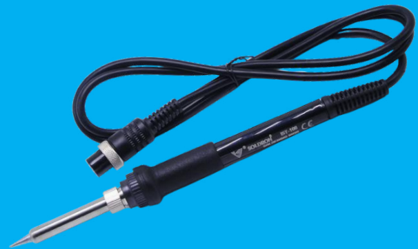
100W Iron for IST-100 Soldering Station