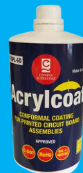
AcrylCoat LGT-SPL-60 PCB Surface Conformal Coating - 1 Ltr.