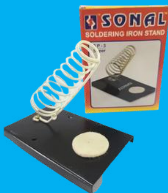
Sonal SP-3 Soldering Iron Stand