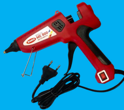
ME-800 80/120W Dual Professional Glue Gun