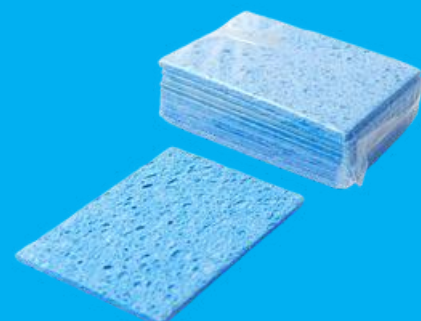
Blue Tip Cleaning Sponge