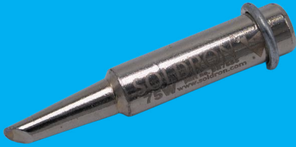
BN75S6 75W Nickel Plated Spade 5mm Bit