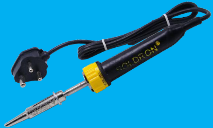
SI75A 75W / 230V Soldering Iron