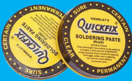
Quickfix Soldering Paste Flux 15 gms