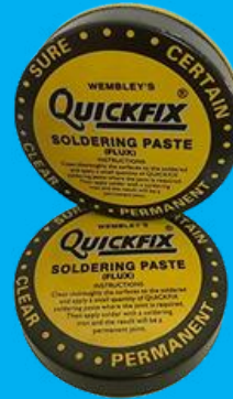
Quickfix Soldering Paste Flux 50 gms