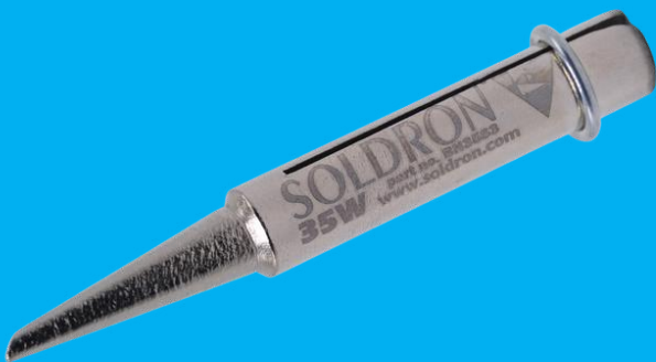
BN35S3 35W Nickel Plated Spade 3mm Bit