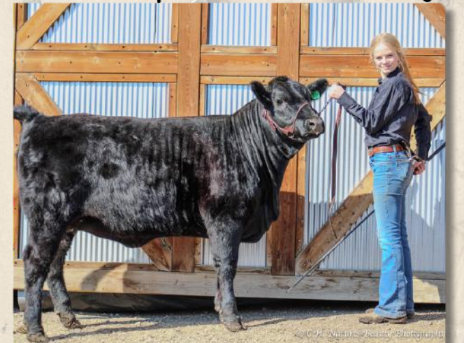
"Black Baby" Black Angus