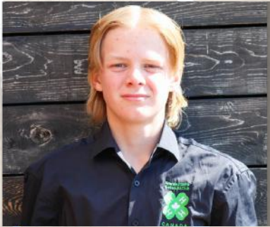
William Friesen Intermediate