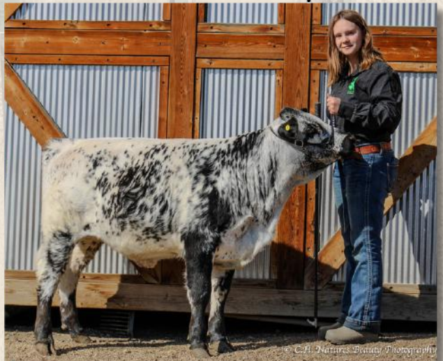
Mini Speckled Park