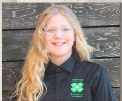
Blaire Budgell Intermediate