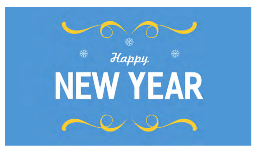
"Tomorrow is the first blank page of a 365 page book. Write a good one."

So as we start this new year, I encourage you to reflect on your successes while staying focused on continuing to work with our students, parents and community to continue to provide outstanding learning