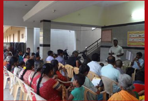
PLASTIC FREE ZONE AWARENESS MEETING