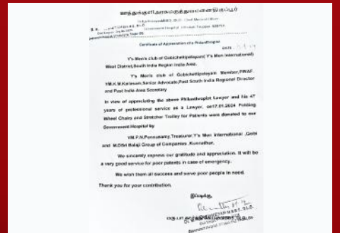
DONATED FOR FOLDING WHEEL CHAIRS AND STRETCHER TROLLEY TO GOVERNMENT HOSPITAL