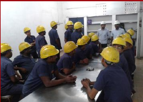
GENERAL SAFETY AWARENESS