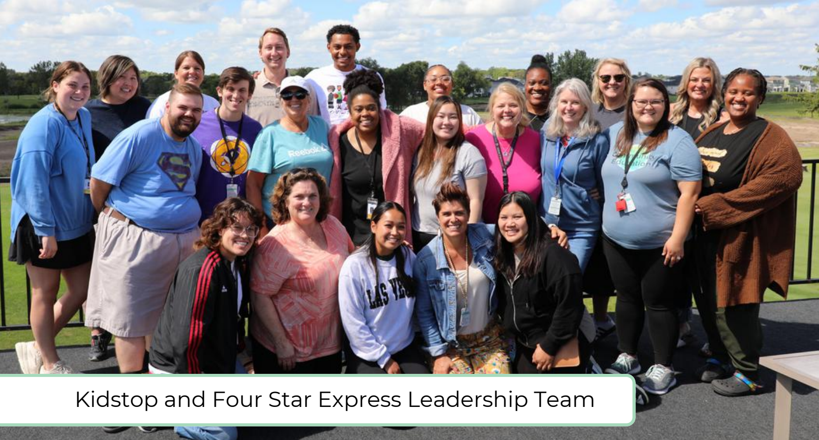
Kidstop and Four Star Express Leadership Team