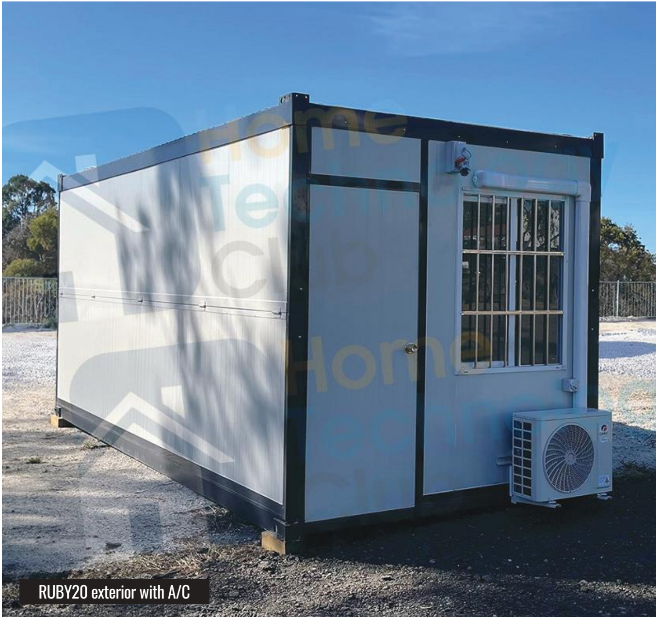
RUBY20 exterior with A/C