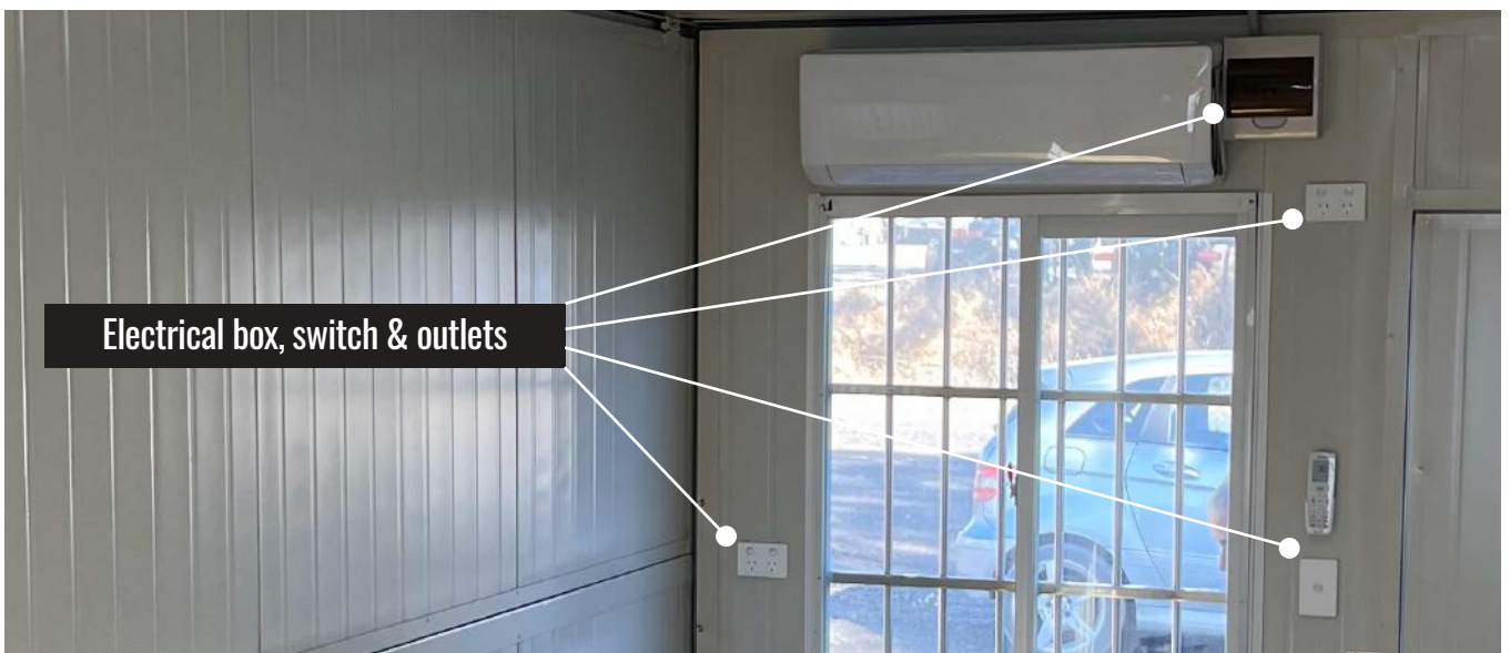
Electrical box, switch & outlets