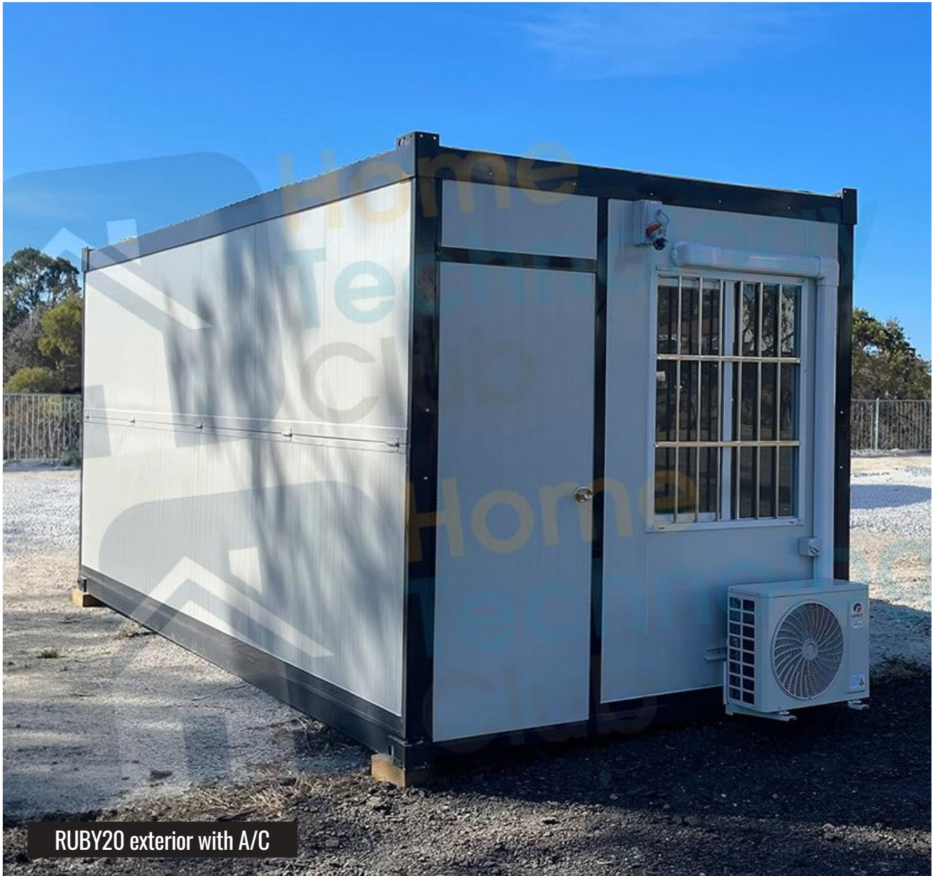
RUBY20 exterior with A/C