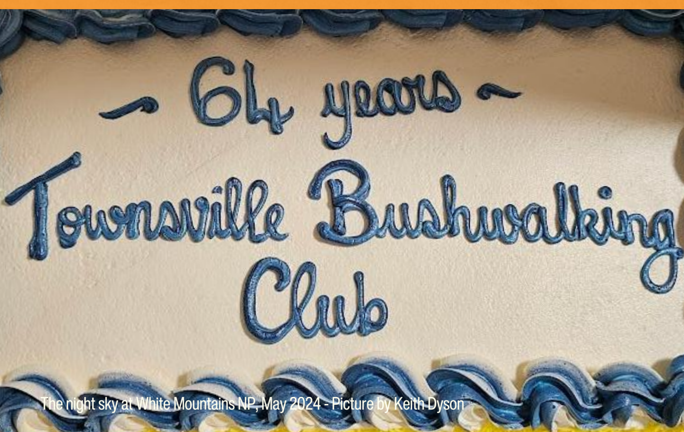
The night sky at White Mountains NP, May 2024