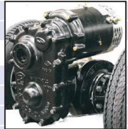
GT Automotive Drive