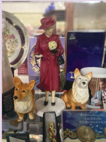
Her Majesty and a couple of oversized Corgis