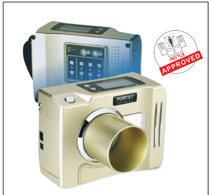
Digital Sensor 0.15 sec Chemical Film 0.3 sec