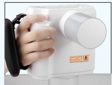
Available for hand-held shooting separately