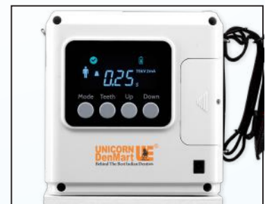
Concise and clear digital display