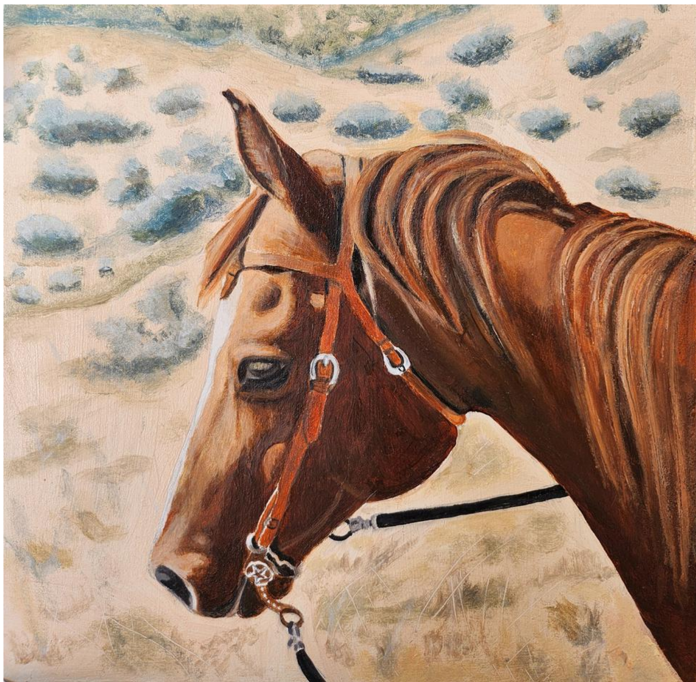
Susan O'Linn , Chet , Oil on board, 10 x 10 x 1 in ($275)