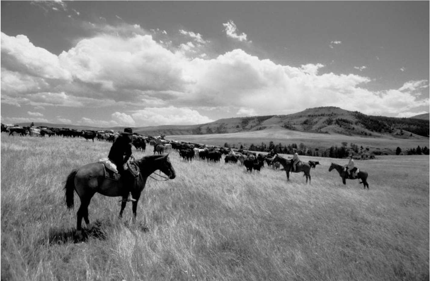
Mia Zumsteg , Open Sky , Photography, 10 x 20 in (NFS)