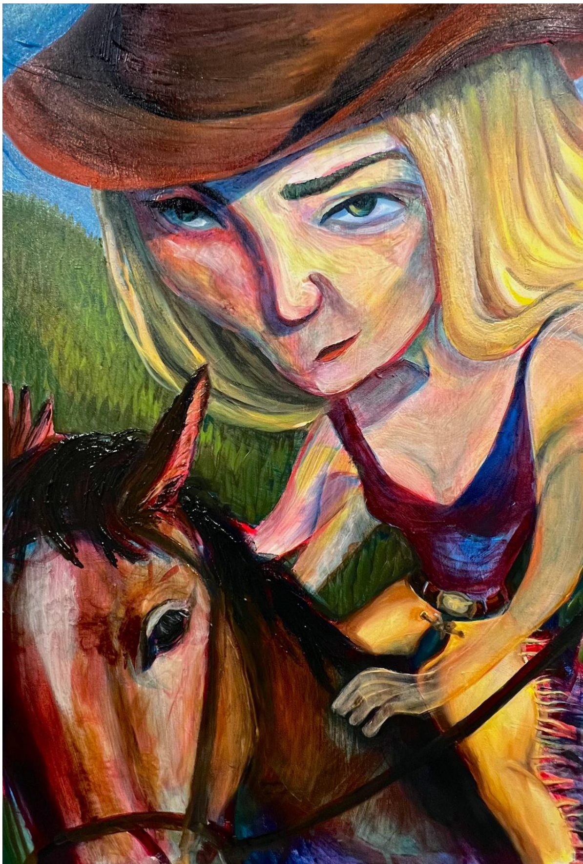
Sophia Wolfe , A Horse is Like A Time Machine , Oil and alkyd on canvas, 36 x 24 x 2 in ($800)