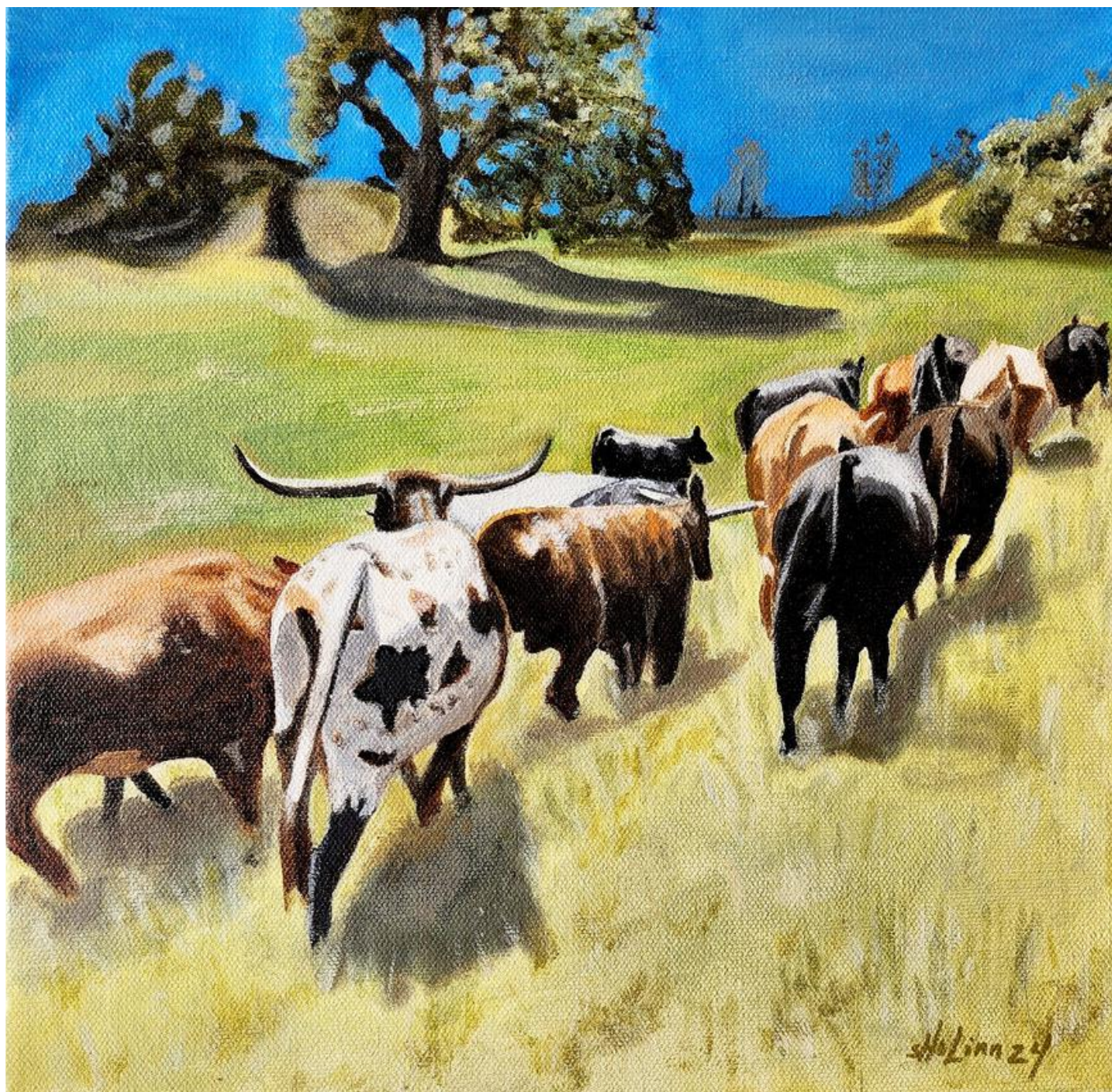
Susan O'Linn , Cattle Drive , Oil on canvas, 12 x 12 x 2 in ($325)