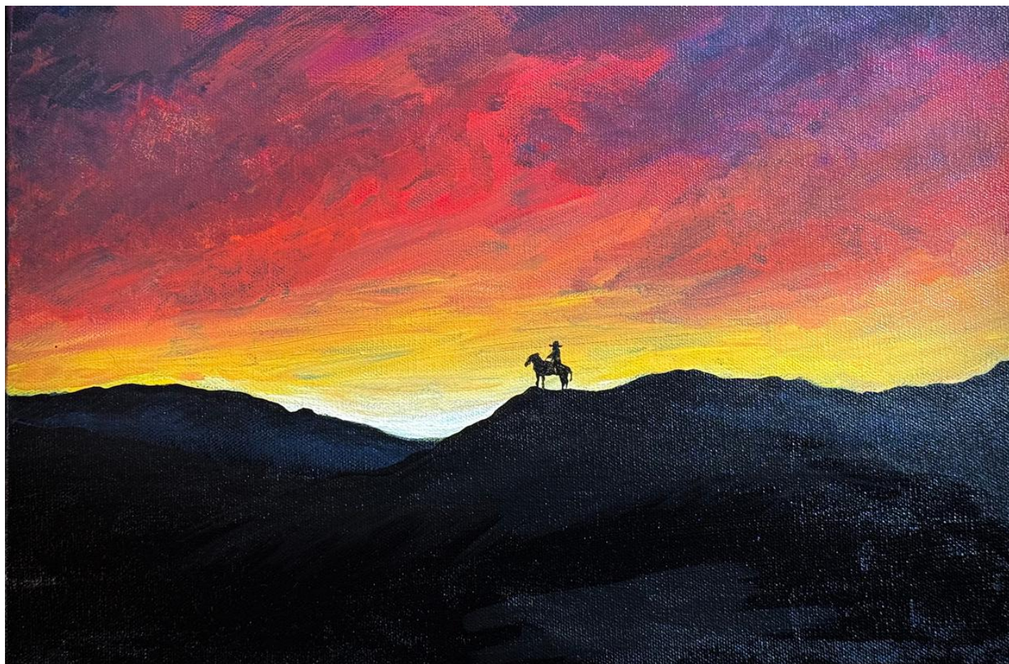
Rigo Iglesias , The Last Ride , Acrylic on canvas, 12 x 16 x 1.5 in ($150)