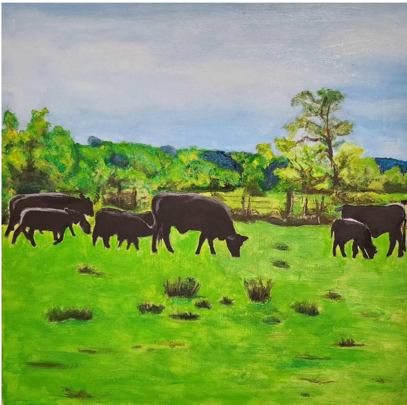
Susan O'Linn , Trinity, TX , Oil on board, 10 x 10 x 1 in ($275)