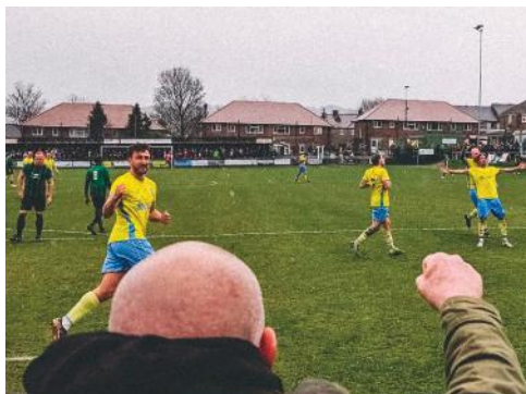
Hallam's victory at Golcar gives them their highest ever Premier Division points total.