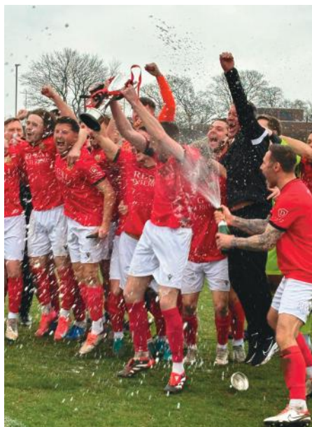
Silsden celebrate winning the title

Going into the day's action, the only scenario that would guarantee the Cobbydalers the title this weekend was a win for them and a defeat for Golcar United who were at home to Hallam in a meeting of the other top three sides.