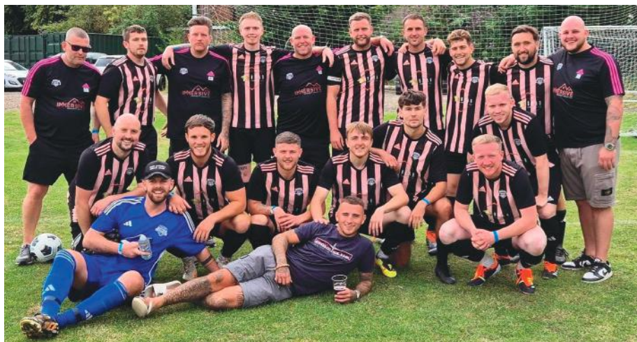
Loca FC - win promotion from Division 2

tory after Sheaf House couldn't field a team.