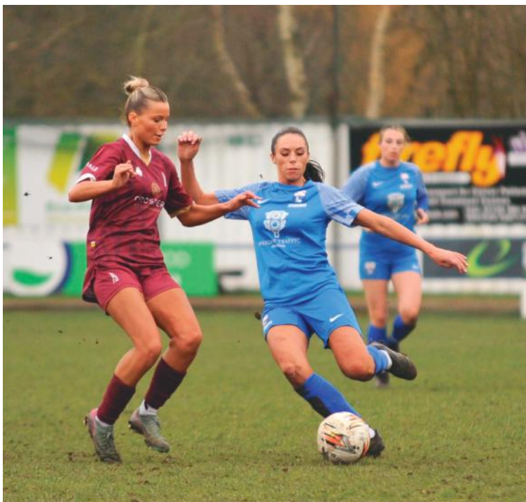
Action from Rossington Main Ladies (blue) against Chesterfield Ladies.