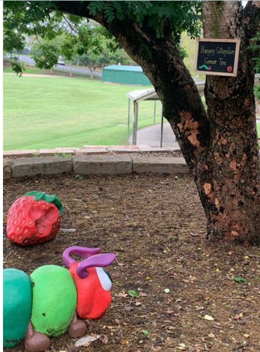
The caterpillar admires its sign on the tree!