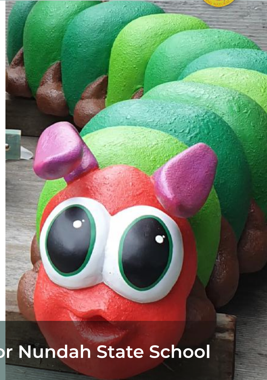
Caterpillar play sculpture and fruit seats for Nundah State School