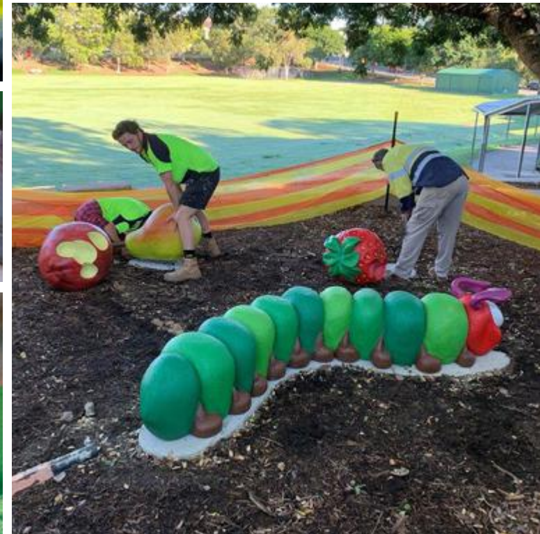
Fruit sculptures at different stages of production