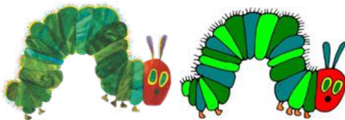
Hungry Caterpillar illustration from Eric Carle's book