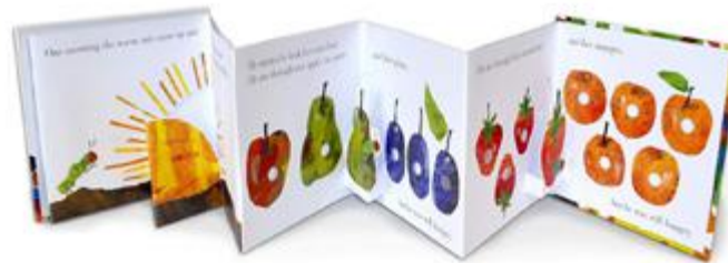
Fruit illustrations from "The Very Hungry Caterpillar" pop-up book