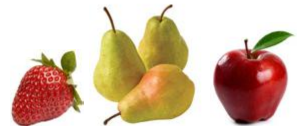
Reference images for designing fruit sculptures