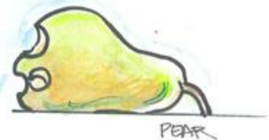
Natureworks' concept sketches for the caterpillar play sculpture and chewed fruit pieces