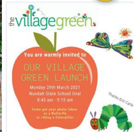
Nundah State School's launch promotion