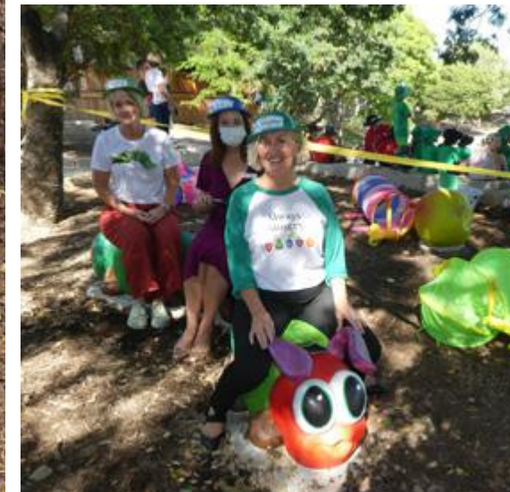
School staff try the caterpillar sculpture on launch day