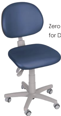
Zero Backache Stool for Doctor Comfort