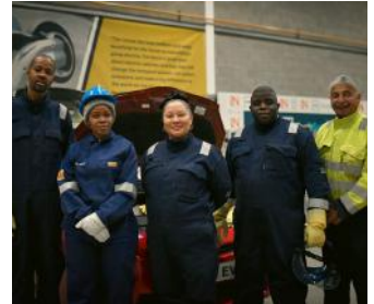
EV students from Nelson Mandela University.

Meanwhile, students from Nelson Mandela University in South Africa completed electric vehicle qualifications at the college's Electric vehicle and Green Technologies Centre in Wednesfield.