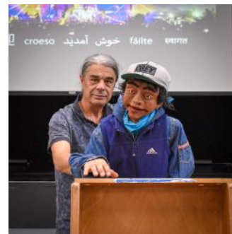
Puppeteer from Routes Puppets gives an inspirational talk to students.

And a puppeteer from Routes Puppets delivered an inspirational talk and presentation to students about British values, sexual harassment awareness, gangs and drug awareness.