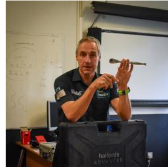
Halfords representative visits the college.

They also got the lowdown on how to find the best components and trade deals at a workshop with a representative from Halfords.