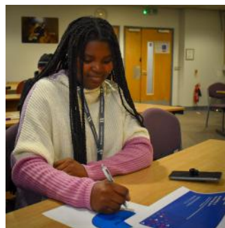
Online safety session delivered by Changing Lives.

Students gained valuable information on how to navigate the online digital world safely and responsibly at a workshop delivered by Changing Lives which shed light on the importance of cybersecurity and the potential dangers to be aware of.