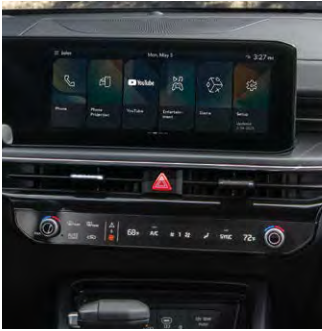
12.3-inch Touchscreen 7 (Standard)