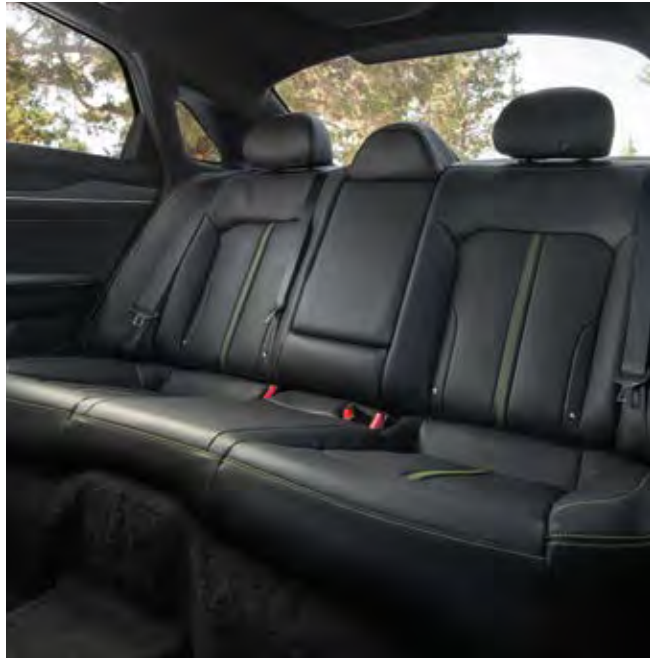
Panoramic Sunroof* (Available)