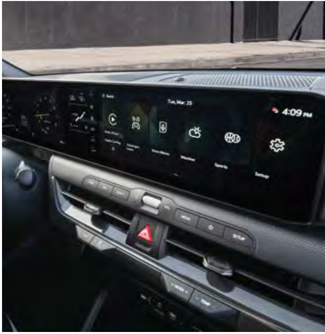
29.6-inch Total Combined 19 Panoramic Display 7* (GT-Line ® ; GT-Line Turbo)