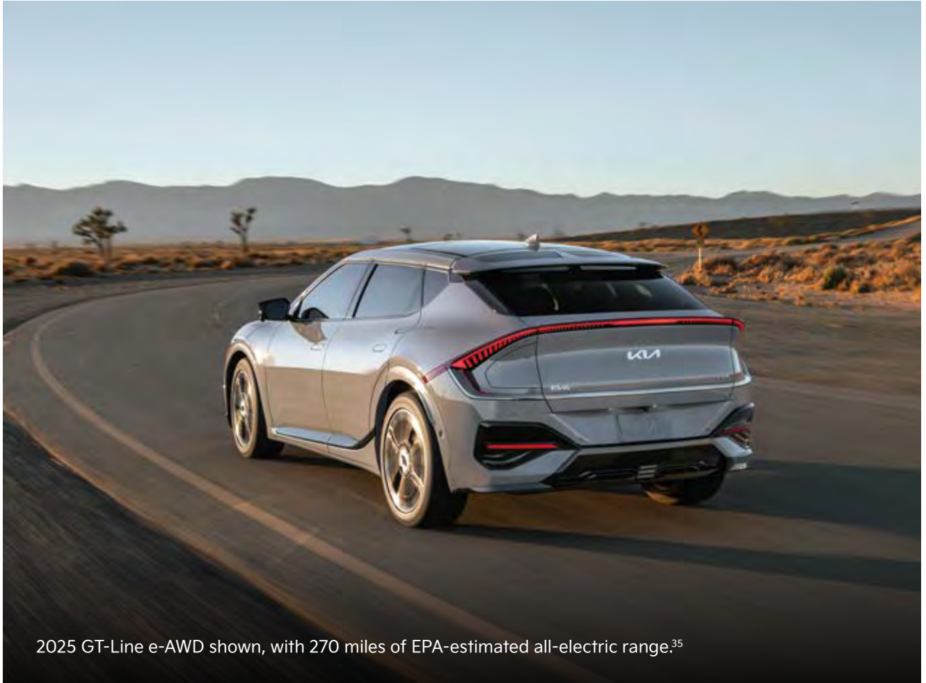
2025 GT-Line e-AWD shown, with 270 miles of EPA-estimated all-electric range. 35

EPA-est. Available Range 35* (Light Long Range RWD, Wind RWD, GT-Line RWD)