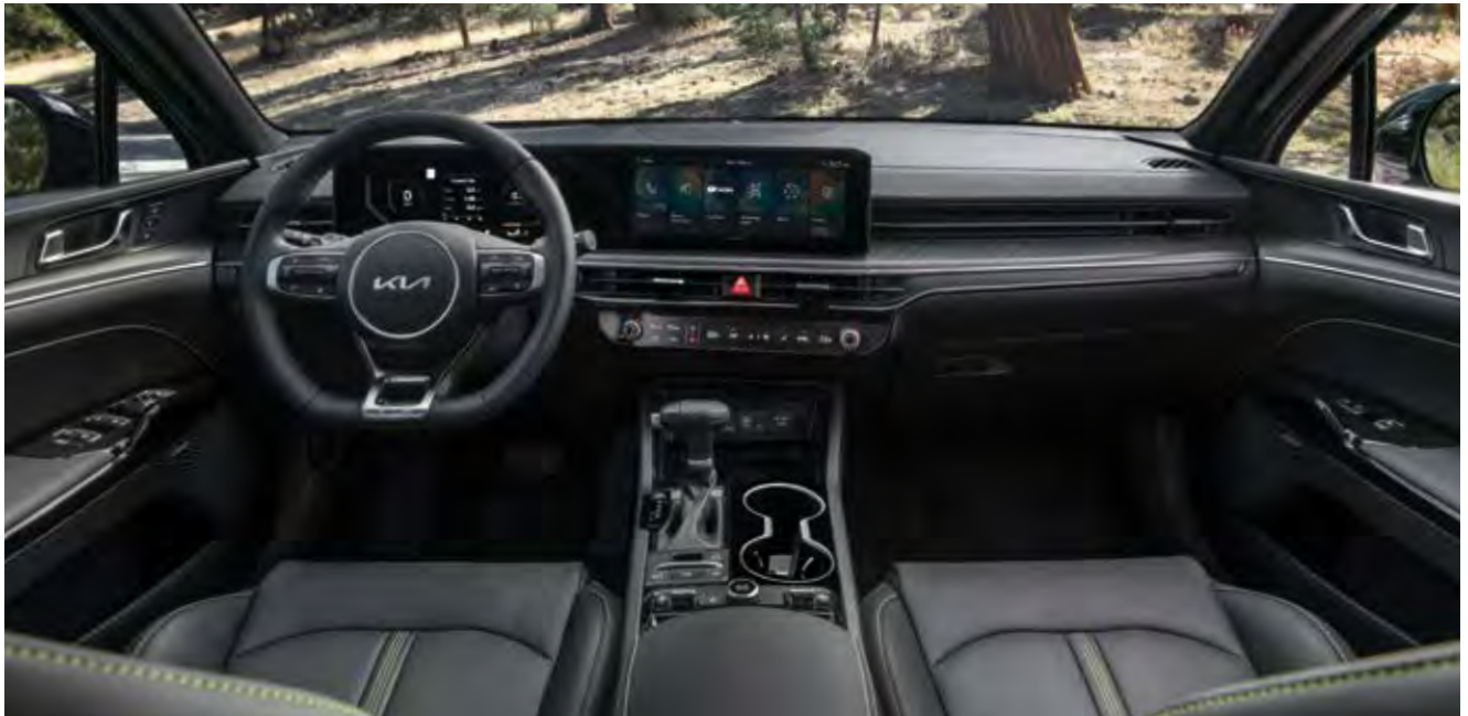
360-degree Surround View Monitor 5 (EX, GT*)