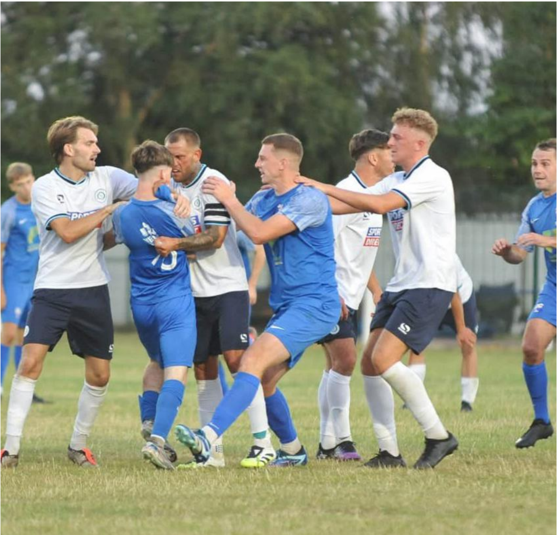
Rossington Main had a couple of Doncaster Derbies this week starting with a game against NCEL new boys Doncaster City (above) where the hot weather led to boiling temperatures - and then they took on a Doncaster Rovers XI (below).

Wednesday, July 16 Dodworth MW 1 - 4 Worsbrough Bridge Athletic Handsworth 2 - 1 Swallownest Kiveton Park 1 - 3 Glapwell Penistone Church 1 - 1 Stocksbridge Park Steels Rossington Main 3 - 1 Doncaster Rovers XI South Normanton Athletic 0 - 2 Doncaster City