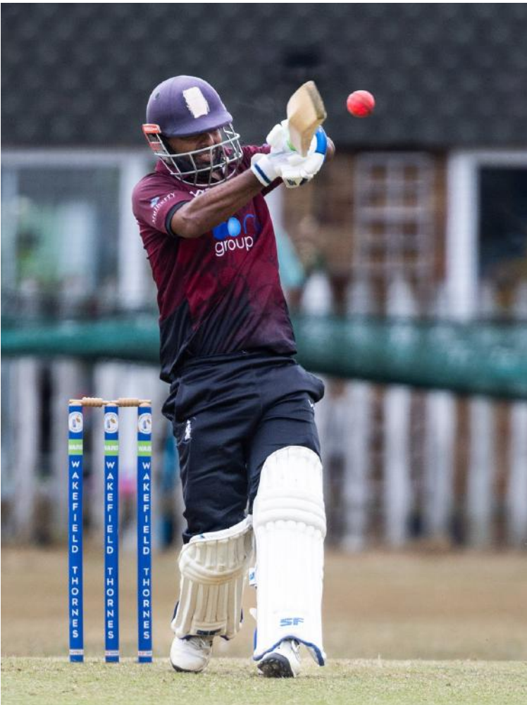
ACTION FROM THE T20 BLAST FINAL.

Cawthorne 2nds are now in second place, 24 points behind the leaders, following a straightforward win over Parkhead at Ecclesall Road. Thom Macrow took 5-25 when the hosts were all out for 136, then Nick Lowe (55