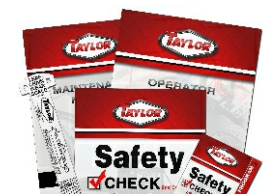
Vehicle Information Package (Standard)