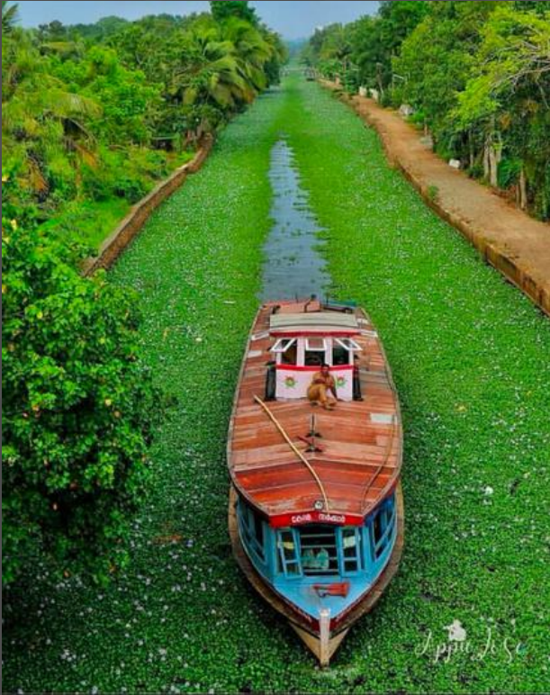
Kerala Backwaters, Kottayam