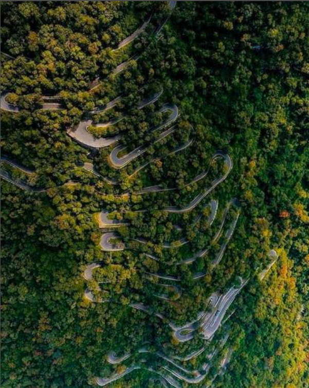
Kolli Hills Mountain Road, Tamilnadu