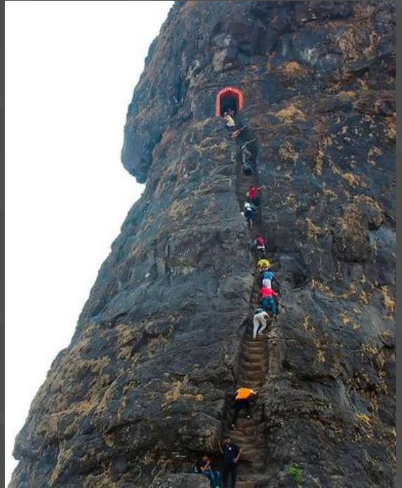
Harihar Fort Trek Nashik