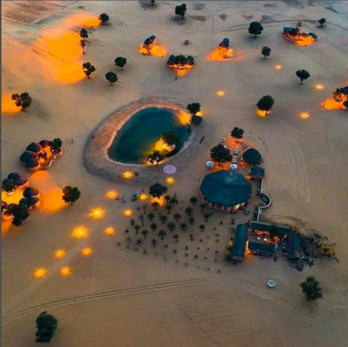
Khimsar Sand dune Village Rajasthan