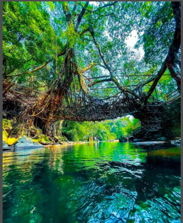
Living Roots Bridges, Meghalaya