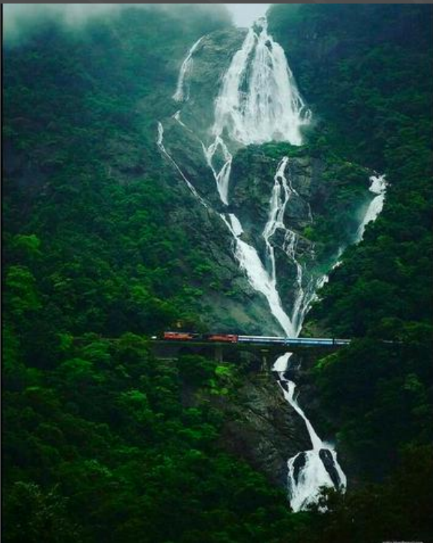
Dudhsagar Waterfall Goa