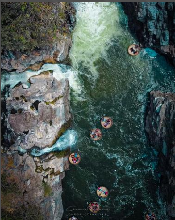
Hogenakkal Waterfall Karnataka