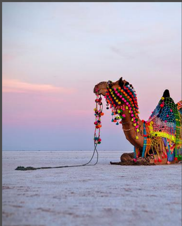
White Rann of Kuchchh