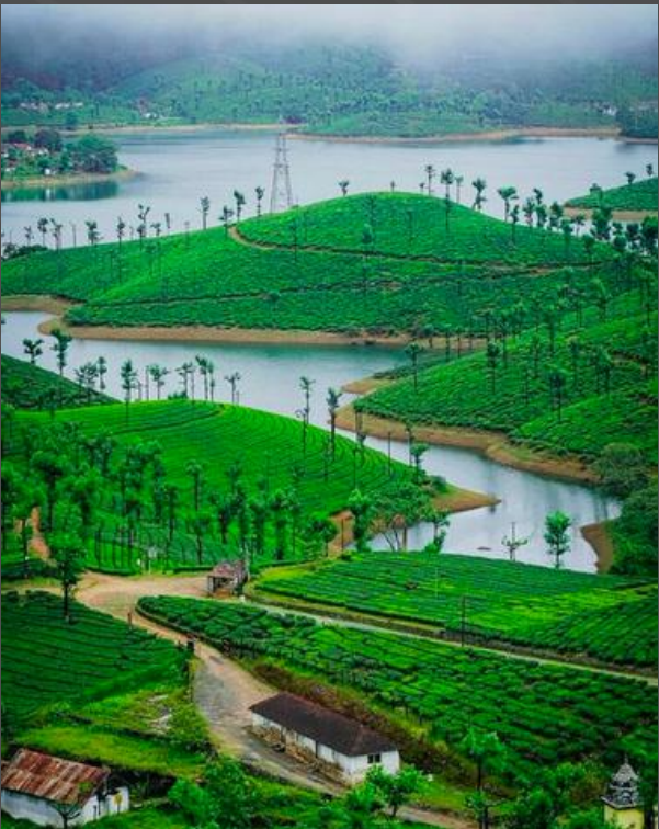
Valparai Hill Station Tamil Nadu