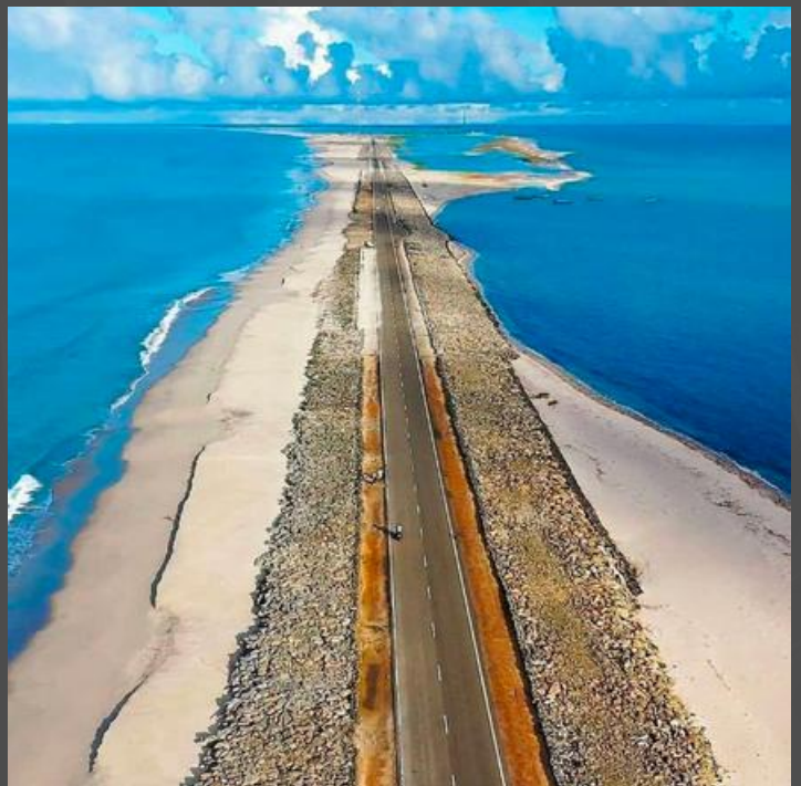
Dhanushkodi Beach Road, Tamilnadu