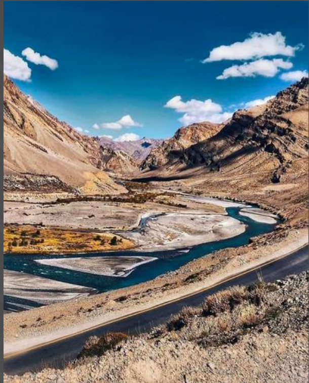
Leh - Manali Highway