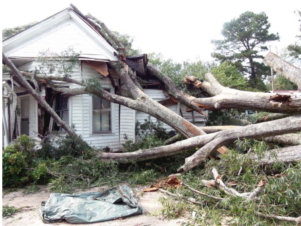
This tree damaged a house on Orange Street in Abbeville last week. Torrential rains contributed to the accident, in which no one was hurt.

“Liberty lies in the hearts of men and women; when it dies there, no constitution, no law, no court can save it.”