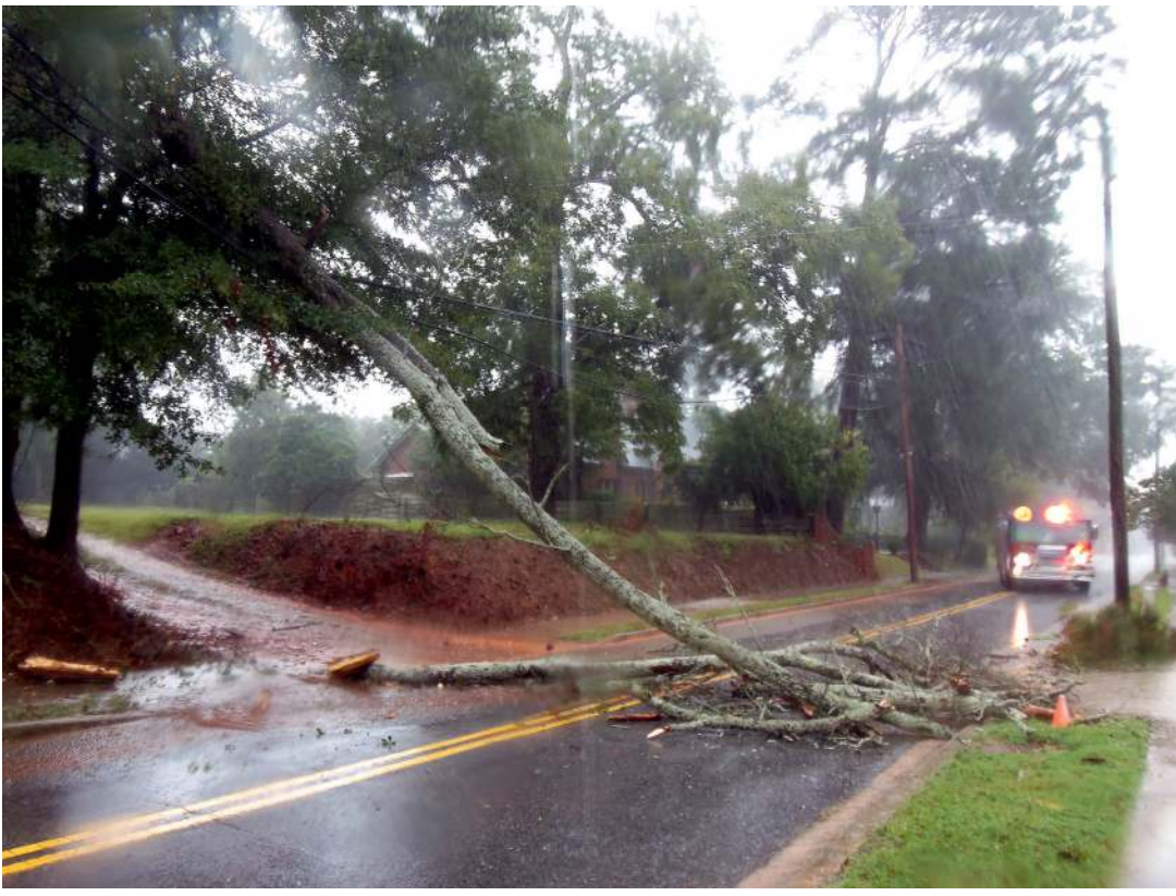
A large tree fell on a power line on Church Street in Abbeville Thursday, disrupting power for a number of residents on that street near Court Square.