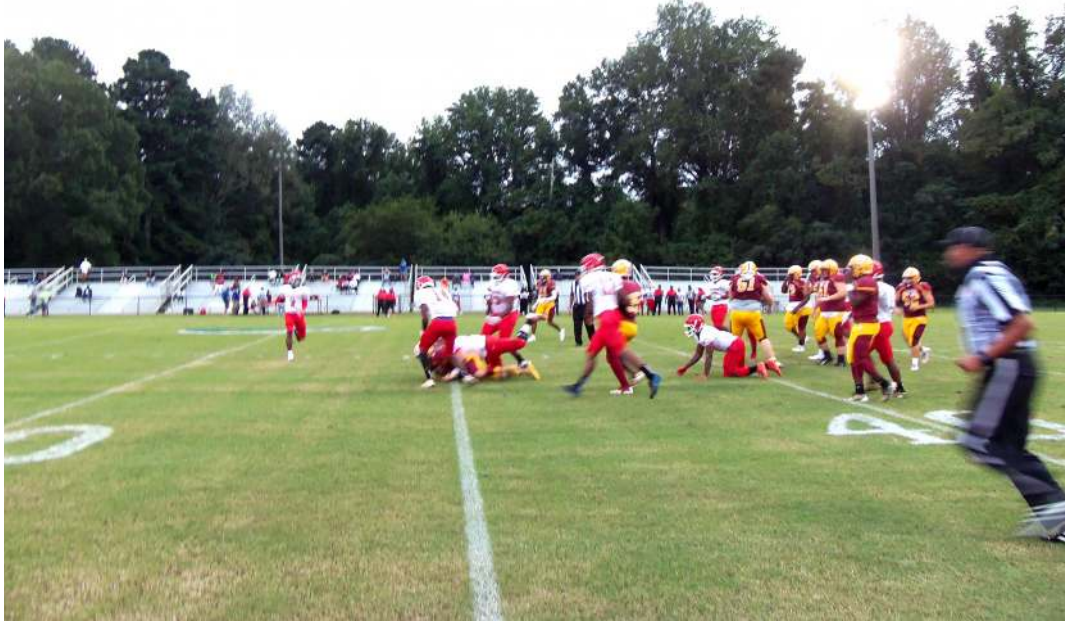
Abbeville (in dark jerseys) defeated McCormick in the WCTEL Kickoff Classic Friday night at Hite Stadium.