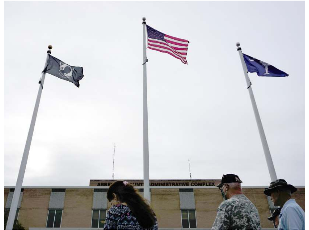
Local veterans raised the POW/MIA flag at the Abbeville County Administrative Complex on Friday, Sept. 18. The event was presented by Abbeville County veterans affairs office and American Legion Post 2.