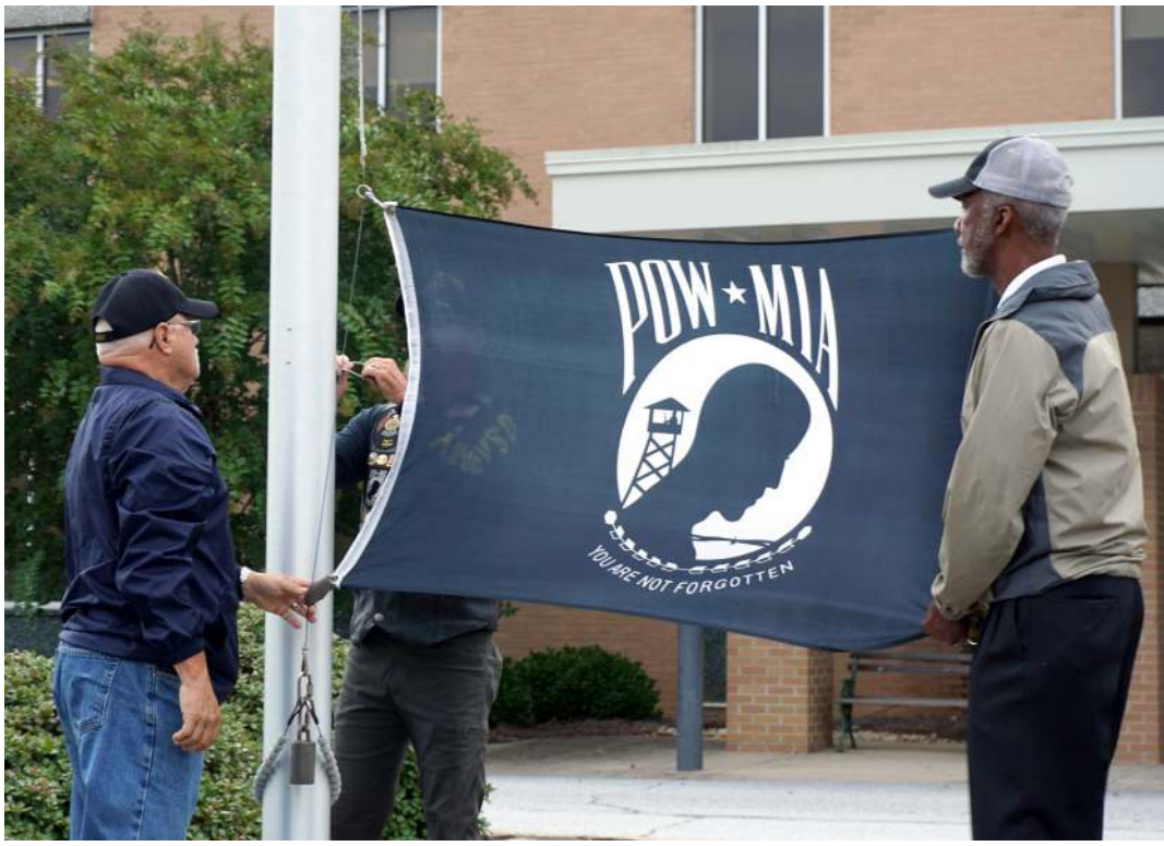
Abbeville County veterans observed POW/MIA Flag Day Friday, Sept. 18, with a flag raising ceremony at the Abbeville County Administrative Complex in Abbeville.