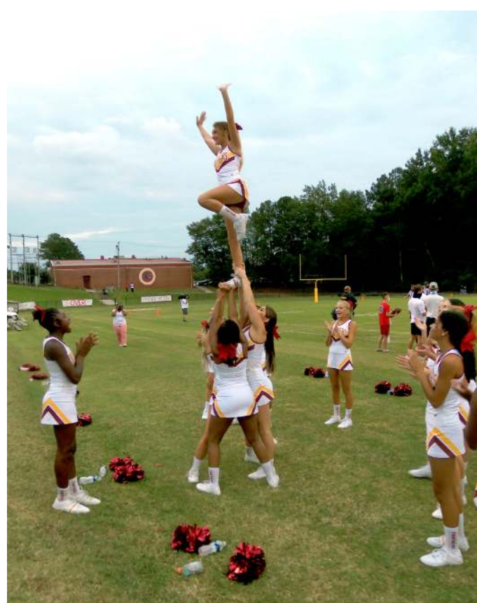
Abbeville High School cheerleaders put on this display of grace during the WCTEL Kickoff Classic at Hite Stadium recently.

If they want to return to face-to-face teaching, they will have that opportunity the second nine weeks of school.