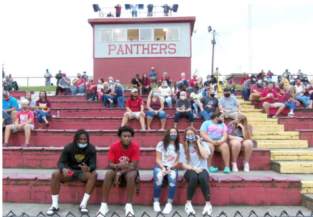
Here’s a peek at the crowd in the age of social distancing, and the pandemic, during the WCTEL Kickoff Classic at Hite Stadium recently.

The Interim Superintendent was planning to provide an update at last night’s school board meeting about the reimbursement effort.