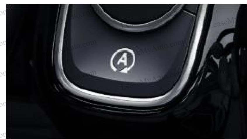
ECO Start/Stop system