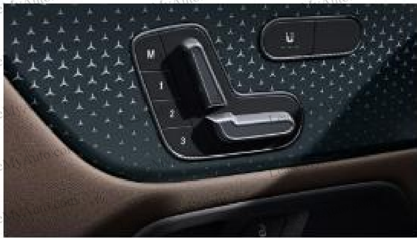
Power front seats with 3-position memory