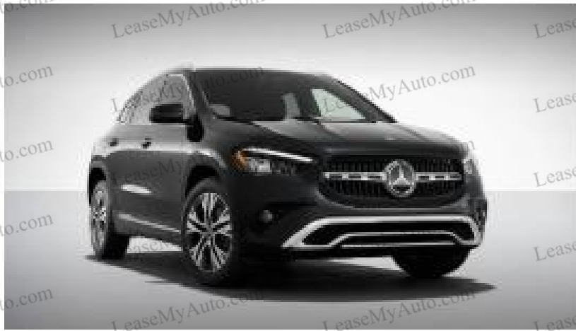
Heightened style, wide-ranging appeal