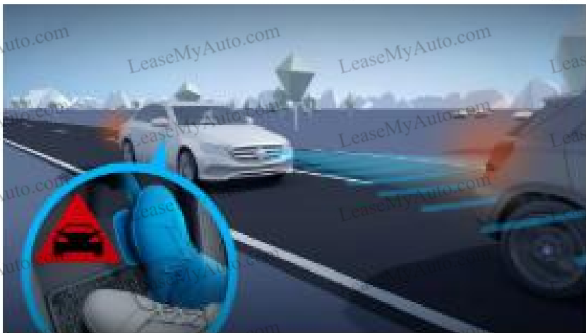
Active Brake Assist