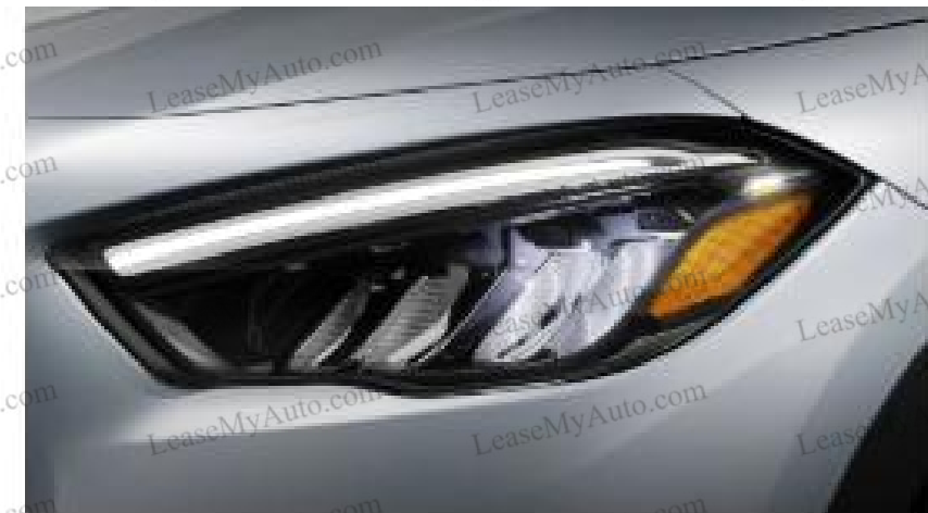
LED Daytime Running Lamps