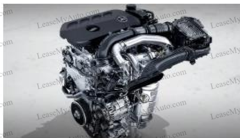
2.0L inline-4 turbo engine with mild hybrid drive