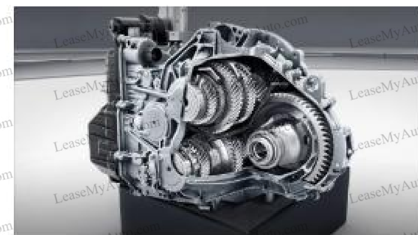
8G-DCT 8-speed dual-clutch automatic transmission