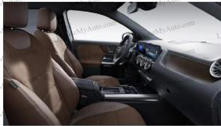
Sport front seats