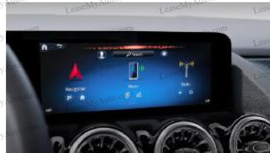
"Hey, Mercedes" keyword activation