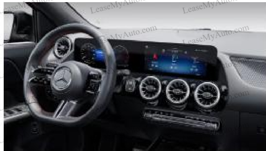
Mercedes-Benz User Experience (MBUX)