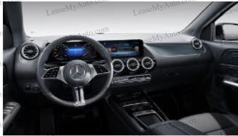
High-style, high-tech cabin