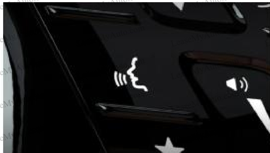
Voice Control with Natural Language Understanding