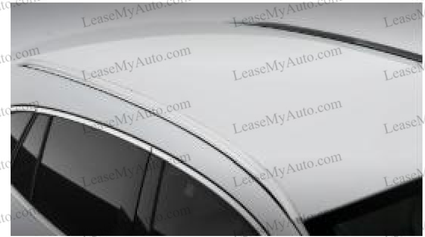
Aluminum roof rails