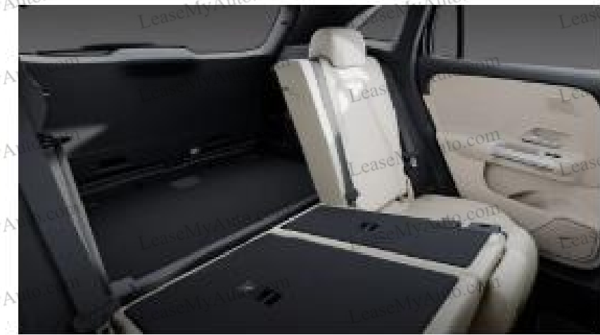
40/20/40-split folding/reclining rear seats