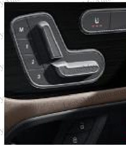
Heated front seats