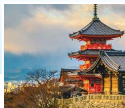
SOUTH KOREA AND JAPAN MAY 11 - 29, 2026