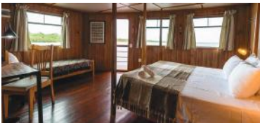
Upper Deck Suite (approx. 25 m 2 )