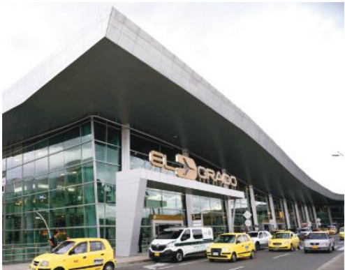
Bogota Airport (BOG)

In the morning, enjoy breakfast on board, then explore the Colombian city of Leticia on foot. Visit the ethnological museum and experience the local flair. In the afternoon, pack and complete formalities for leaving Brazil.