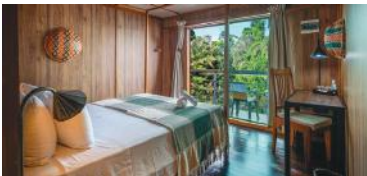
Upper Deck Deluxe (approx. 17 m 2 )