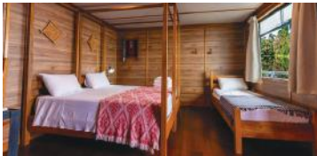
Main Deck Classic (approx. 17 m 2 )