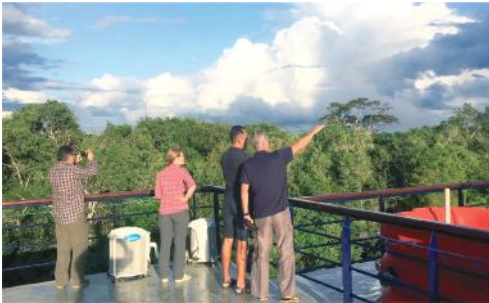
Ms Jangada Sun Deck

From Fonte Boa, take a boat trip to a tributary where locals catch the giant pirarucu fish, weighing up to 150 kg which is extremely tasty and is exported to all of Latin America. The ship then heads upstream, with another boat trip in the afternoon before continuing overnight to Jutai.