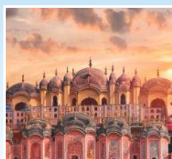
THE BEST OF INDIA & BRAHMAPUTRA RIVER OCT 3 - 19, 2025