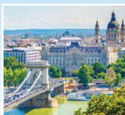
GOLF CRUISE ON DANUBE MAY 18 - 26, 2026