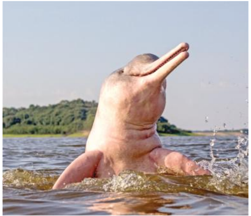
Amazon River Dolphin

In the morning, try piranha fishing and swim in the river. Explore the Rio Camatiã on a boat tour. In the afternoon, visit the Ticuna village of Villa Lira to learn about indigenous life. When the Amazon shimmers in red and purple at sunset, the ship begins the final leg of your journey.