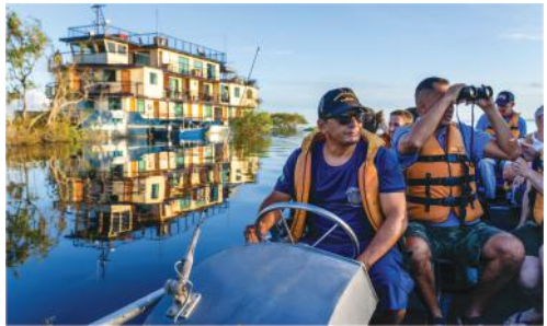
MS Jangada Tour Guide

Explore Tefé, one of the largest cities on your Amazon journey, founded by Portuguese missionaries in the 17th and 18th centuries. Marvel at the panoramic view of the ancient river from the monastery and uncover historical artifacts in the still-in-use buildings. Explore the town's market hall and enjoy free time for your own discoveries. In the afternoon, visit Mamirauá National Park, a UNESCO World Heritage Site, with excursion boats and on foot to explore its flooded rainforest and unique wildlife, including Uakari monkeys, sloths, cormorants, parrots, and toucans. At night, search for nocturnal animals and caimans with glowing eyes.