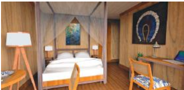
Main Deck Superior (approx. 19 m 2 )