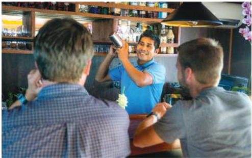
Ms Jangada Lounge Area

Today, reach city of Benjamin Constant, the last Brazilian outpost on the Peru border. Travel by land to visit the secluded Matis and Marubo natives. First, explore the Marubo village, then hike through the jungle to meet the Matis, who have only recently interacted with the outside world. Learn about their way of life, hunting, and rituals. In the afternoon, the ship arrives at Tabatinga, and you'll visit the Peruvian town of Santa Rosa across the river.