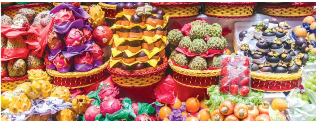
Fruits at a market in São Paulo

Today, travel by motorboat to Bethania through scenic river tributaries. Experience the Ticuna's Moça Nova initiation dance in a ritual hut, with masks, black robes, feathers, and shells. After lunch by the lush Rio Iça, return to your ship and continue to Sao Paulo de Olivença.