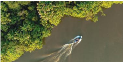
Deep into the rainforest

Following breakfast, bid farewell to the exceptional ship and its gracious crew. Your journey into the uncharted territories of the Amazon has been an unparalleled adventure that will remain with you forever. You will be transported from the pier in Tabatinga to Leticia Airport for your flight to Bogota. Upon arrival, transfer to your hotel.