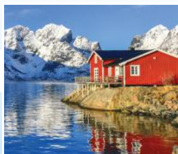
NORWAY AND LAPLAND MAY 8 - 23, 2026