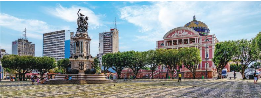
The Amazon Theatre

April 25 th – May 10 th , 2026 May 30 th - Jun 14 th , 2026