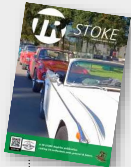
..... Group autumn run through the Peak district