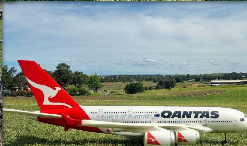
Angus Permewan Qantas A380