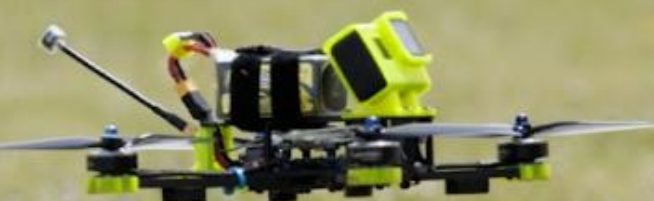
The drone at the heart of a lot of these photos