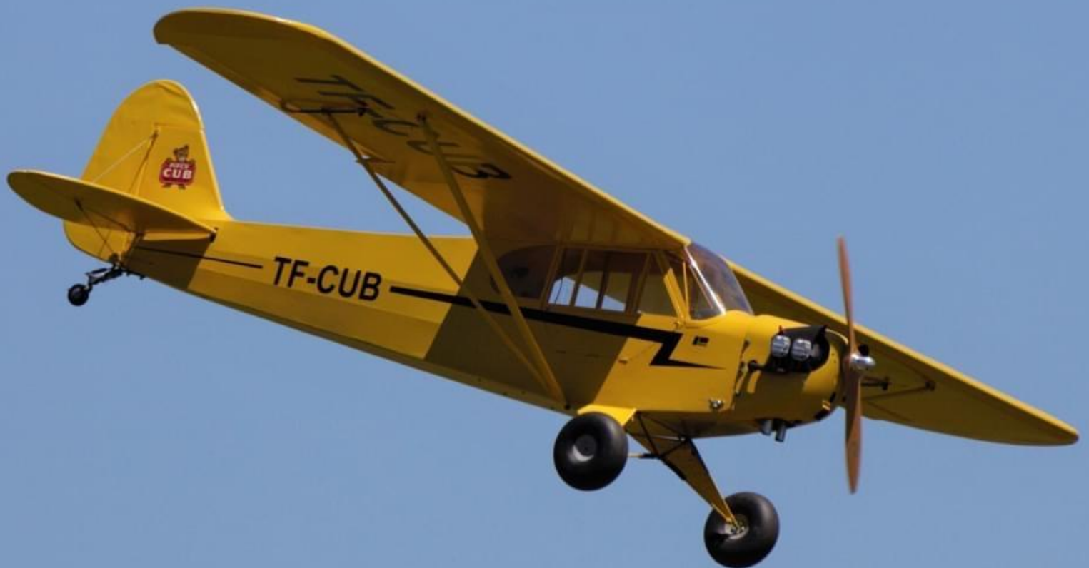
Tims 1/4 scale Cub in full flight