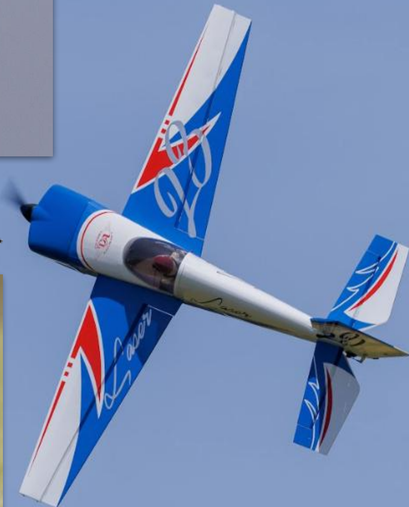
Just another knife edge pass by Avians Laser