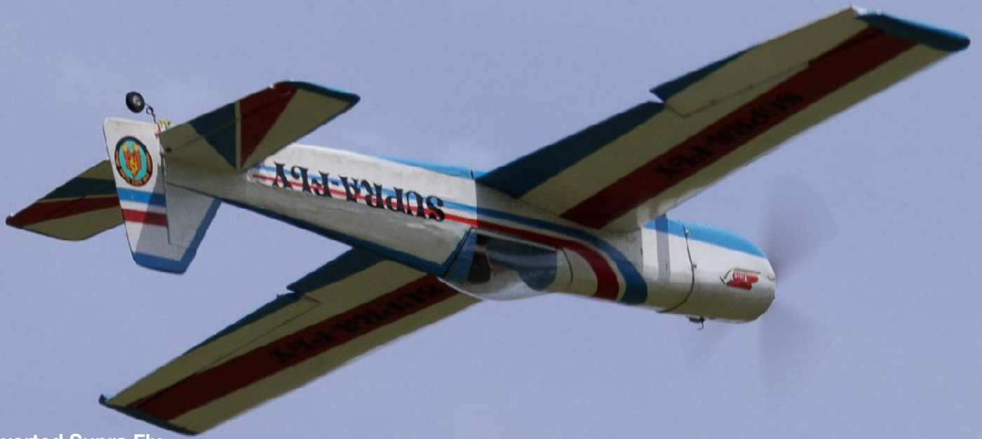
An inverted Supra Fly