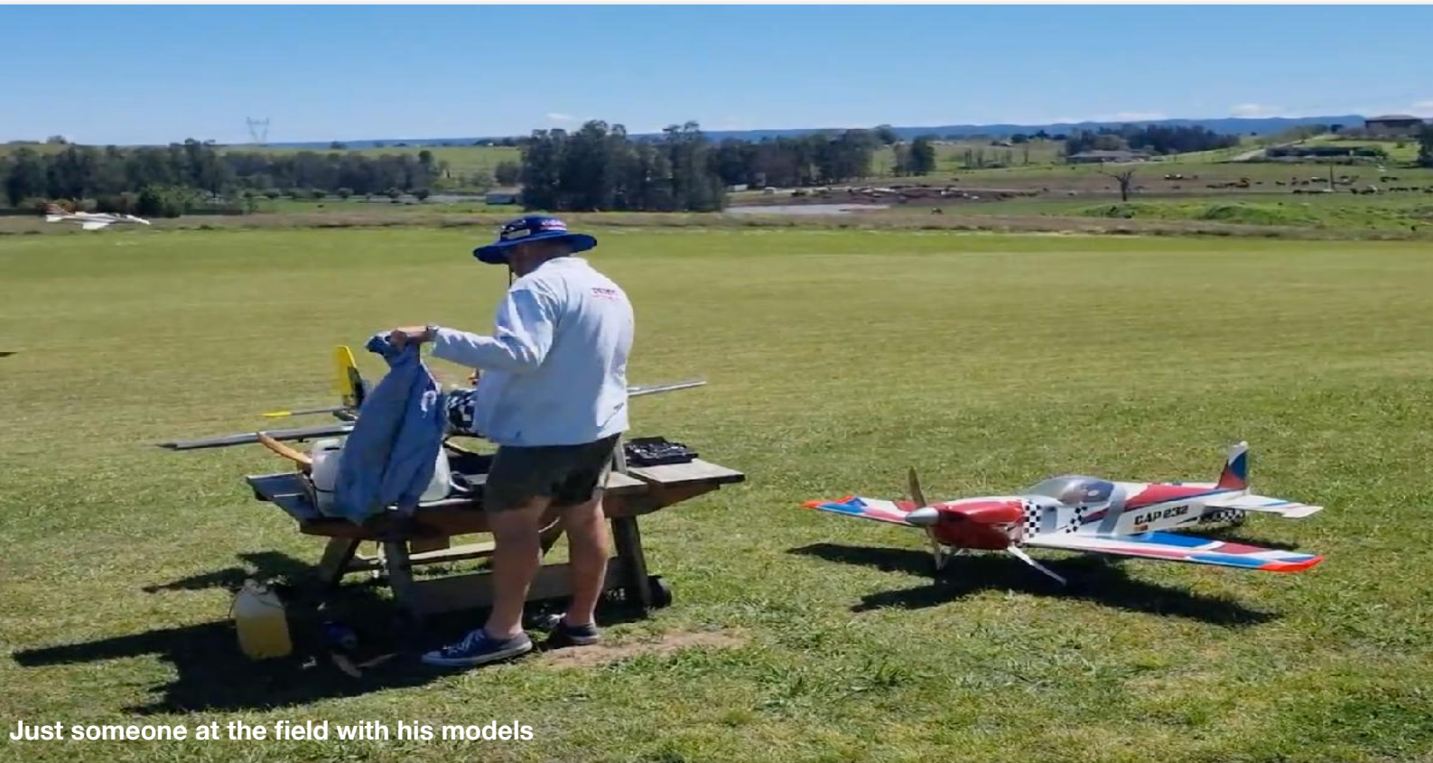
Just someone at the field with his models