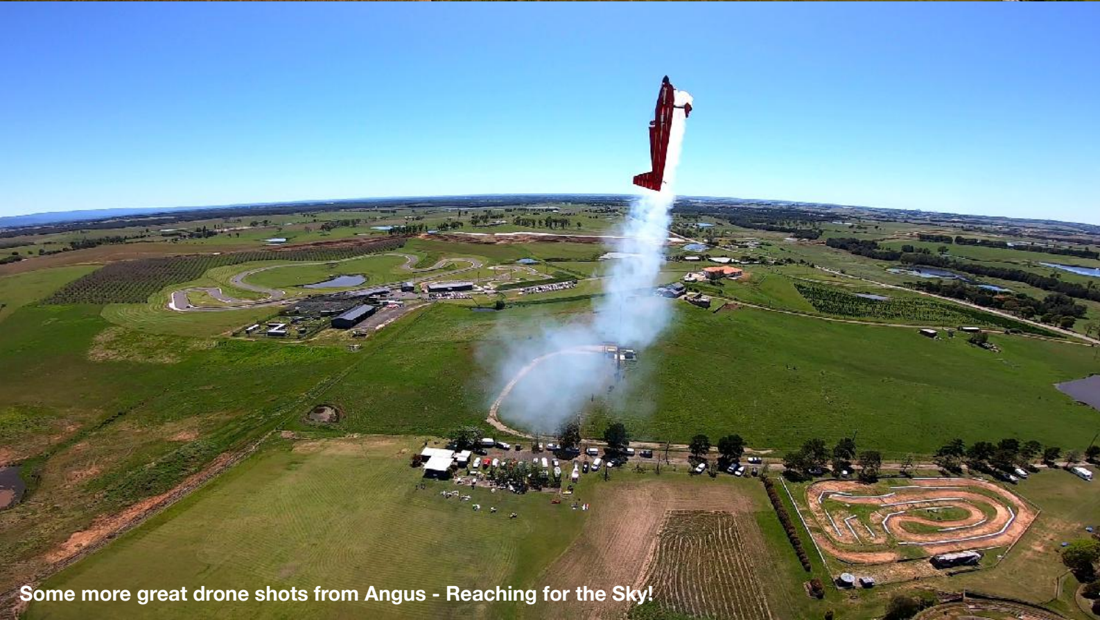
Some more great drone shots from Angus - Reaching for the Sky!