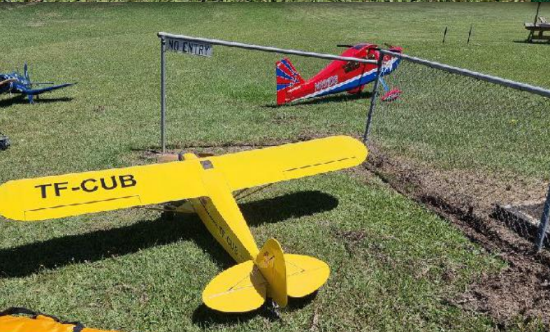
Tim Nolans - 1/4 scale Cub