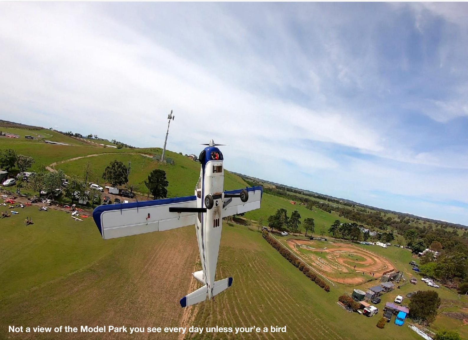
Not a view of the Model Park you see every day unless your'e a bird