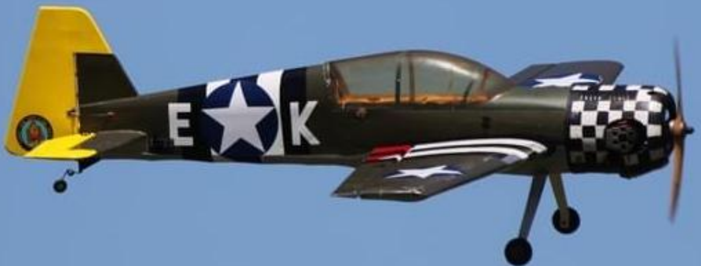
A YAK that thinks it's a P-40 is still just a YAK!