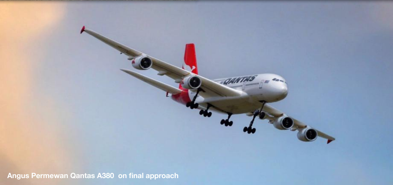
Angus Permewan Qantas A380 on final approach