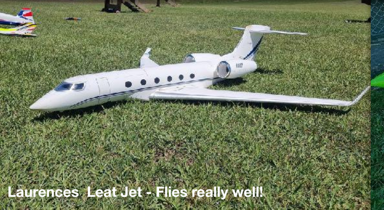
Laurences Leat Jet - Flies really well!