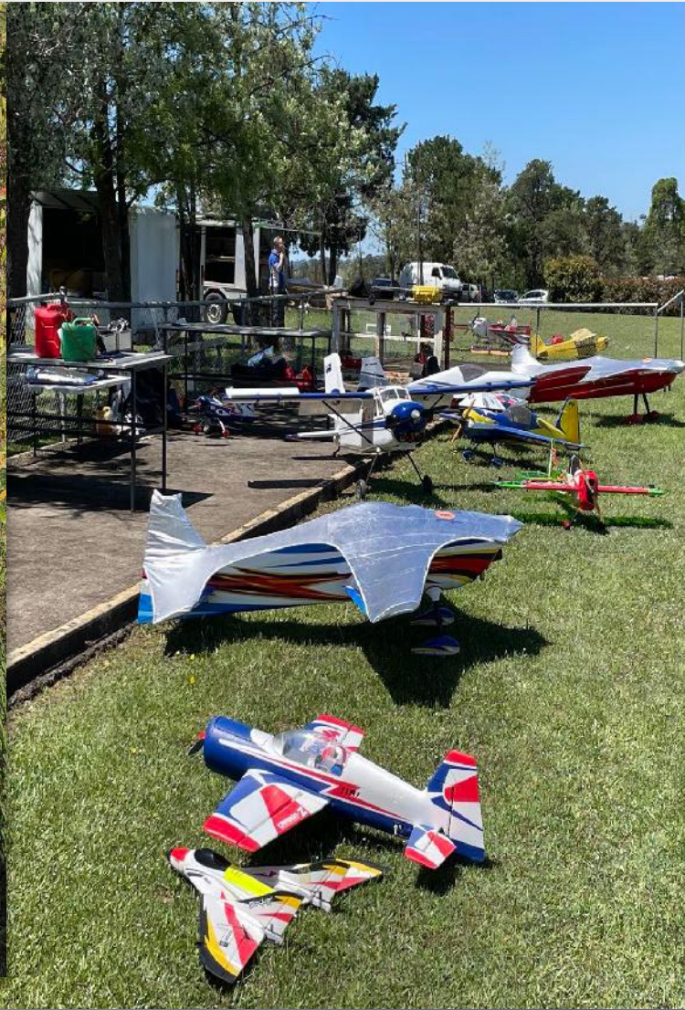
Just some of the gear for sale at the swap meet