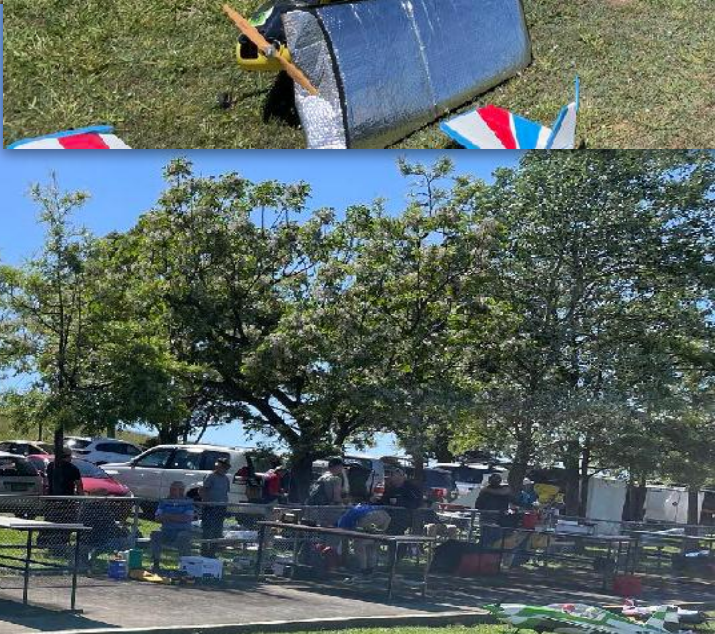
Planes, Plane and some more planes