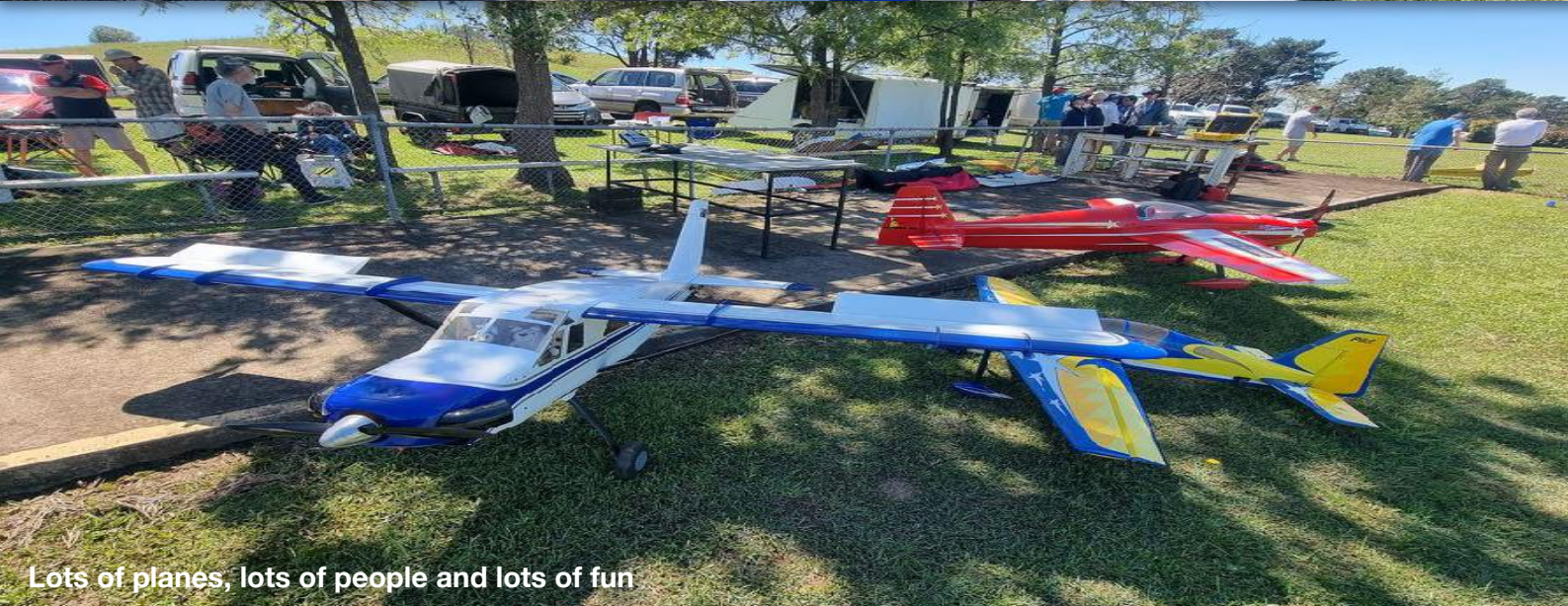
Lots of planes, lots of people and lots of fun