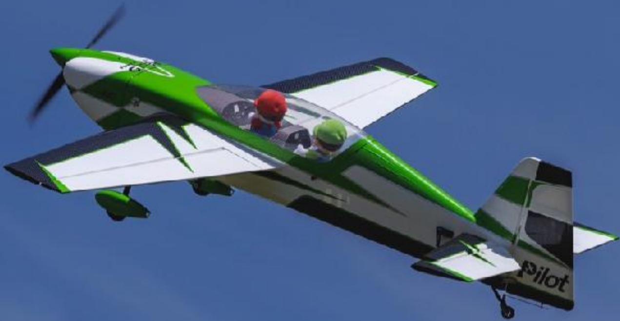
Mario and Luigi making a few holes in the clouds