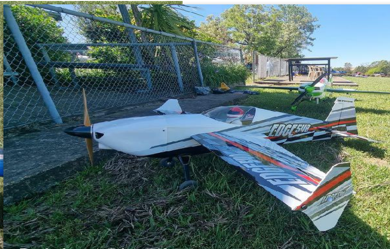
Pauls foamy Edge 540