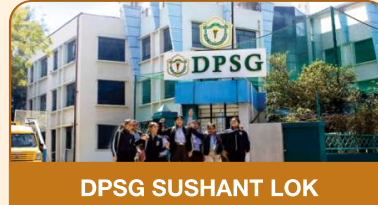
DPSG SUSHANT LOK