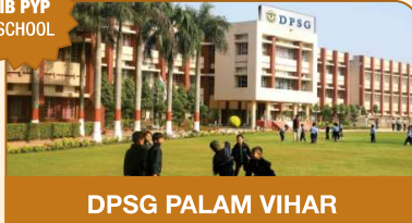
DPSG PALAM VIHAR