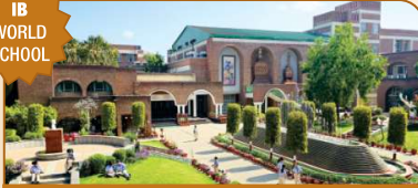
DPSG MEERUT ROAD