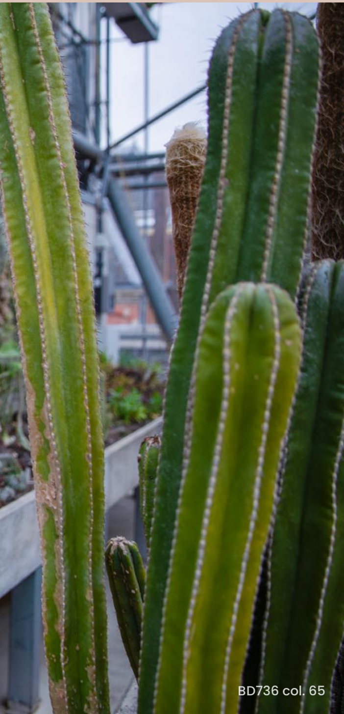
BD736 col. 65