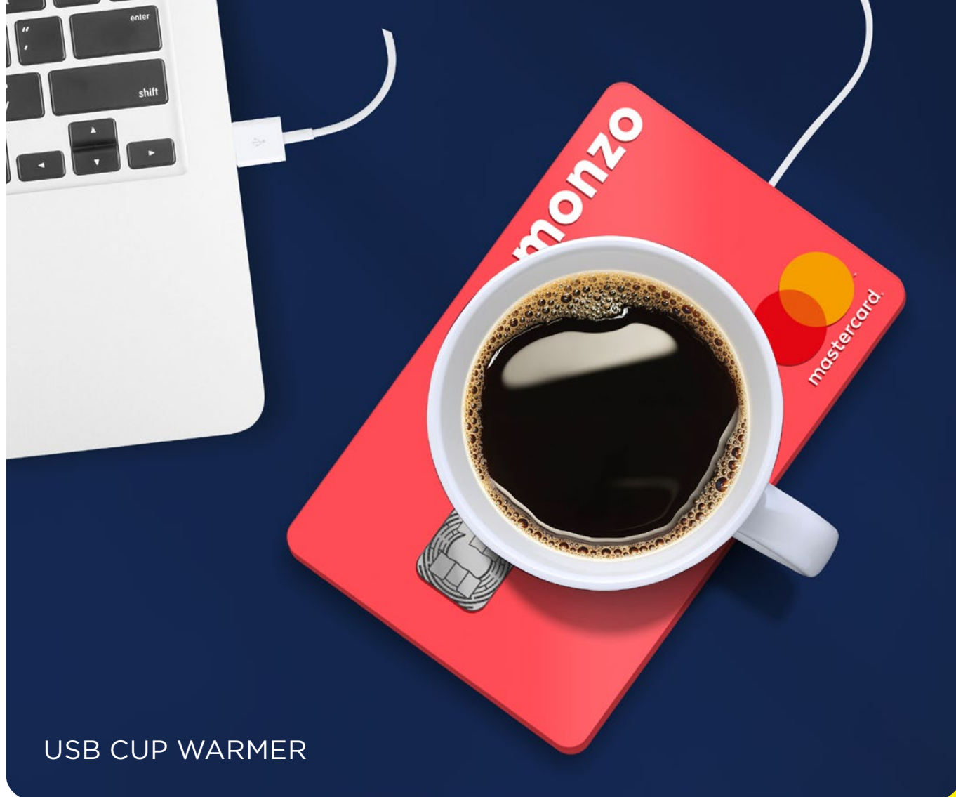
USB CUP WARMER

Mustard loves working with forward-thinking, innovative brands to deliver merchandise that reflects what you stand for. We're not here to fill a last-minute gap but provide you with a statement that will make an impact and separate you from the competition.