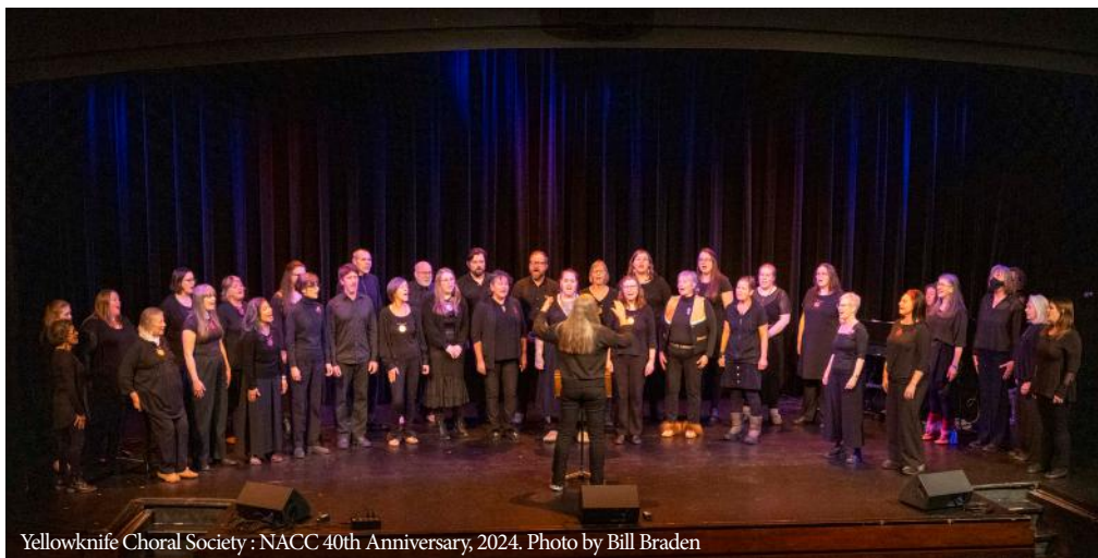
Yellowknife Choral Society : NACC 40th Anniversary, 2024.