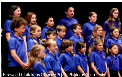
Fireweed Children's Chorus, 2024.