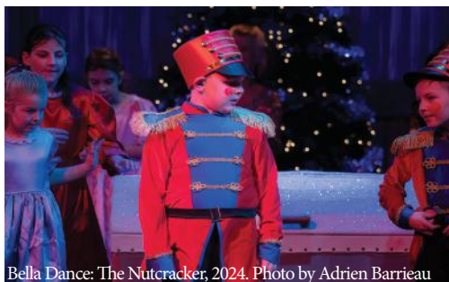
Bella Dance: The Nutcracker, 2024.

June 2026: Bella Dance Academy, Yellowknife Youth Choir