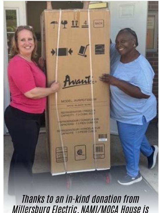
Thanks to an in-kind donation from Millersburg Electric, NAMI/MOCA House is enjoying a mini fridge received at our Core Community Partner event.

We live here, work here, and serve here. Because we are deeply rooted in Wayne and Holmes Counties, we understand local gaps and can respond quickly when new needs arise, whether it's housing instability, transportation barriers, or unexpected emergencies.