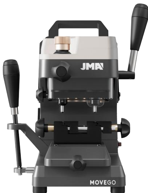
AM152 MOVE GO

\ Autonomous, mobile Mortice machine with a built-in battery so you can work wherever you need to, without requiring an external power supply.