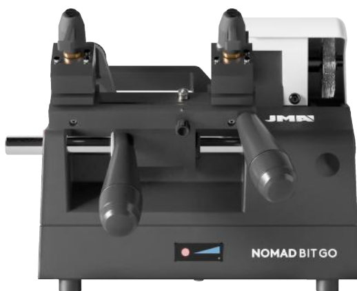
AM151 NOMAD BIT GO

\ Semi Automatic Mortice machine with additional speed and safety features.