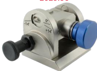
Multicode Magnum Jaw