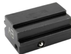
JMA Multicode Jaw - A3