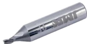
JMA Multicode Cutter 9F (Magnum)