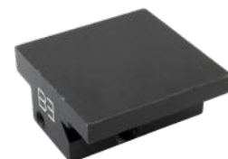
JMA Multicode Jaw - B3

In accordance to current legal dispositions related to industrial property, the brands or commercial names indicated in this catalogue are the exclusive property of the manufacturers of cylinders and locks, as well as the manufacturers of automobiles. These brands or commercial names are used as mere information in order to quickly recognise the lock to which our parts correspond.