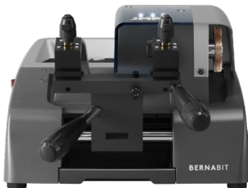
AM150 BERNA BIT