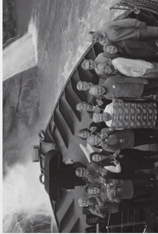
University of Wisconsin alumni on Orbridge's Discover Southeast Alaska 2023 travel program.

PRRST STD U.S. POSTAGE PAID PERMIT NO. 825 SAN DIEGO, CA