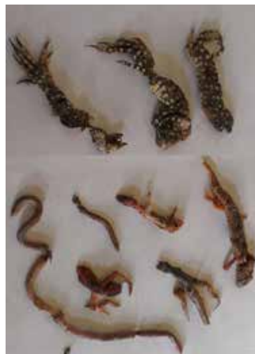
Cat stomach contents, including several reptile parts.

Originally published by the Conversation https://theconversation.com/a-hidden-toll-australias-cats-kill-almost-650-million-reptiles-a-year-98854