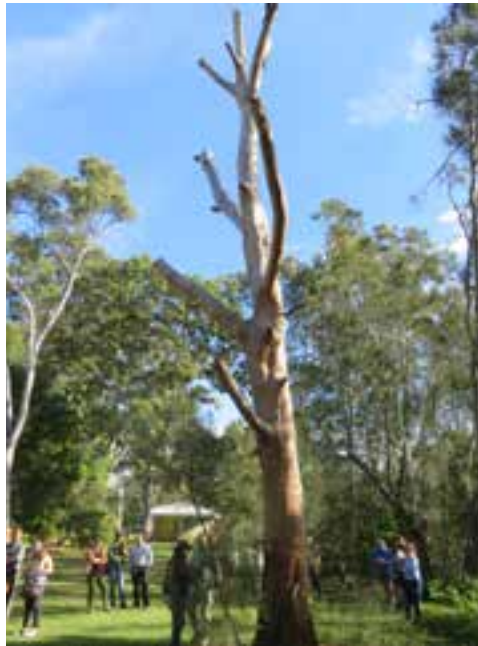
Park veteran tree (G Siepen)

As a tree ages it accumulates more and more dysfunctional tissue which imposes limitations on the vascular transport of water to the canopy peripheries. By slowly withdrawing stored carbohydrates from upper and outer branches and concentrating growth of new shoots within the lower canopy, the tree becomes shorter and more stable. It allows the tree to conserve resources in stressful situations and to avoid catastrophic failure from excessive wind loading. If trees are to stay standing for a long time then they need to retain as much of the lower and internal branches as possible; they are the tree's superannuation pension