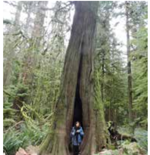
Cathedral grove Vancouver Island (G Siepen)

Veteran trees located near tracks and roads can be protected from human and vehicle risks by fencing. Ideally, any tracks should be located 15 X DBH (of the