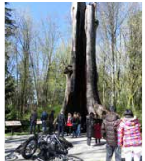
Hollow tree - visitation (G Siepen)

Retaining and protecting old trees should be part of every national park management plan, but because these trees often occur in inaccessible locations, very little management is usually carried out. Management strategies should include minimizing disturbance