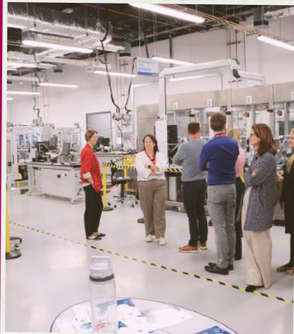
Boston Scientific Visit