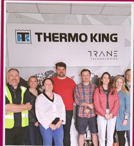
ThermoKing Trane Technologies