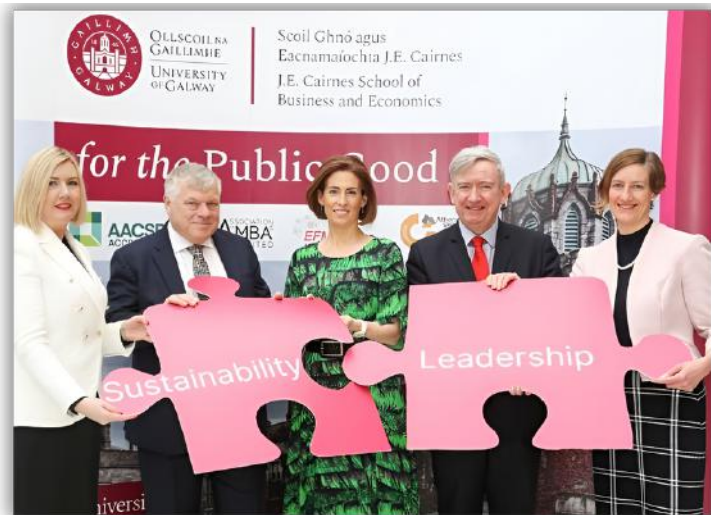
Official Launch of the MSc Sustainability Leadership programme with Minister Hildegarde Naughton T.D, Chief Whip and Minister of State at the Department of Health.

The curriculum includes an international study trip to Bologna Business School, Italy.