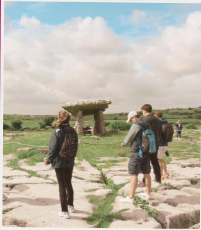
Burren & Cliffs of Moher UNESCO Global Geopark

Students gain sustainability leadership expertise through hands-on experience with international organisations. On-site visits offer valuable insights and networking opportunities, enhancing their learning.