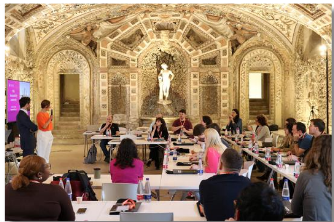
International Study Trip to Bologna Business School (Italy) 2024