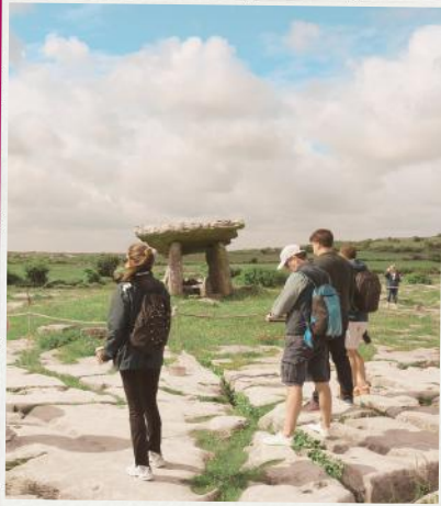
Burren & Cliffs of Moher UNESCO Global Geopark

Students gain sustainability leadership expertise through hands-on experience with international organisations. On-site visits offer valuable insights and networking opportunities, enhancing their learning.