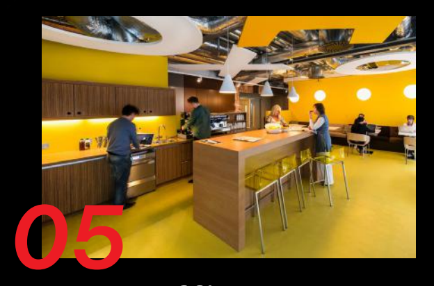
Large office Barista coffee