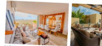
LADERA, E-609 3BD | MLS #24-918

Large flat lot with private cove and beach access—perfect for a boutique hotel or luxury residences. Request more details.