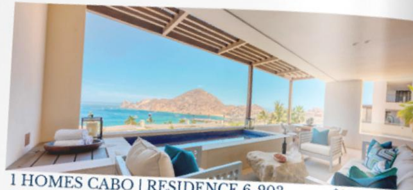
1 HOMES CABO | RESIDENCE 6-203 Cabo San Lucas | 4BD | MLS #23-3414