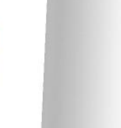
CASA BONITA 4BD | MLS #24-3372

Luxury villa with stunning Cabo views, elegant furnishings, and a private patio for gatherings.