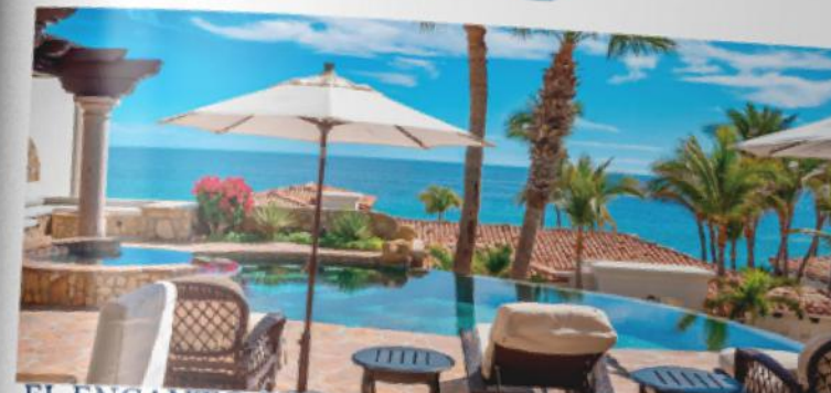
EL ENCANTO DE LA LAGUNA Casa Blanca | 2ND ROW | 3,698 AC sq. ft. San Jose del Cabo | 4BD | MLS #23-1288