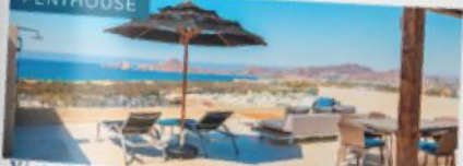
VISTAVELA Phase One Cabo Corridor | 3BD | 1401 MLS #24-383