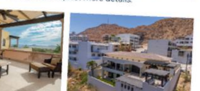
EL CIELITO, RP 3BD | MLS #24-1164

Furnished 3-bedroom condo near schools, hospitals, and private patio for gatherings.