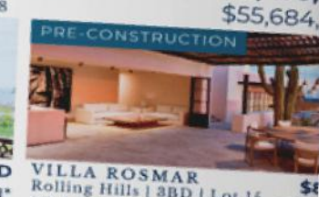
VILLA ROSMAR Rolling Hills | 3BD | Lot 15 MLS #23-4601