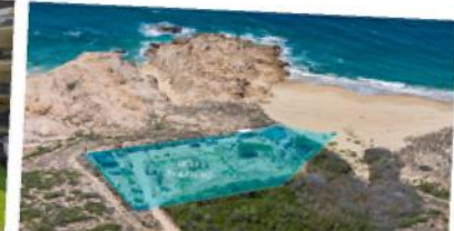
RANCHO LAS MARGARITAS 4,435 m2 | MLS #24-4361

Gorgeous remodeled 2-bedroom ocean-view apartment with large terrace, pools, gym, and minutes from the beach in Cabo's Puerta del Sol.