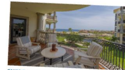
PUERTA DEL SOL, B301 2BD | MLS #24-2558