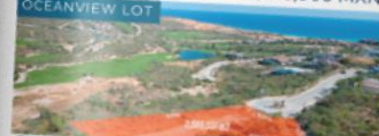
PUERTO LOS CABOS El Altillo Lot 79 MLS #23-3243