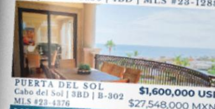
PUERTA DEL SOL Cabo del Sol | 3BD | B-302 MLS #23-4376