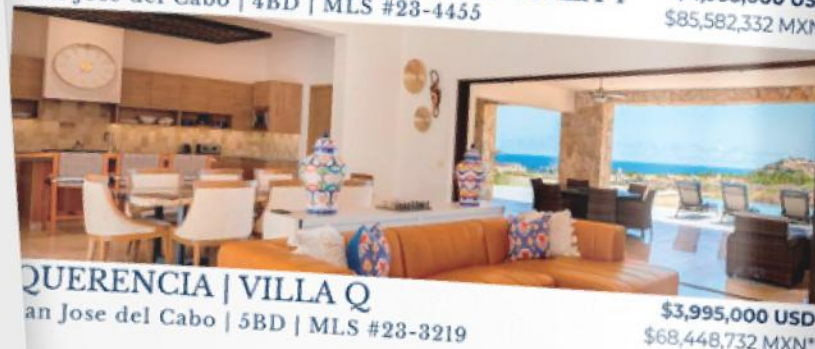
QUERENCIA | VILLA Q