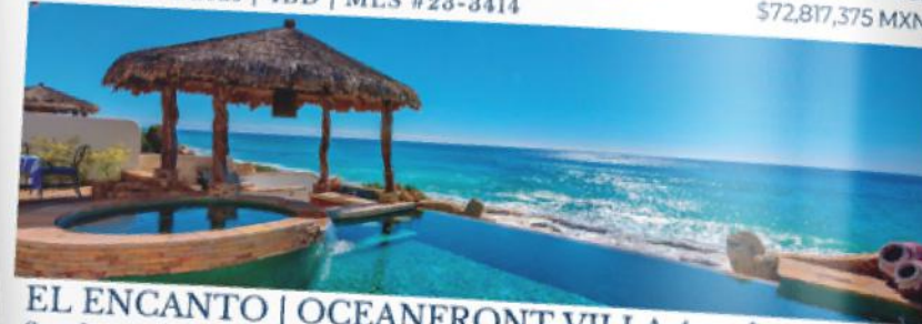
EL ENCANTO | OCEANFRONT VILLA 4 San Jose del Cabo | 4BD | MLS #23-4455