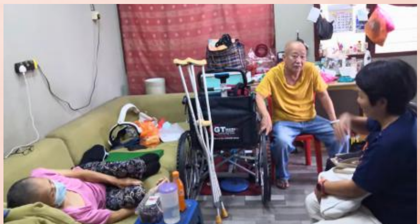
Family 3: Sickly husband & terminally ill wife. (financial aid & a wheelchair)