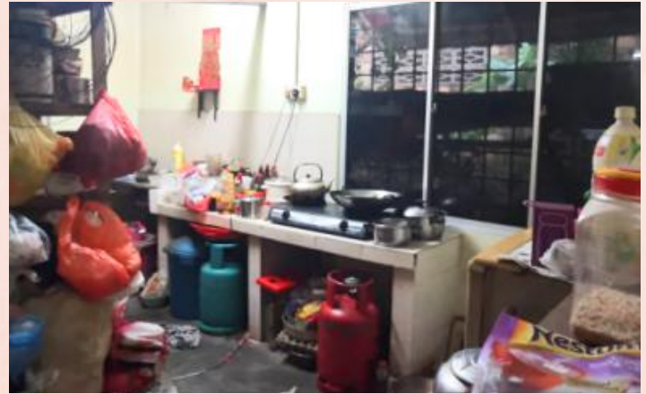
Family 1: Mother with a special needs daughter (food & provisions )