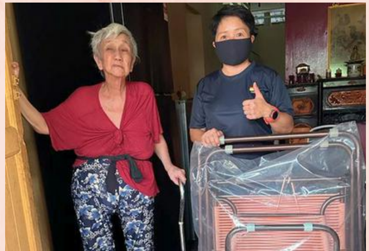
Family 2 : Elderly grandmother, grand daughters & sons (adult diapers, provisions & gas cyclinder)