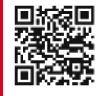
SCAN TO VIEW OUR FINANCIAL PROSPECTUS

Being fiscally responsible isn't something we just say... it's something we prove with every financial decision we make, while still ensuring that our mission statement holds true: "Everything WE do is designed to provide a future-ready, student-centered learning experience for every single child."